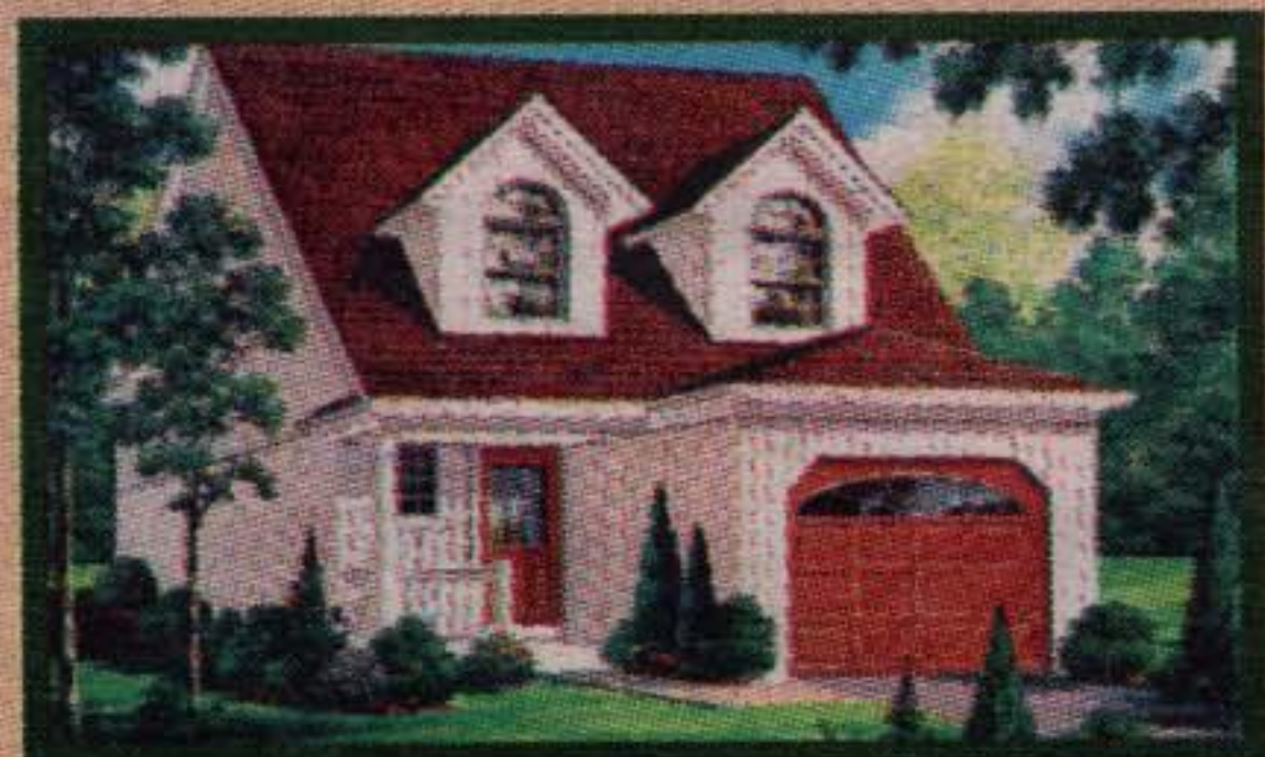
The Morningside 1163 sq.ft. $150,900