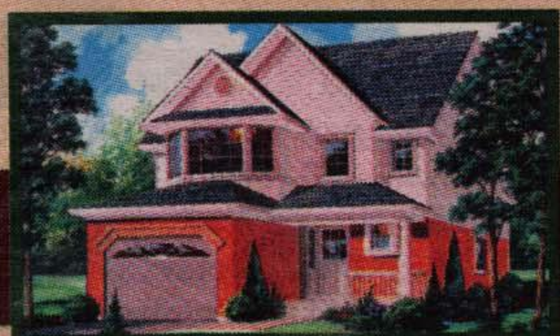
The Stonebrook 1607 sq.ft. $169,400