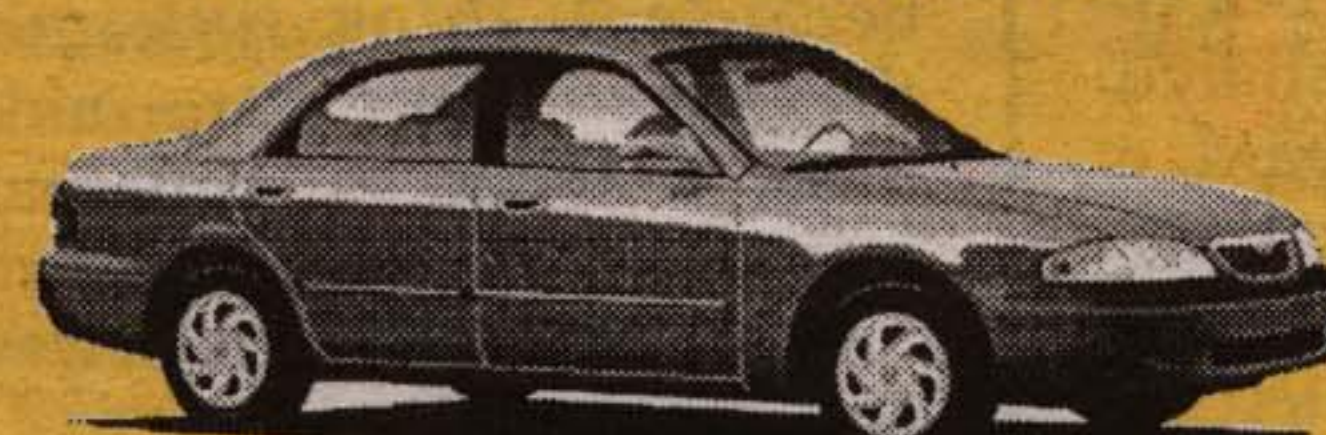
1999 MAZDA 626 LX 4

A Consumers Digest - BEST BUY • 3L V6 • Am/Fm cassette • Rear ABS