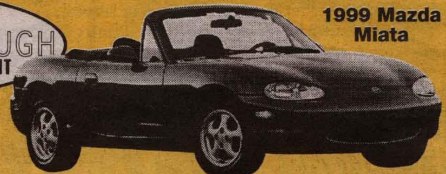
1999 Mazda Miata

Presents SPRING BREAKTHROUGH SALES EVENT