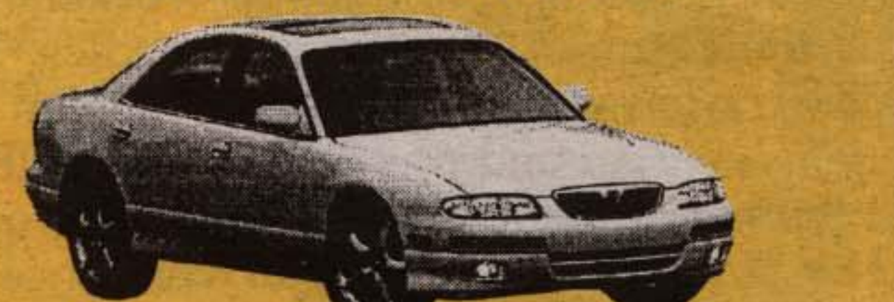
1999 MAZDA MILLENIA S

You can also get a Mazda 626 LX for less than a Camry LE - 4 cylinder* • Auto • Air conditioning • CD player • Power group