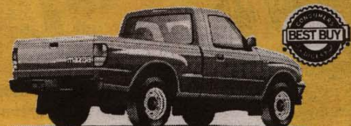
1999 MAZDA B3000 V6

Class Winner of the 1999 AJAC Car of the Year Awards • Roomiest car in its class • CD Player • 14" wheels