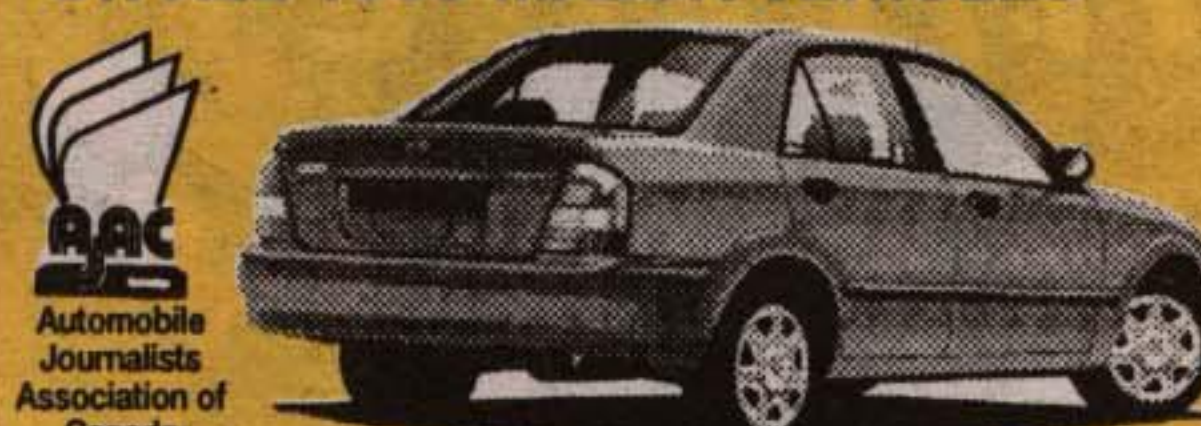
1999 MAZDA PROTEGE SE

1.9% APR FINANCING FOR UP TO 48 MONTHS ON ALL 1999 MAZDA VEHICLES