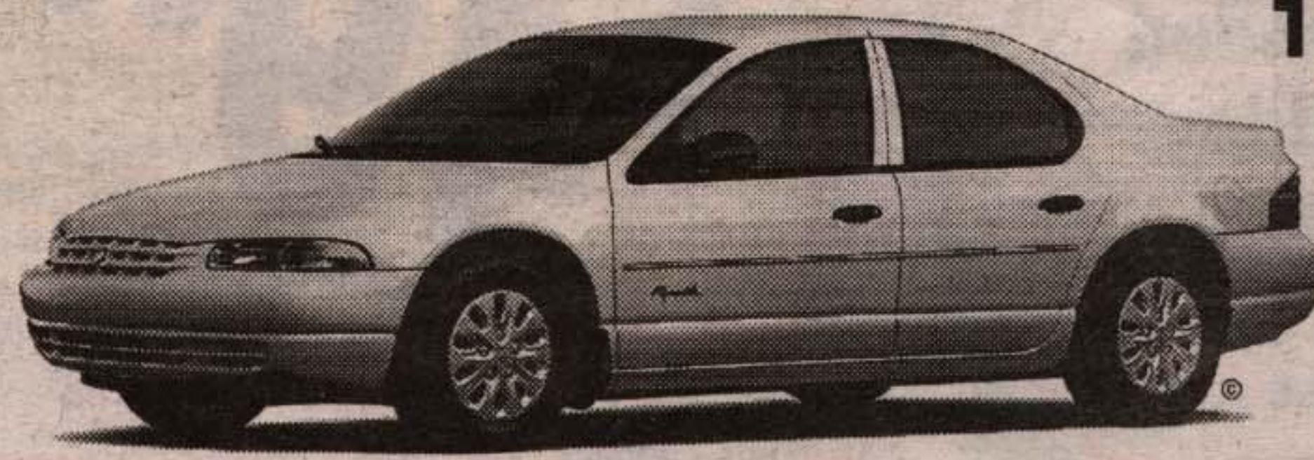
1999 Stratus /Breeze 24A Package

1999 Neon gives you the best value and fun it's class. 22D Package Includes: •2.0L 16 Valve 132 hp engine •Automatic transmission •"Next-Generation" dual air bags •Tilt steering •60/40 Split folding rear seat •Remote trunk release •Air Conditioning •Floor console •Tinted Glass •AM/FM Stereo cassette with CD Controls & Port •Child protection rear door locks •Side-door impact beams •Plus a complimentary tank of fuel! ††