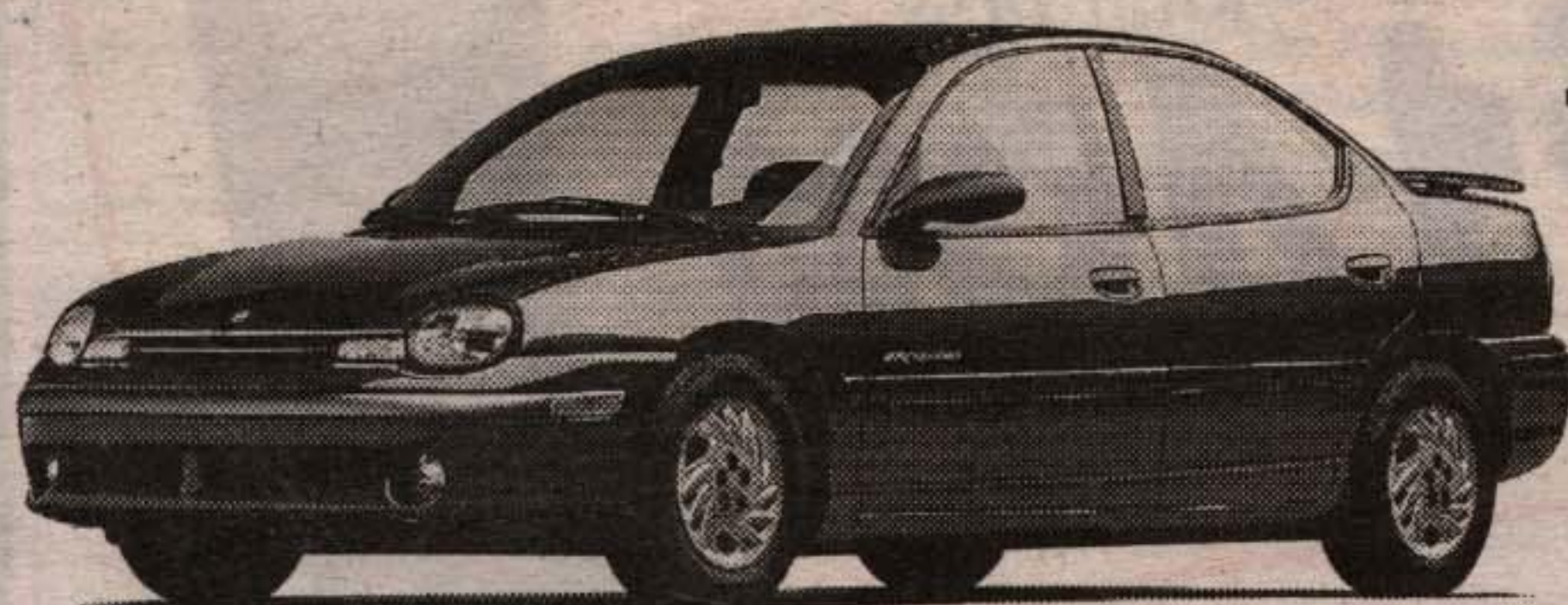
1999 Neon 22D Package

THERE'S NEVER BEEN A BETTER TIME TO PUT YOURSELF IN A CHRYSLER. SPECIAL LEASE RATES AND FACTORY PURCHASE FINANCING ON SELECTED MODELS AND MORE. PLUS A CHANCE TO WIN CANADA'S #1 MINIVAN*.