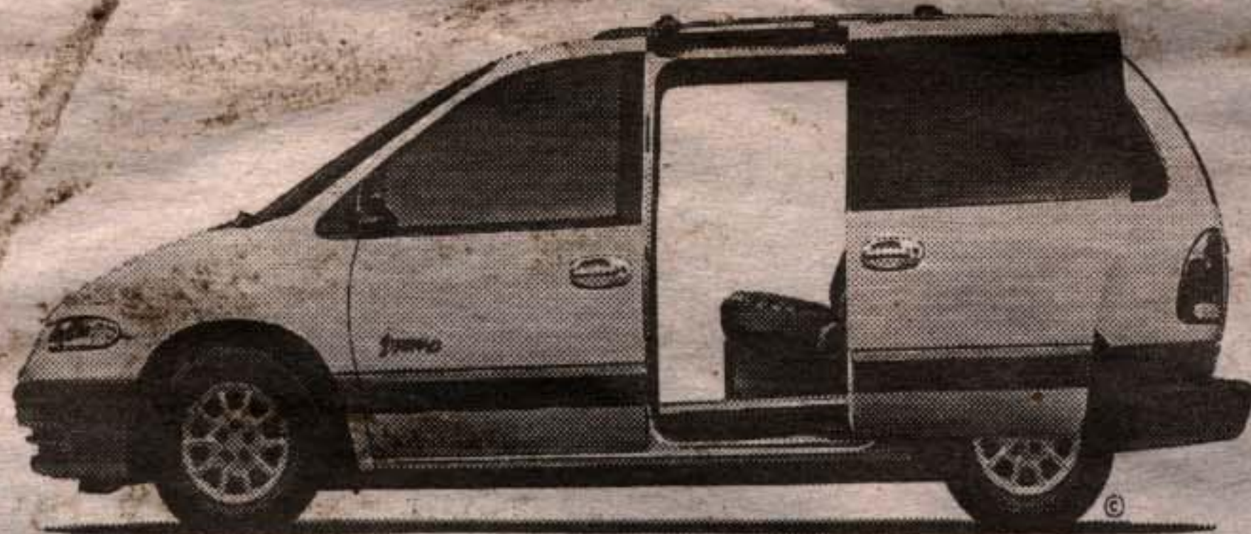
1999 Dodge Caravan/Plymouth Voyager All New 26T Family Value Package