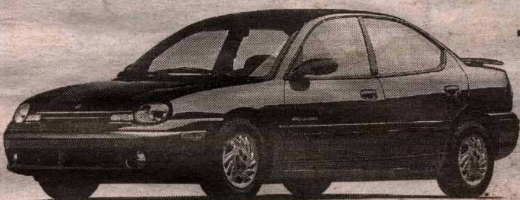
1999 Neon 22D Package

THERE'S NEVER BEEN A BETTER TIME TO PUT YOURSELF IN A CHRYSLER. SPECIAL LEASE RATES AND FACTORY PURCHASE FINANCING ON SELECTED MODELS AND MORE. PLUS A CHANCE TO WIN CANADA'S #1 MINIVAN*.