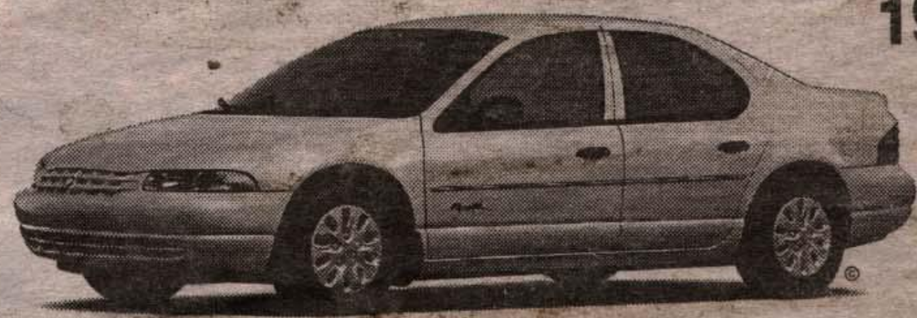
1999 Stratus /Breeze 24A Package