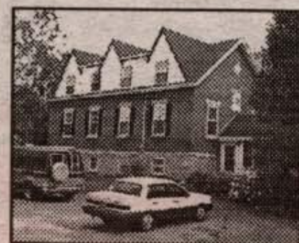
4 Bedroom Old School House Erin "MUST SEE"