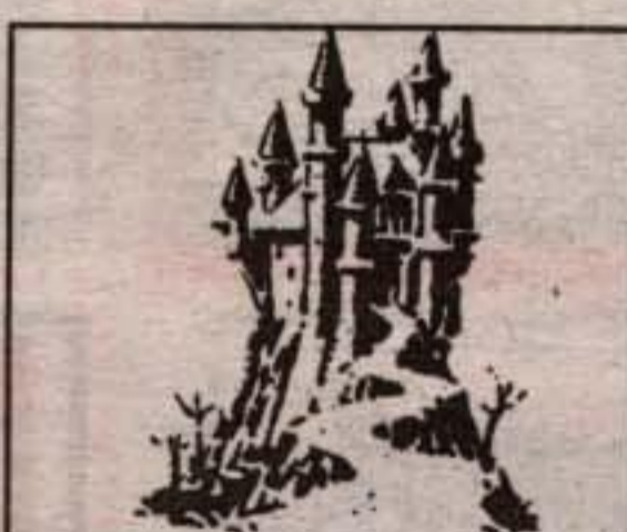
Build Your Castle 87 acres in Erin

RE/MAX BLUE SPRINGS REALTY (Halton) CORP.