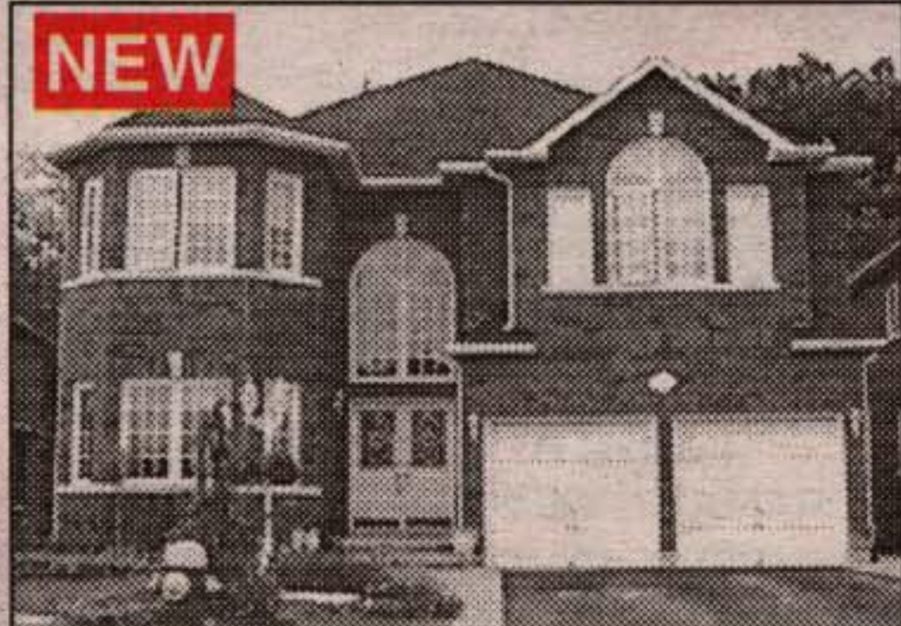
NEW RAVINE SETTING, GEORGETOWN SOUTH

Are you renting or living in a townhouse and looking for some space & privacy? This three bedroom, 10 year old, 2 storey home could be your obvious answer to your needs. This well maintained family home is set on a good size professionally landscaped lot. The kitchen is family size with sliding doors leading to the deck & backyard for those evening barbeques. The other rooms are a good size with a large basement waiting for your completion. Priced at $144,900. Call Dave Krause* to view.