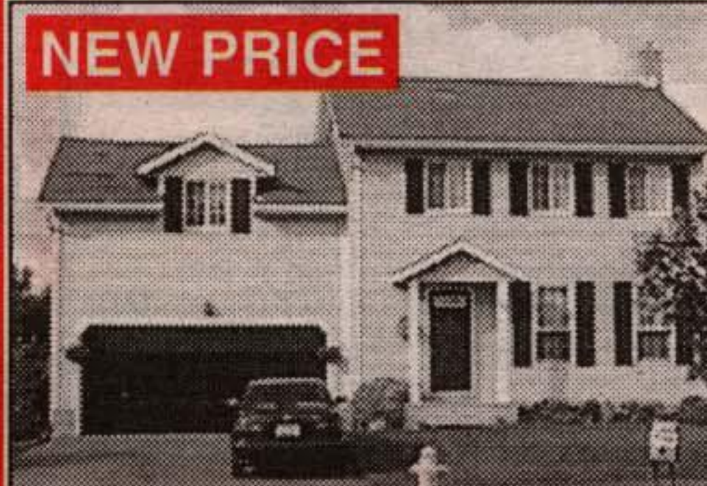
NEW PRICE WELCOME TO ROCKWOOD

ooze from this 3 bedroom, two storey home located in Georgetown. Lots of wood, high baseboards, original trim, screened in front porch/verandah & gas fireplace in the living room makes this home a cozy hideaway. Features of this home include most new windows, new pine kitchen 2 years old, most new drywall, mid-efficiency gas furnace and big backyard with a good size shed. Priced at $176,900. Call Dave Krause* to view.