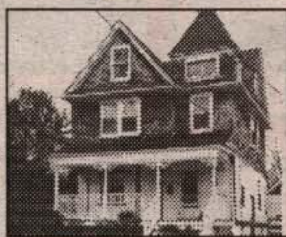
4 Bedroom Century Olde Weston