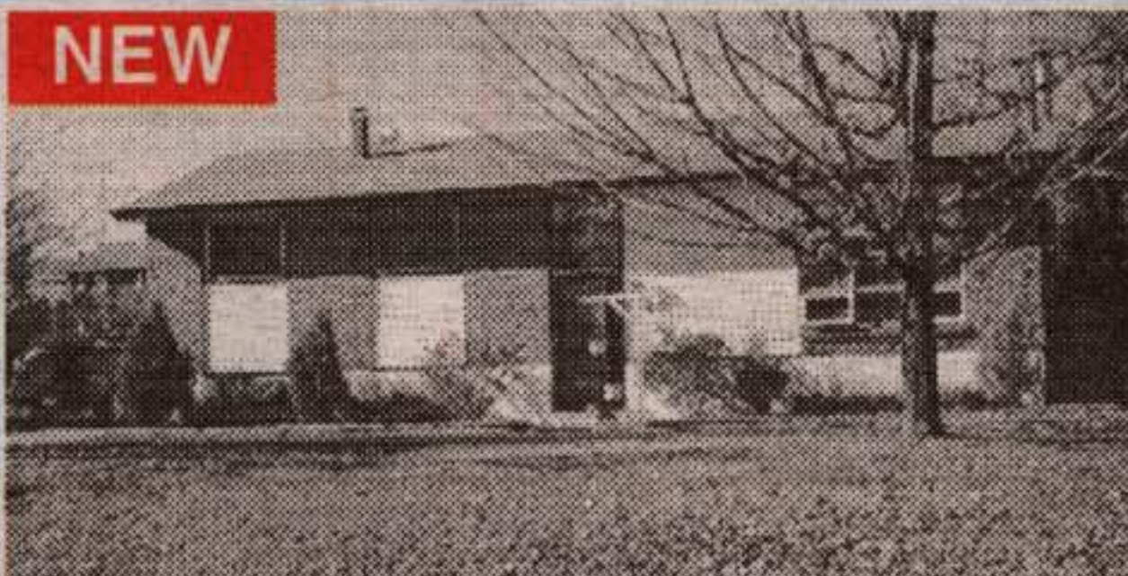
NEW RETIREES OR FIRST TIME BUYERS $169,900

Excellent raised bungalow on quiet street in small village, large lot, finished rec. room also sparkling hardwood floors on main level. Close to shopping and arena. Come and see this well kept home with Norinne* today.