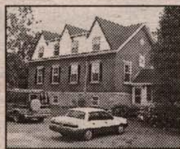
4 Bedroom Old School House Erin "MUST SEE"