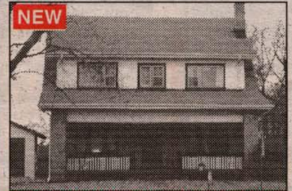
NEW BEAUTIFUL CENTURY HOME...

Setting right in the heart of the artisan sector. Century old home with country charm. Huge kitchen & large main floor rooms. Original pine floors & trim. Closed-in porch/mud room off kitchen. $139,900.