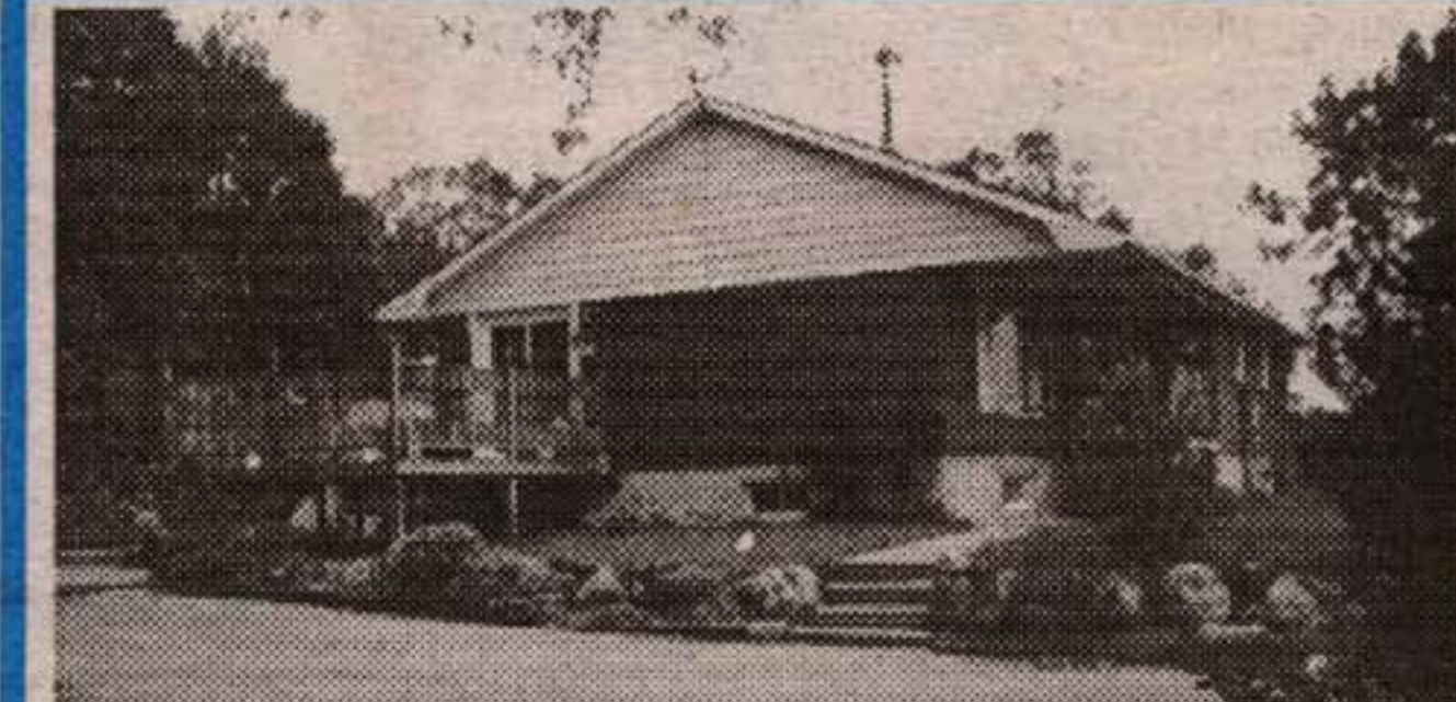
LOVELY COUNTRY BUNGALOW $189,900

Excellent raised bungalow on quiet street in small village, large lot, finished rec. room also sparkling hardwood floors on main level. Close to shopping and arena. Come and see this well kept home with Norinne* today.