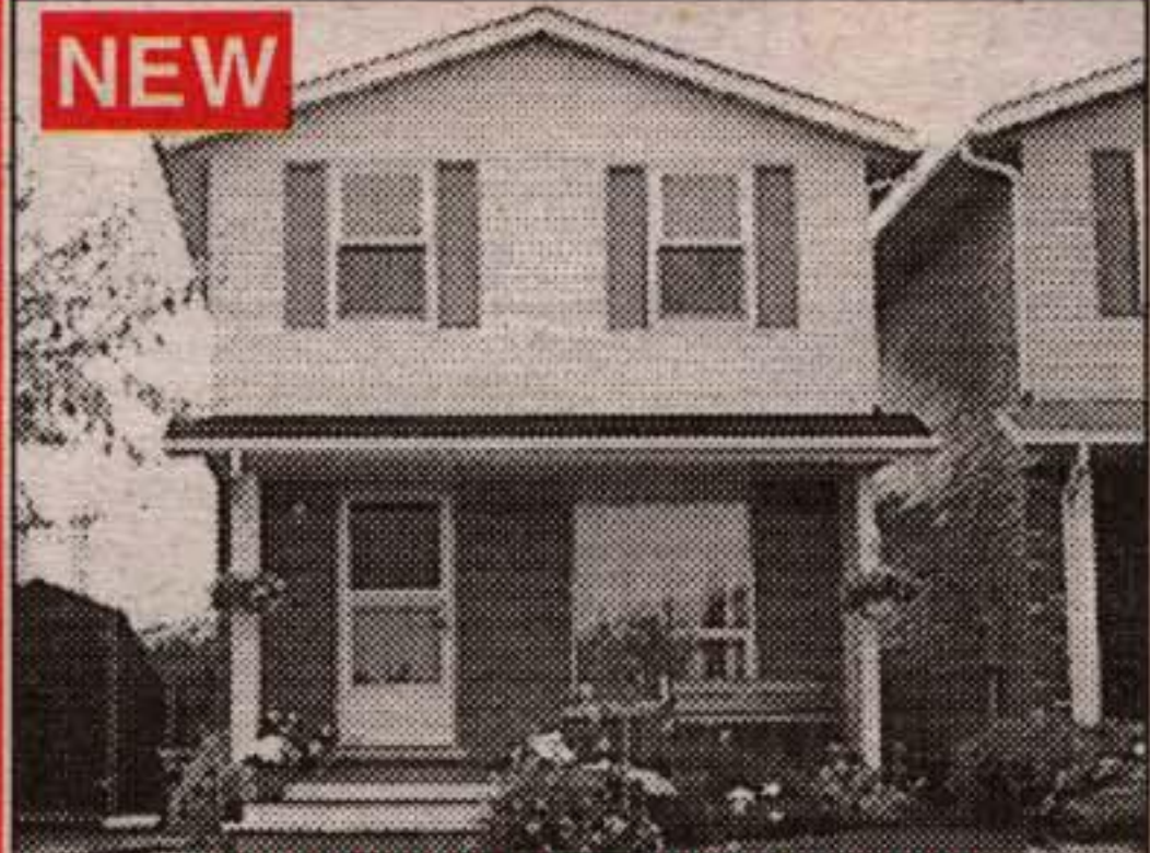
NEW EXCELLENT STARTER $144,900

Check our my Captain Financial Rates on page 2.