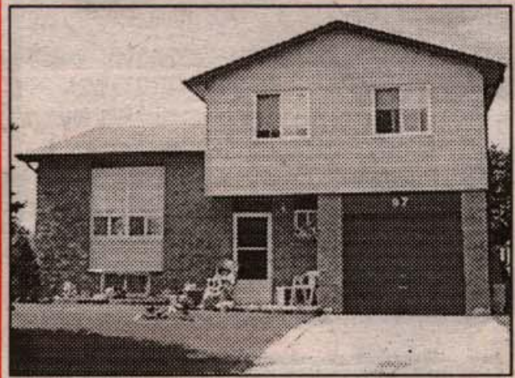
GORGEOUS SIDESPLIT WITH LARGE LOT

A rare opportunity to purchase a unique property, "country in town". This is a must see. Features of this home includes eat-in kitchen with updated cupboards and a new bay window. Corner gas fireplace with an oak mantel in living room. Gas stove in family room. Hardwood floors in living room & dining room. Walkout from living room and family room to very private, ravine backyard. Master bedroom is on the second floor with two skylights & pine flooring & wainscoting. Professionally finished basement. Priced at $174,900. Call Dave Krause* to view.