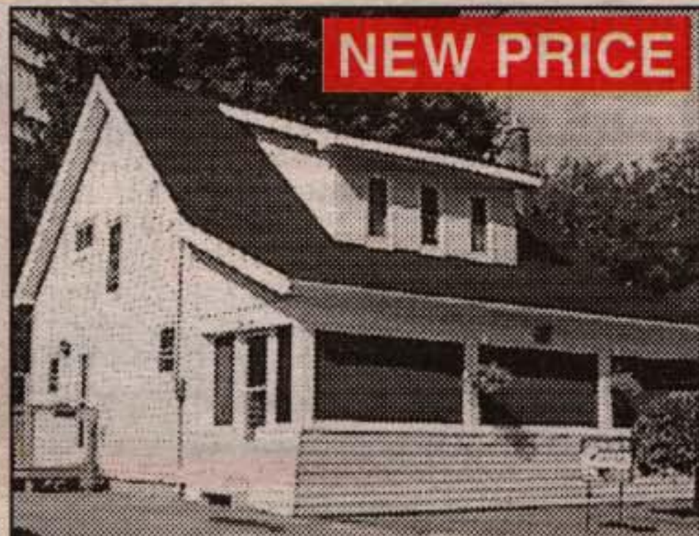
NEW PRICE CHARACTER & CHARM . . .

This three bedroom brick & vinyl sidesplit is finished from top to bottom & located in the quaint Village of Hillsburgh. Features of this home includes: large principal rooms, lots of pine wainscoting, some new broadloom, freshly decorated, kitchen overlooks family room that has a FP with a wood burning insert & walkout to a large fenced backyard which is professionally landscaped. The rec room is also finished. The driveway & flower beds are all interlock stone & are beautiful. This home shows "Pride of Ownership" and is priced at $179,900. Call Dave Krause* to view.