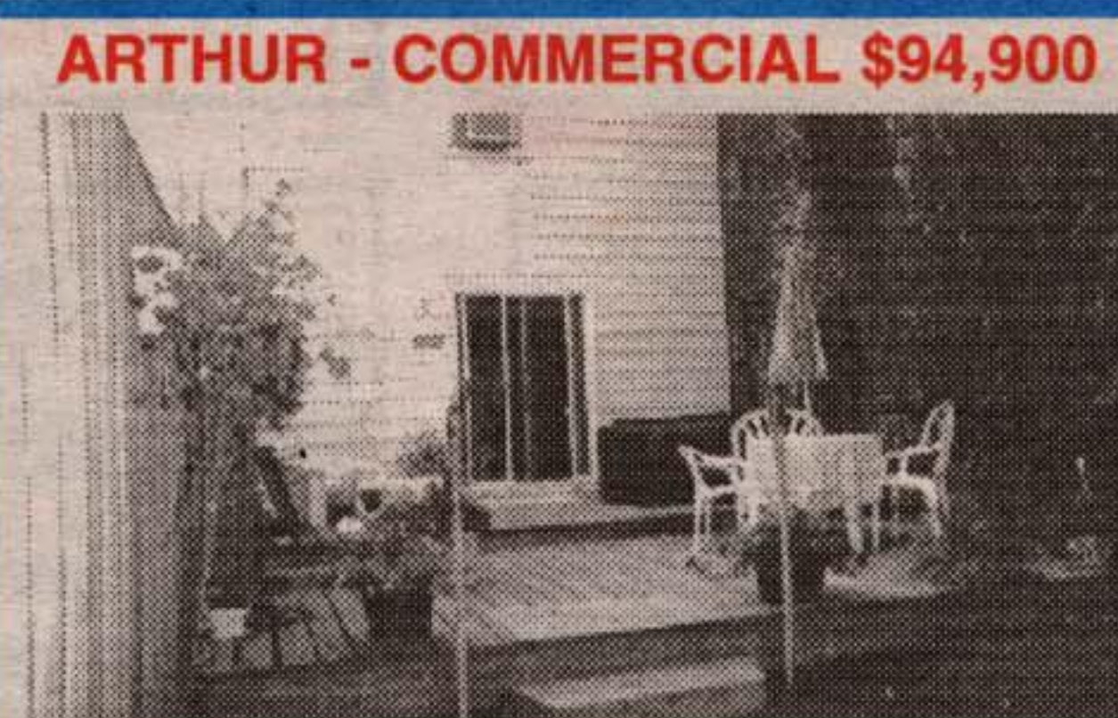
ARTHUR - COMMERCIAL $94,900

4 bedrooms. Large living room with woodstove. Walkout from kitchen to 12'x15' deck. Bright 2 bedroom inlaw suite with large living room and built-in oven and counter top. Huge yard in area of large pond.