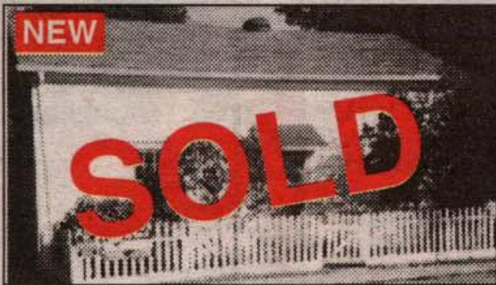
NEW SOLD QUAINT GLEN WILLIAMS

Setting right in the heart of the artisan sector. Century old home with country charm. Huge kitchen & large main floor rooms. Original pine floors & trim. Closed-in porch/mud room off kitchen. $139,900.