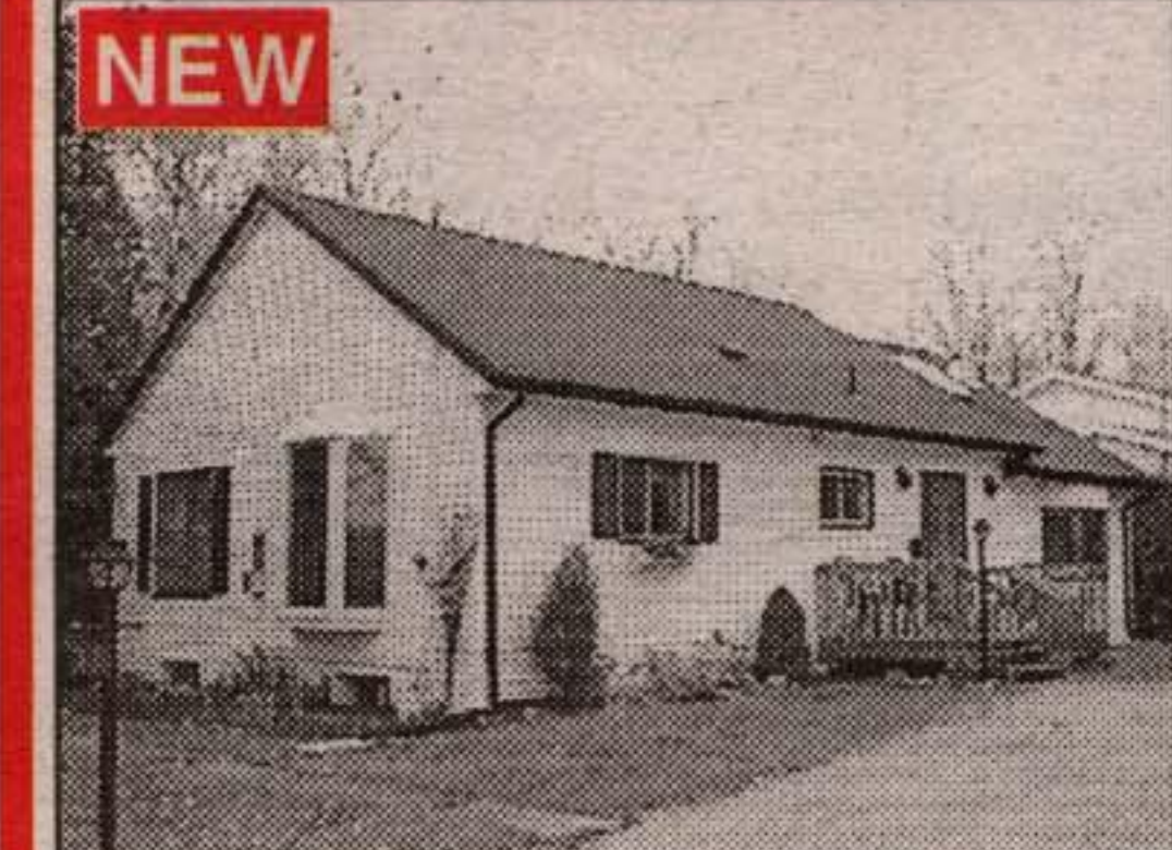
NEW COUNTRY IN TOWN

This gorgeous 2200 sq. ft. home is located close to a park in Georgetown South. Features of this home include large eat-in kitchen with Florida lighting, oak cupboards, B/I dishwasher & W/O to a large cedar deck & fenced yard. French doors lead to the L/R & D/R which features hardwood floors & a bay window. The family room has a woodburning fireplace & a W/O to the backyard. The upstairs has four bedrooms with a large MBR with a 4 pc. ensuite. Ceramics are in the kitchen & hallways. C/A is two years old. This home is in "move in condition" priced at $244,900. Call Dave Krause* to view.