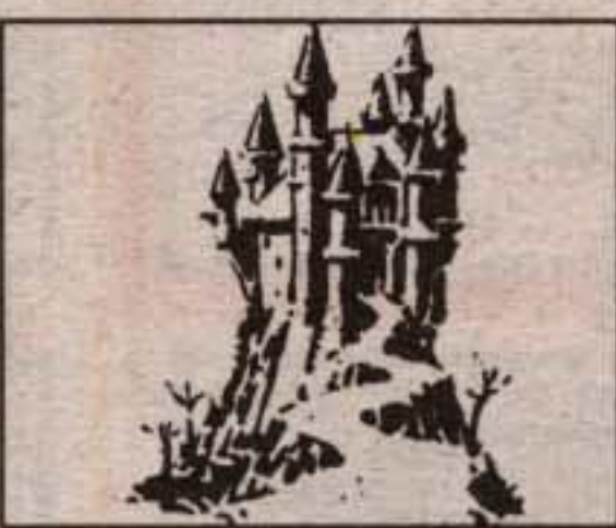
Build Your Castle 87 acres in Erin

RE/MAX BLUE SPRINGS REALTY (Halton) CORP.