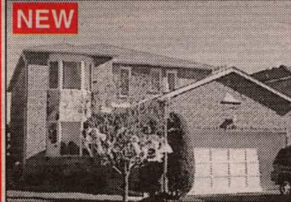
NEW LISTING IN GEORGETOWN SOUTH

Gorgeous 3200 sq. ft. 2-storey brick home, having a professionally finished basement & backs onto a ravine in Georgetown South. $50,000 to $60,000 has been spent on upgrades. Features of this home include lots of hardwood floors, ceramics, broadloom, 3 gas fireplaces, lots of windows, crown mouldings, pot lighting, French doors, beautiful family room with 18 ft. ceiling in family room, 9 ft. ceilings on main floor in the other rooms. Built-in entertainment center in family room, gorgeous kitchen, 2 bedrooms in basement, one has a 3 piece ensuite which would lend itself beautifully for that teenager. Priced at $389,000. Call Dave Krause* to view.