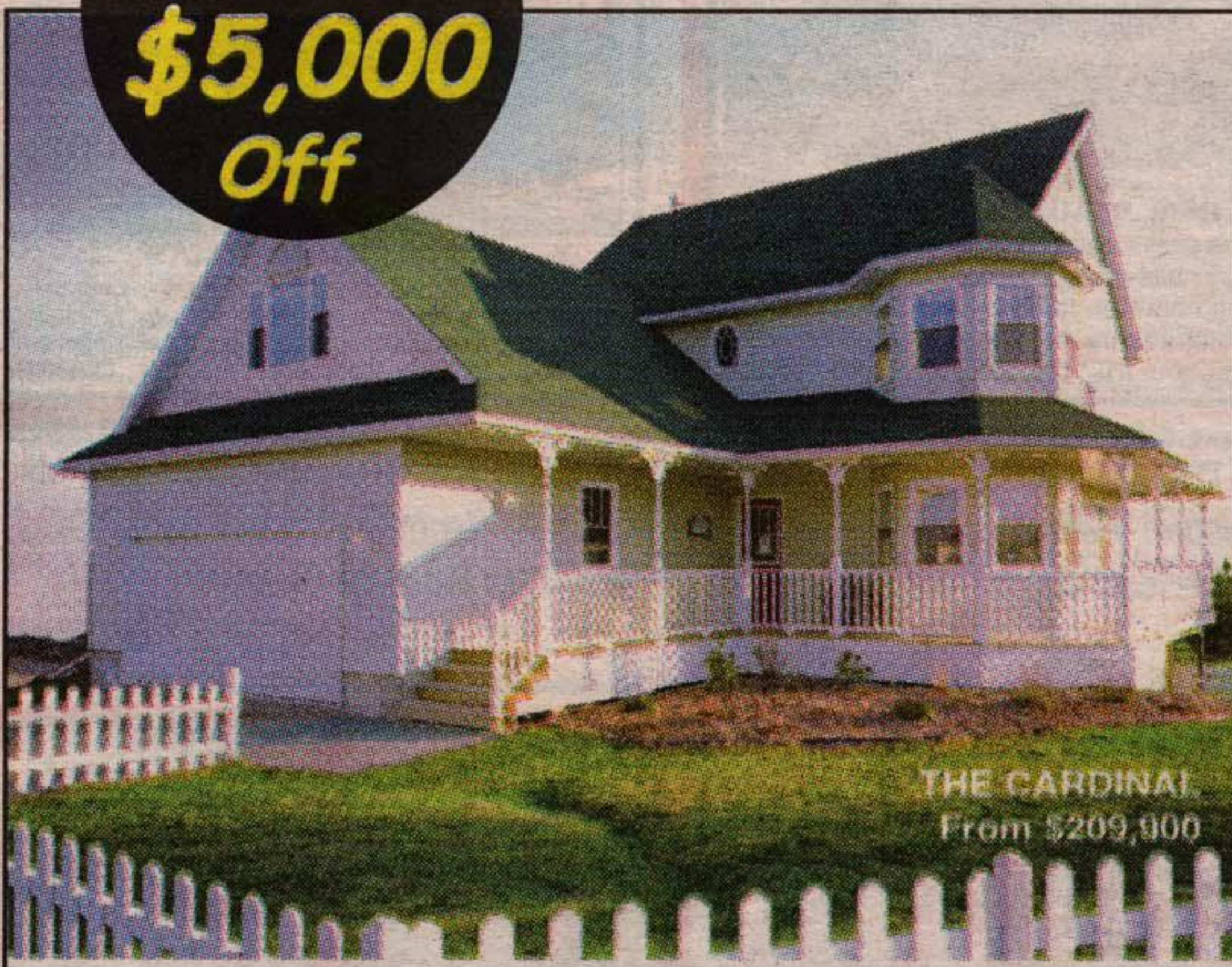
THE CARDINAL From $209,900