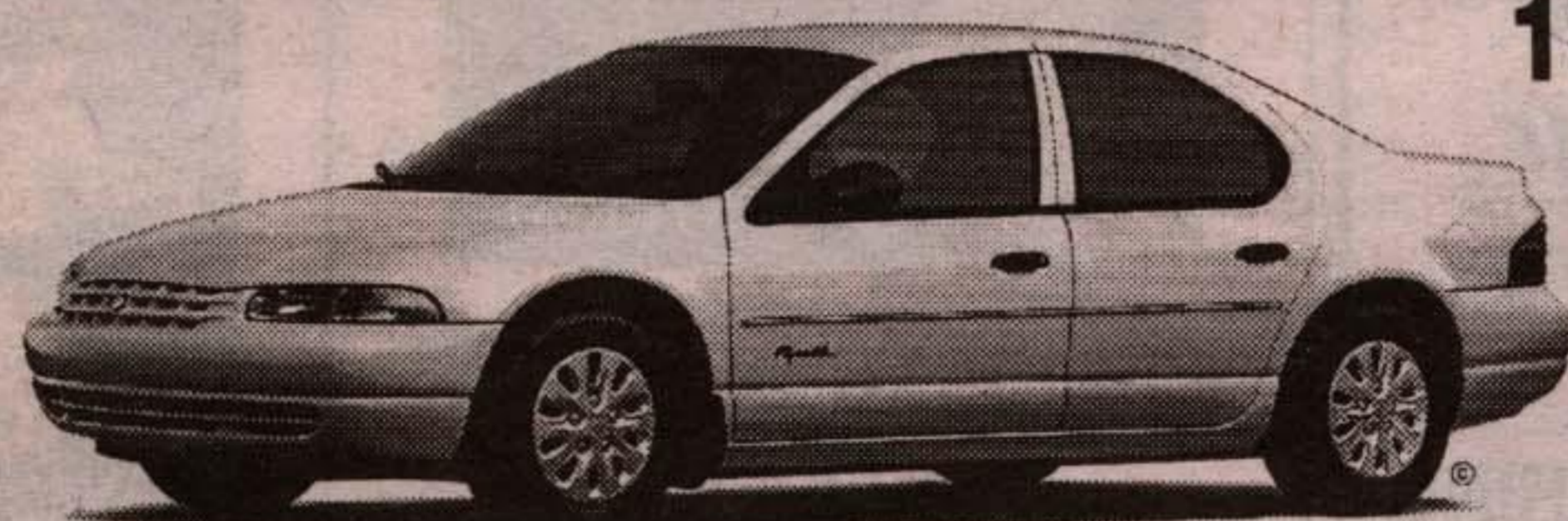
1999 Stratus /Breeze 24A Package

$199/MO † for 36 months. $650. freight. Plus $3,284 downpayment or equivalent trade. No security deposit