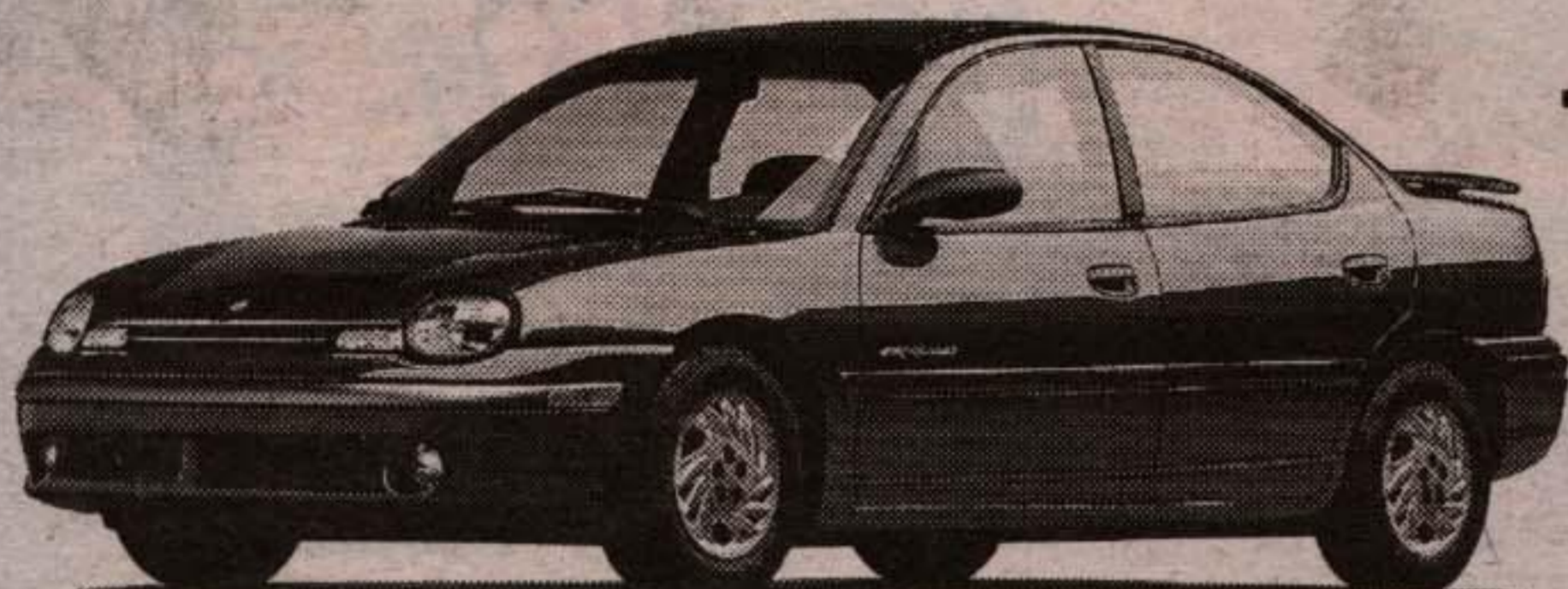
1999 Neon 22D Package

THERE'S NEVER BEEN A BETTER TIME TO PUT YOURSELF IN A CHRYSLER. SPECIAL LEASE RATES AND FACTORY PURCHASE FINANCING ON SELECTED MODELS AND MORE. PLUS A CHANCE TO WIN CANADA'S #1 MINIVAN*.