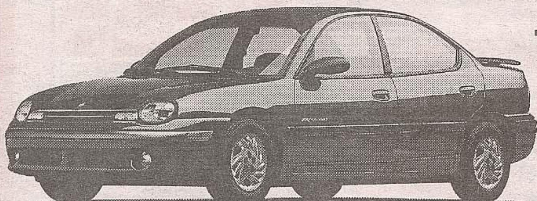
1999 Neon 22D Package

THERE'S NEVER BEEN A BETTER TIME TO PUT YOURSELF IN A CHRYSLER. SPECIAL LEASE RATES AND FACTORY PURCHASE FINANCING ON SELECTED MODELS AND MORE. PLUS A CHANCE TO WIN CANADA'S #1 MINIVAN*.