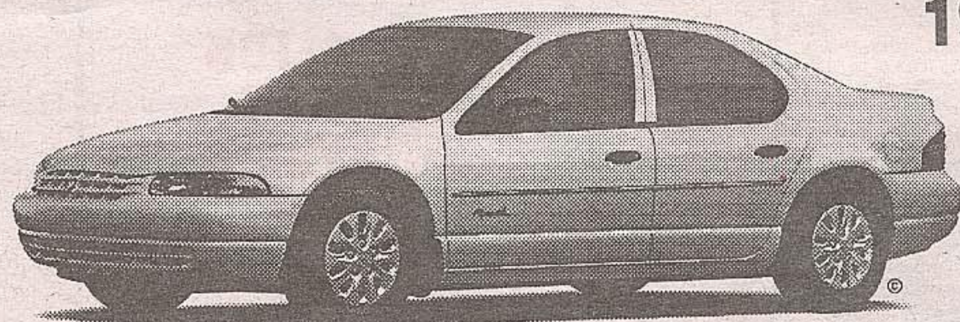
1999 Stratus /Breeze 24A Package

PURCHASE ANY NEW 1999 NEON AND GET A NO CHARGE 5 YEAR SERVICE CONTRACT**.