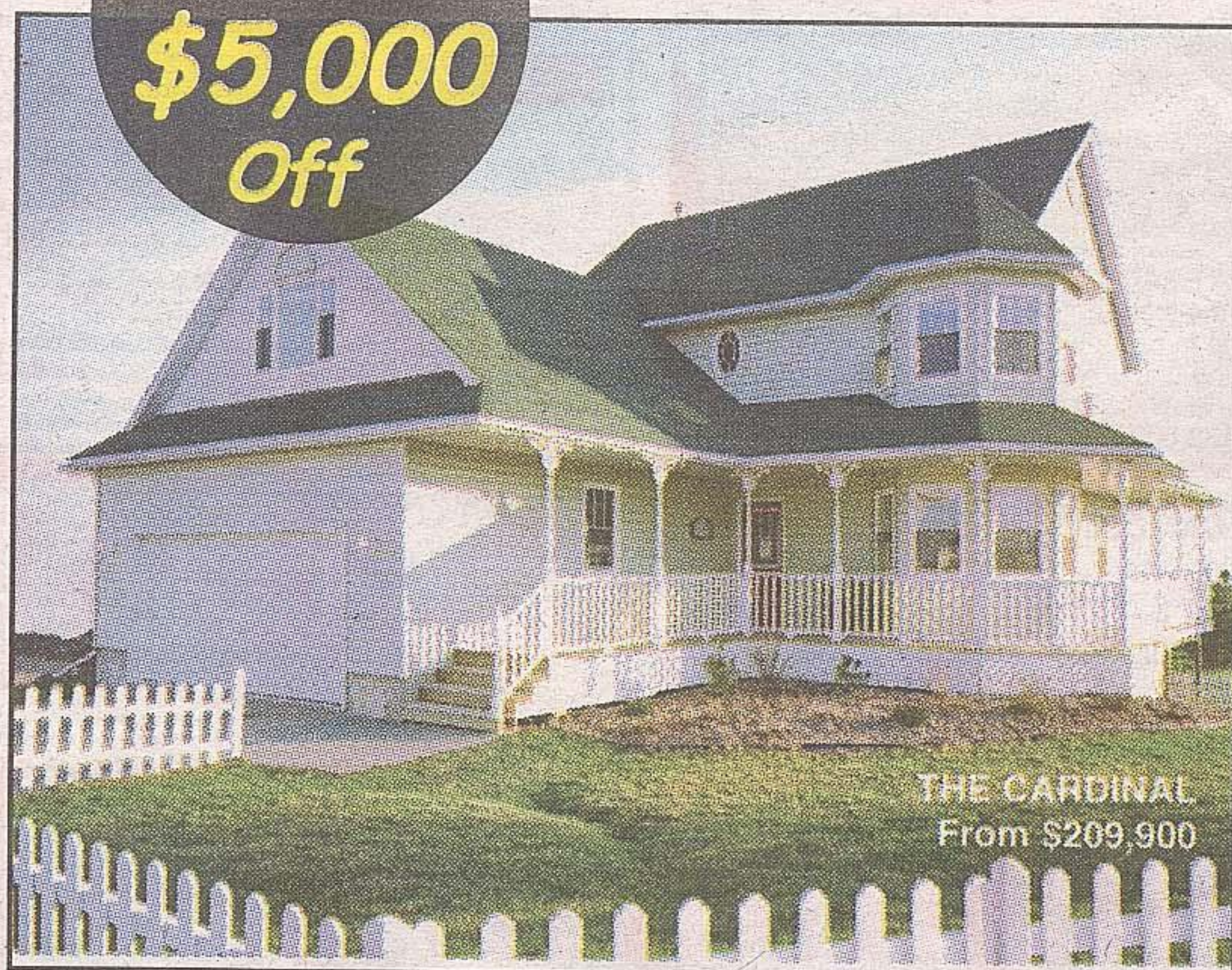
THE CARDINAL From $209,900