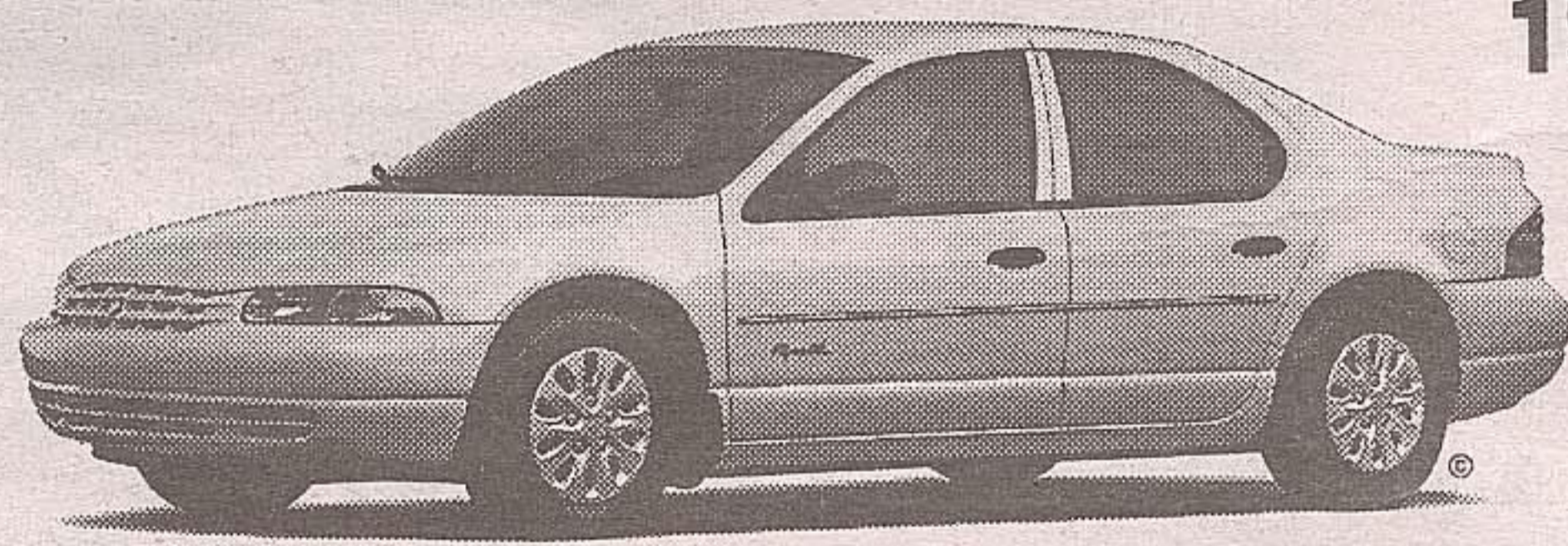
1999 Stratus /Breeze 24A Package

$199/MO † for 36 months. $650. freight. Plus $3,284 downpayment or equivalent trade. No security deposit