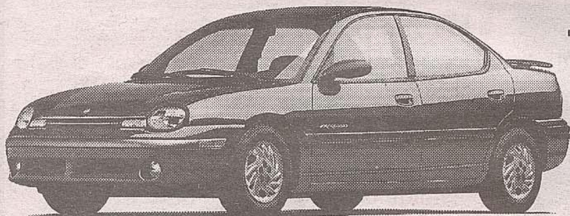
1999 Neon 22D Package

THERE'S NEVER BEEN A BETTER TIME TO PUT YOURSELF IN A CHRYSLER. SPECIAL LEASE RATES AND FACTORY PURCHASE FINANCING ON SELECTED MODELS AND MORE. PLUS A CHANCE TO WIN CANADA'S #1 MINIVAN*.