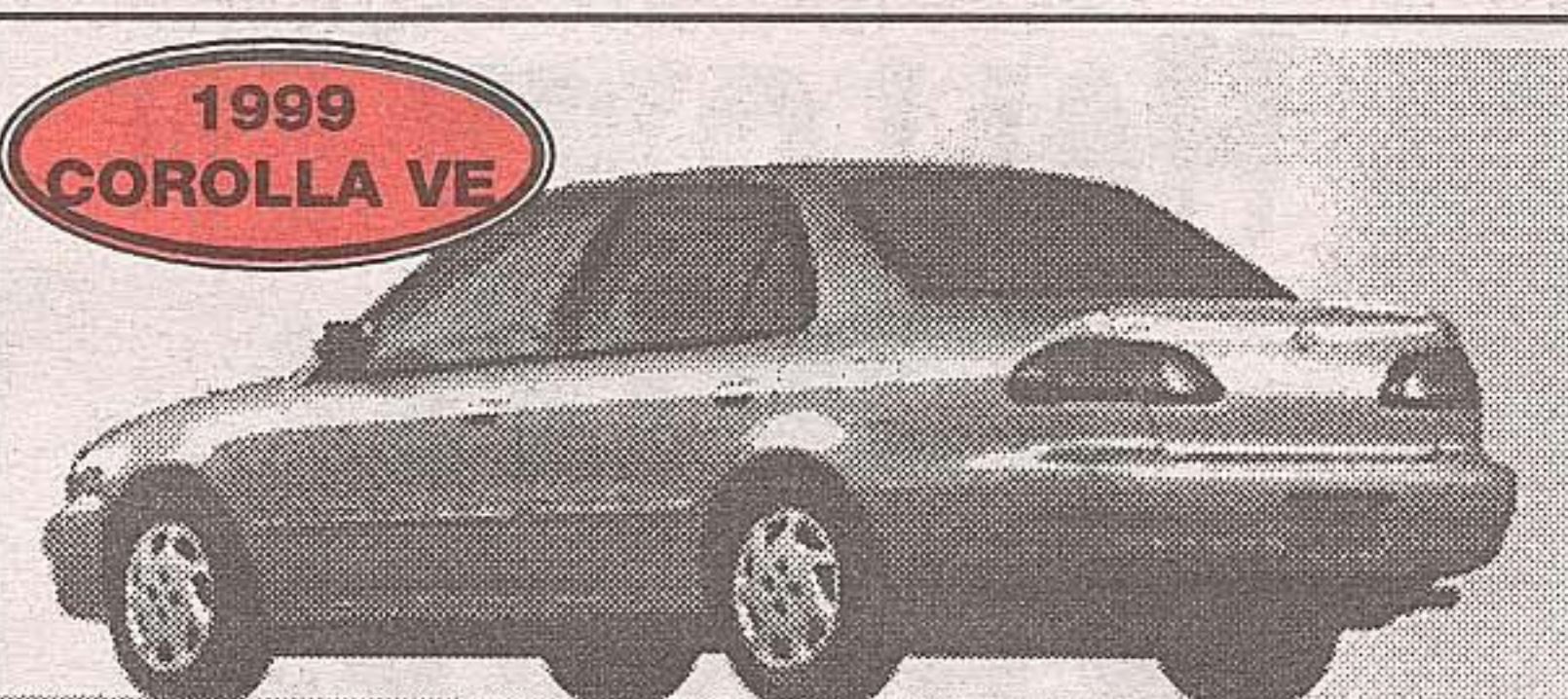
1999 COROLLA VE

#1 selling car in its class. January-August 1998 AIMC Segmentation Report