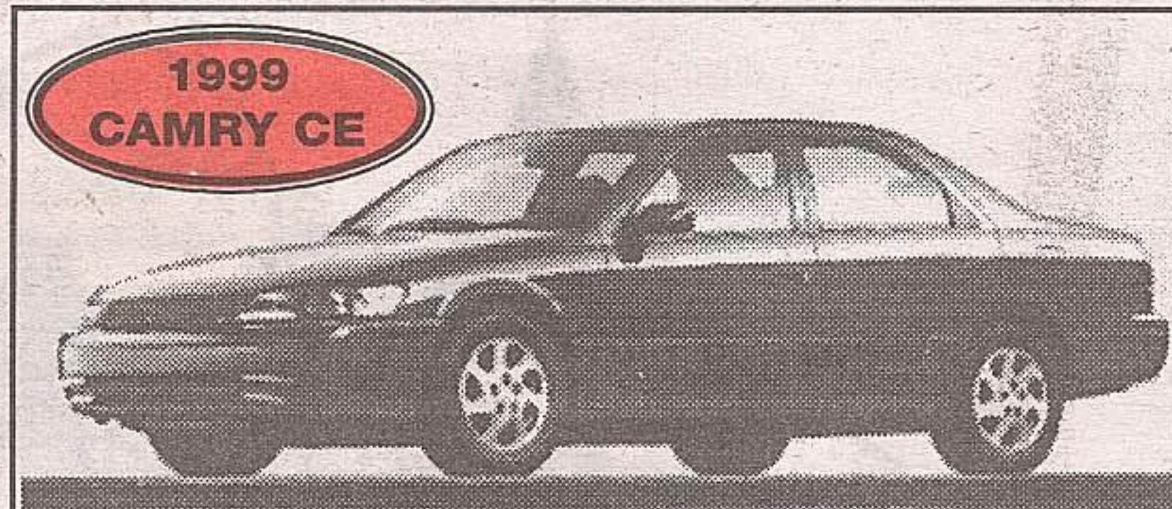
1999 CAMRY CE

"Every Canadian driveway ought to have one." The Toronto Sun Driver Source July/98