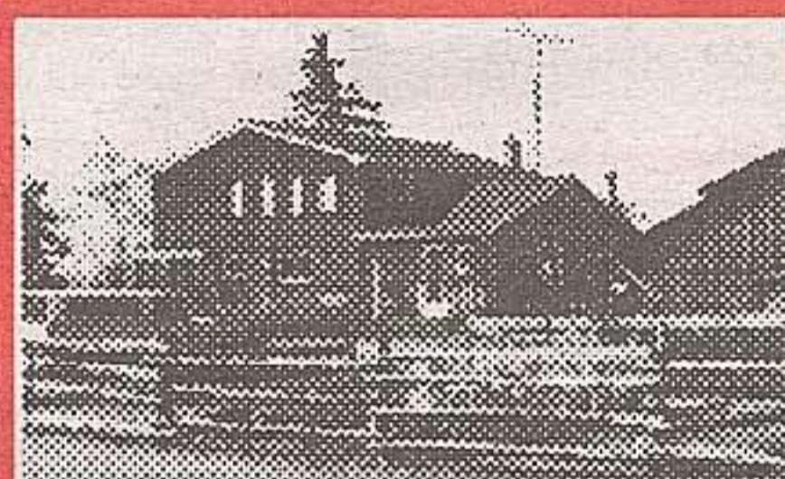
Erin Hobby Farm. ~ 16 acres

Running Brook Farm, approx. 66 scenic acres. Solid stone & rubble stone home renovated in the 60's. Spring fed pond feeds Blue Spings Creek. Bank barn (40' x 60') SE of Rockwood & ~ 12 min N of 401. Adjacent 2ac, $89,000.