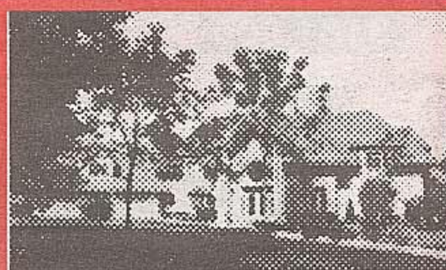
Campbellville Estate. ~ 5ac

Location, curb appeal & price! 4 bdrms, 5 WRs. Two bdrms have 3 pc ensuites. Walk to hospital, schools, churches, park, library, art gallery & GO. Large ~ square Fam rm with FP & w/o. Cement drwy. Expensive metal shingles