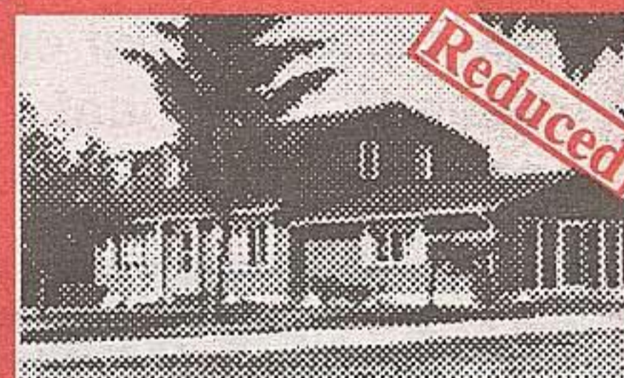
Halton Hills ~11ac.

$278,500 Gracious country home with 4 bdrm, 2WRs. Backs onto Nature Rail Trail. 2 ponds. Barn with hydro & water. Dog run. Close to schools & shopping. Excellent well. 20 min. to G'town GO