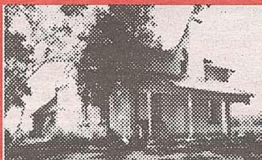
Milton 1819 Farm. $389,000

Stone on ~5 ac on quiet rd with access to 401. Great Rm w 4 sided stone FP. 2 cir staircases to 2nd floor balcony. Fab kit. 2nd kit in Fam Rm. MF 5th bdrm suitable for office. Pool. Marley roof. Ground source heat pump. Near M GO.