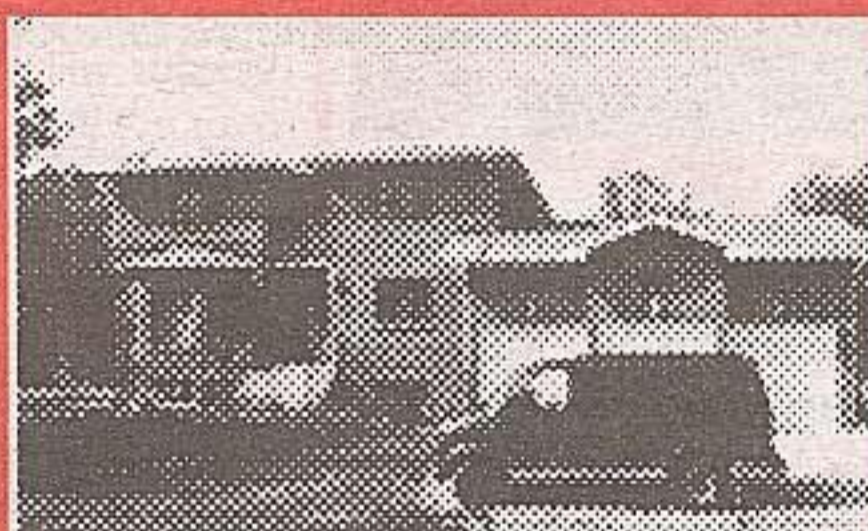
Halton Hills $385,000 ~3000SF

Minutes to Hwy 401. 1406 ft frontage. 4 large bdrms. Fam Rm with wood stove. Ceramic & parquet floors. 2 wells. Steel shed: 36' x 24' + 200 amp. 3 plum, 3 apple trees. Parking for many vehicles.