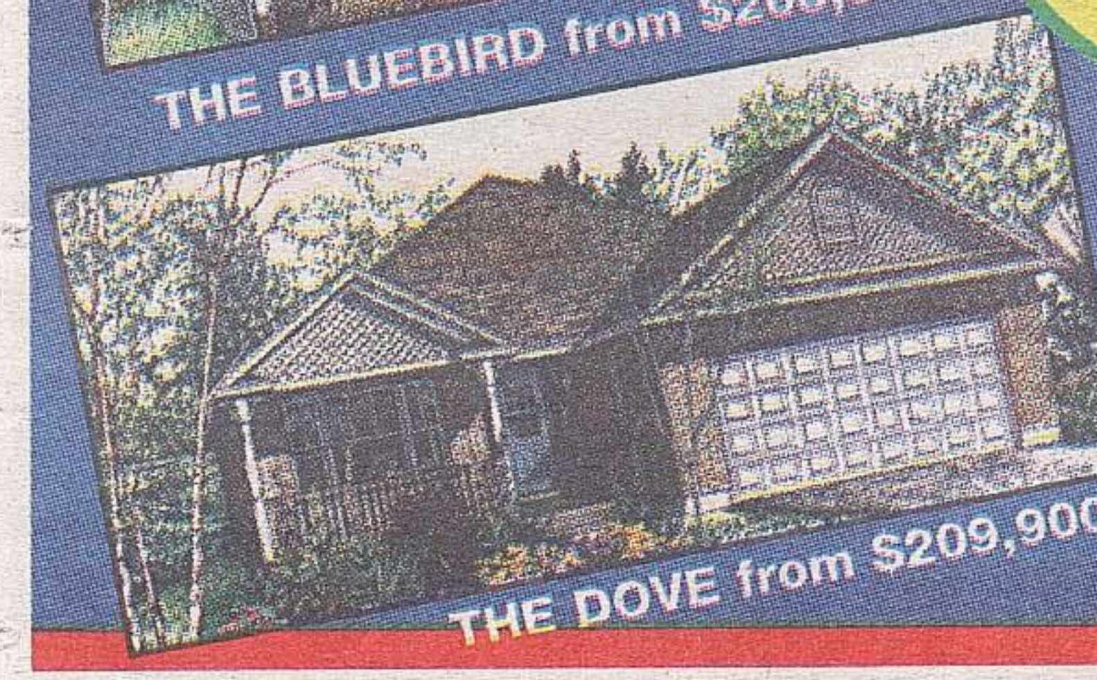
THE DOVE from $209,900

Our standard features are other builders' upgrades WILL CUSTOMIZE TO SUIT YOUR LIFESTYLE