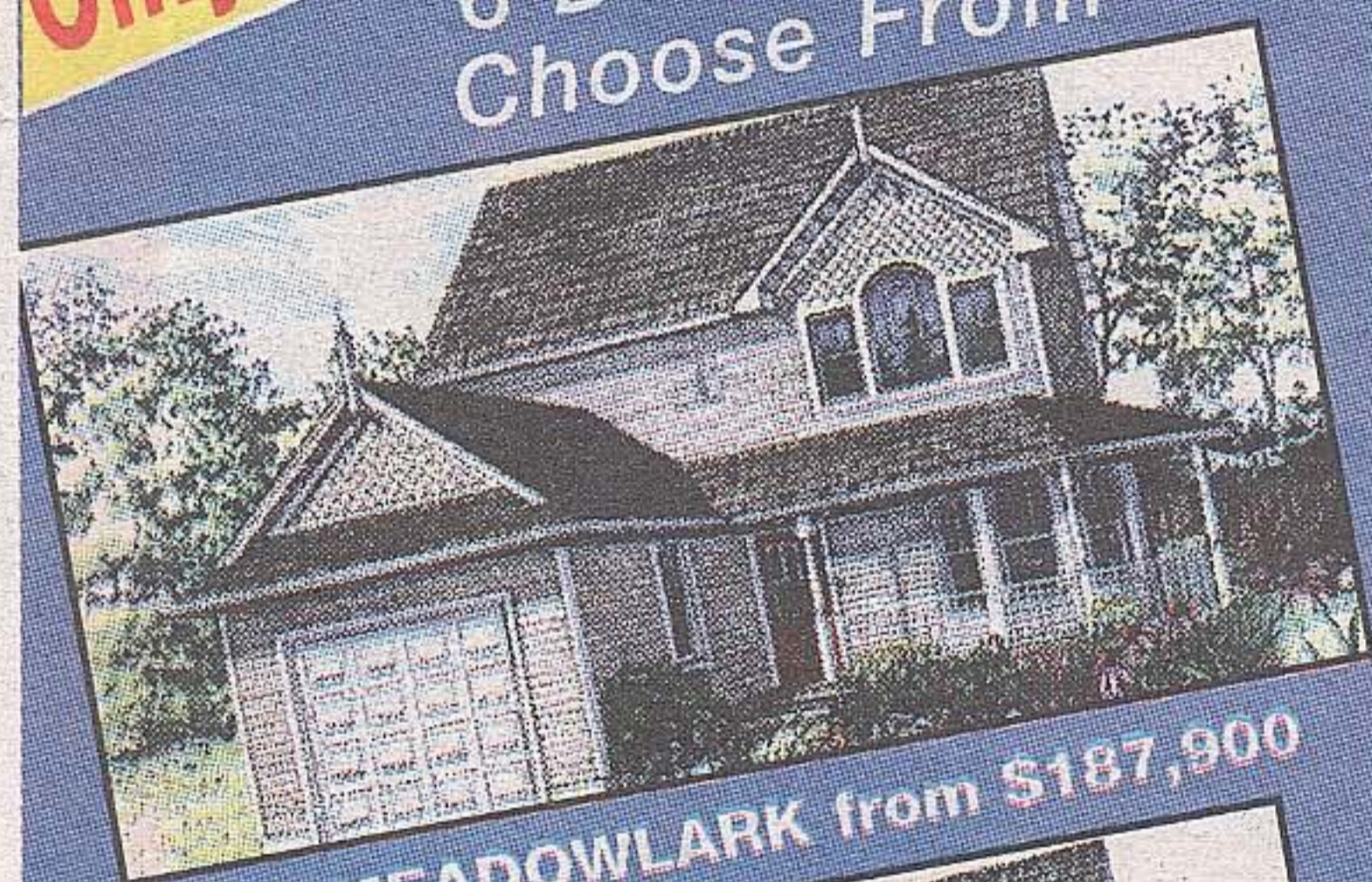
THE MEADOWLARK from $187,900