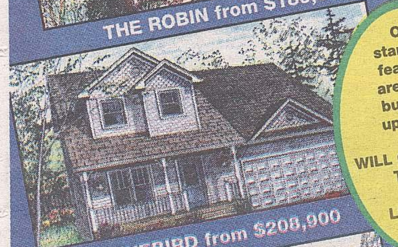
THE BLUEBIRD from $208,900