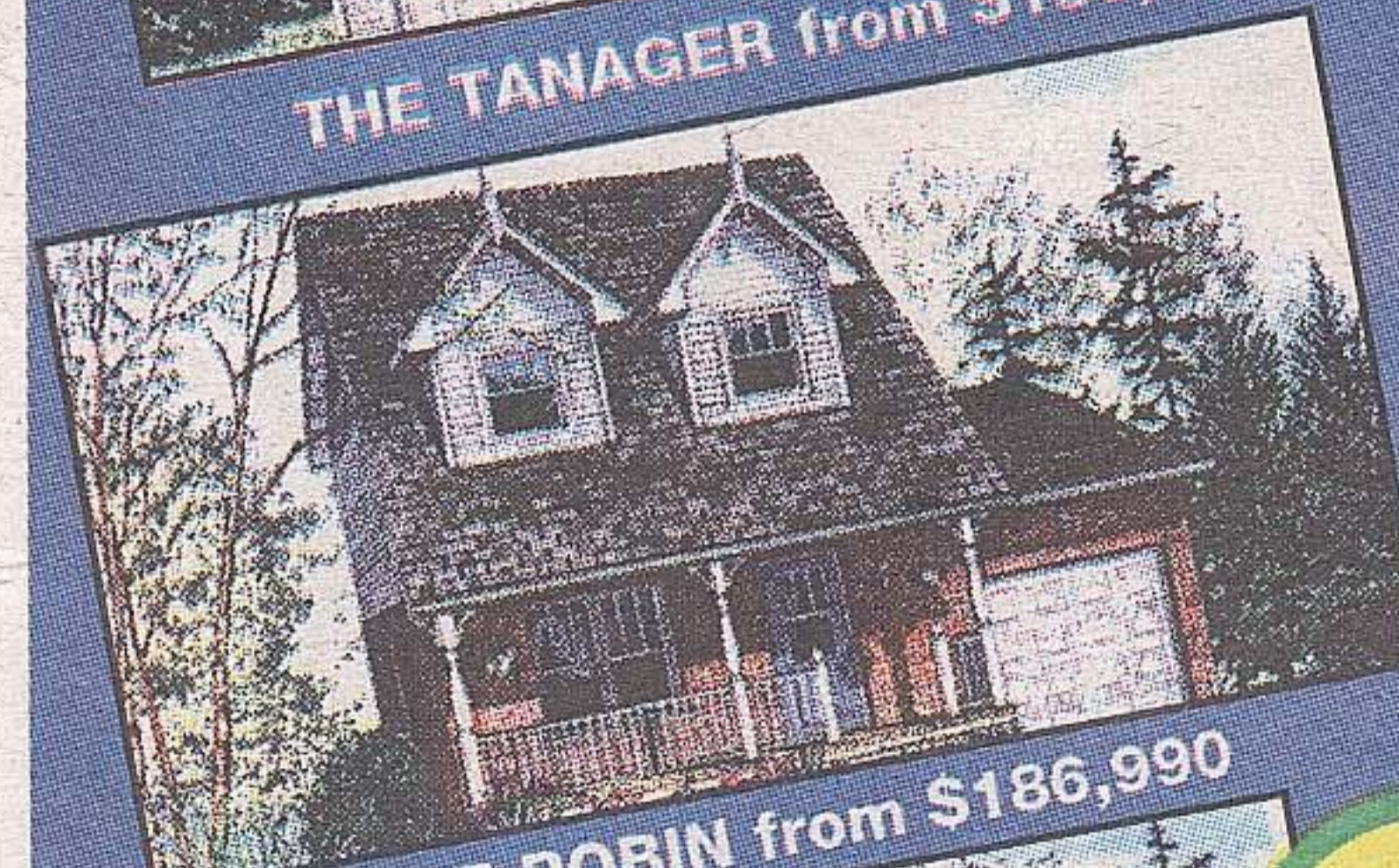
THE ROBIN from $186,990