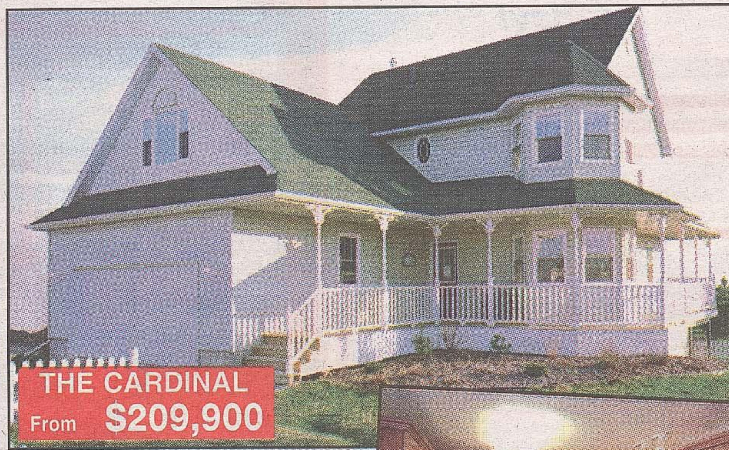
THE CARDINAL From $209,900