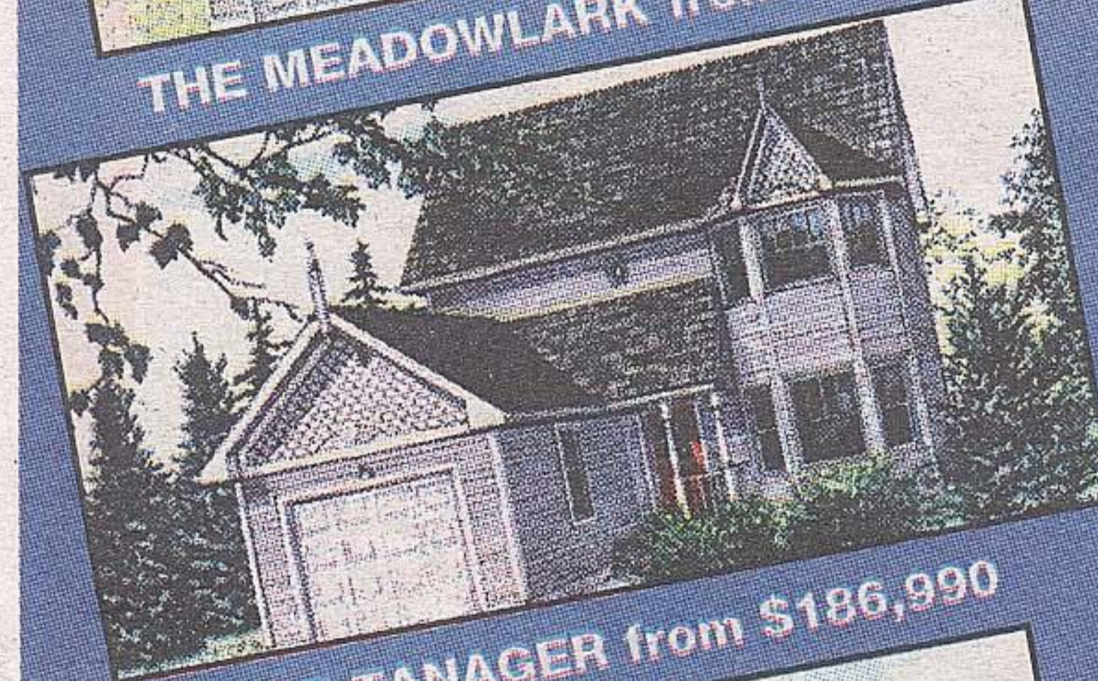
THE TANGER from $186,990