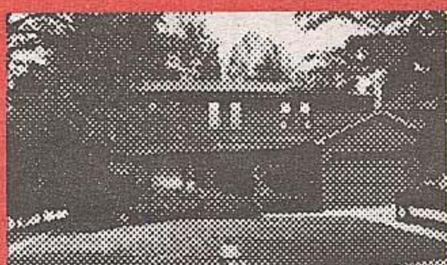
Georgetown Park Area. $319,000

RE/MAX Blue Springs Realty (Halton) Corp.