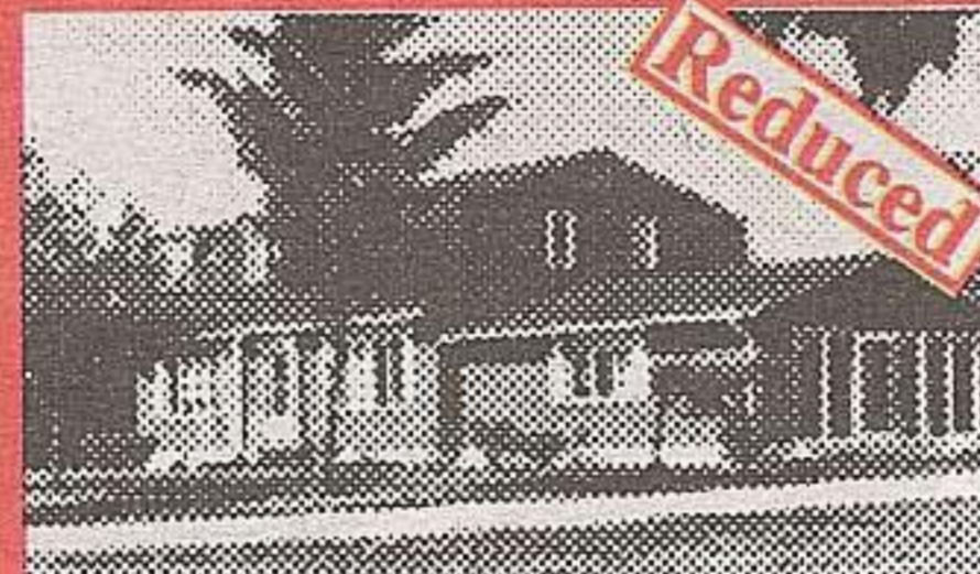
Halton Hills ~11ac. Reduced

Gracious country home with 4 bdrm, 2WRs. Backs onto Nature Rail Trail. 2 ponds. Barn with hydro & water. Dog run. Close to schools & shopping. Excellent well. 20 min. to G'town GO