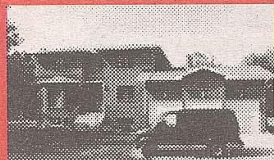
Halton Hills $385,000 ~ 3000SF

Minutes to Hwy 401. 1406 ft frontage. 4 large bdrms. Fam Rm with wood stove. Ceramic & parquet floors. 2 wells. Steel shed: 36' x 24' + 200 amp. 3 plum, 3 apple trees. Parking for many vehicles.