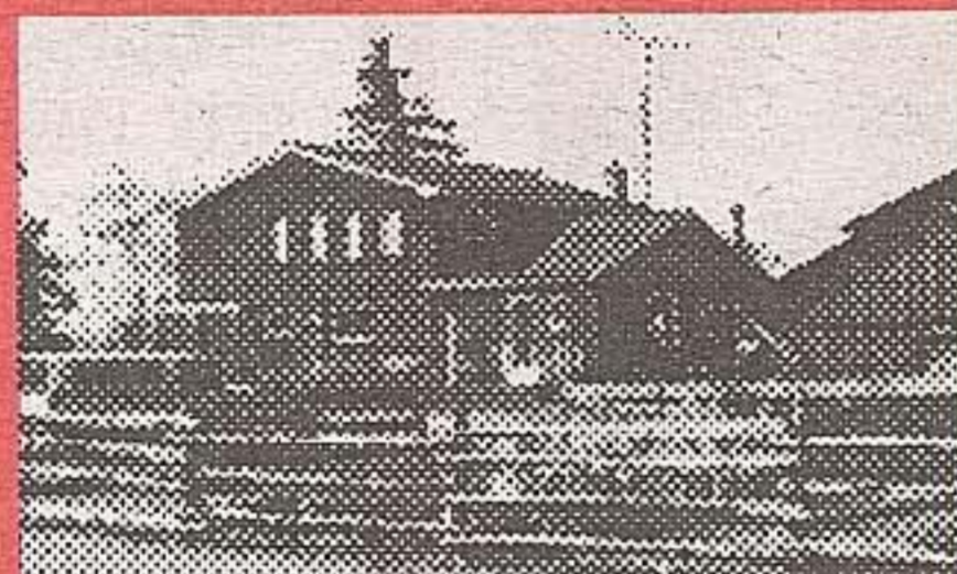
Erin Hobby Farm. ~ 16 acres $278,500

Running Brook Farm, approx. 66 scenic acres. Solid stone & rubble stone home renovated in the 60's. Spring fed pond feeds Blue Spings Creek. Bank barn (40' x 60') SE of Rockwood & ~ 12 min N of 401. Adjacent 2ac, $89,000.