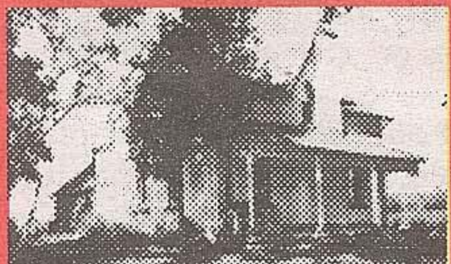
Milton 1819 Farm. $389,000

Stone on ~5 ac on quiet rd with access to 401. Great Rm w 4 sided stone FP. 2 cir staircases to 2nd floor balcony. Fab kit. 2nd kit in Fam Rm. MF 5th bdrm suitable for office. Pool. Marley roof. Ground source heat pump. Near M.G.O.