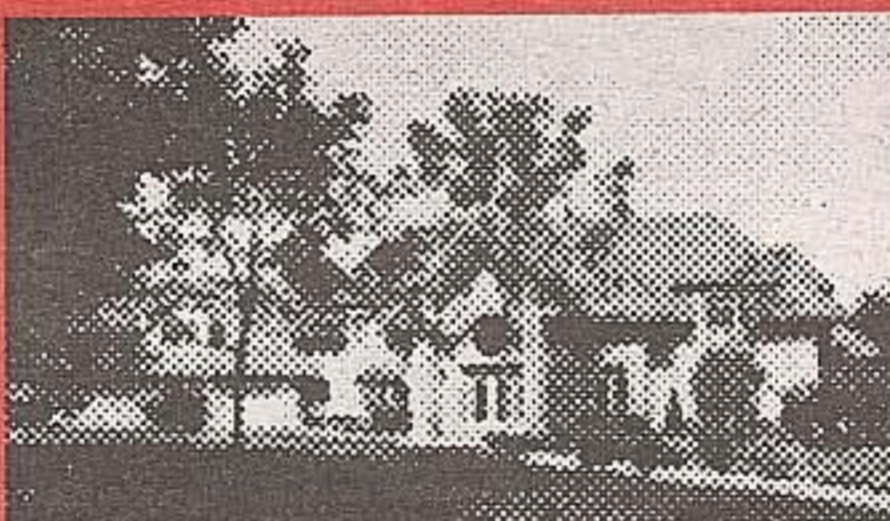
Campbellville Estate. ~ 5ac

Location, curb appeal & price! 4 bdrms, 5 WRs. Two bdrms have 3 pc ensuites. Walk to hospital, schools, churches, park, library, art gallery & GO. Large ~ square Fam rm with FP & w/o. Cement drwy. Expensive metal shingles