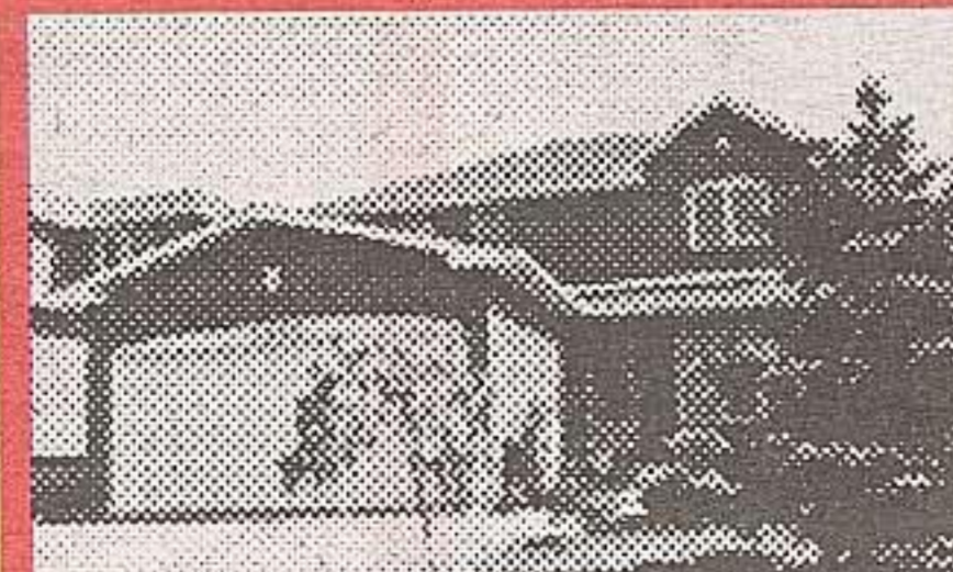
Mississauga Excellent loc.

on treed 1.4 acre w quick access to Hwy #25 & 401. 7 min to Milton GO. 4 bdrm. 5, 5, 2pc. Hardwood & ceramic. 2 oak staircases. MBR w 5 pc with whirlpool tub & sep shower. MF den & Fam rm + FP. Fin bsmnt w games rm & sitting rm w wdstve. Deck. Excel well. Lit drwy. Privacy gates. Far below replcmnt cost