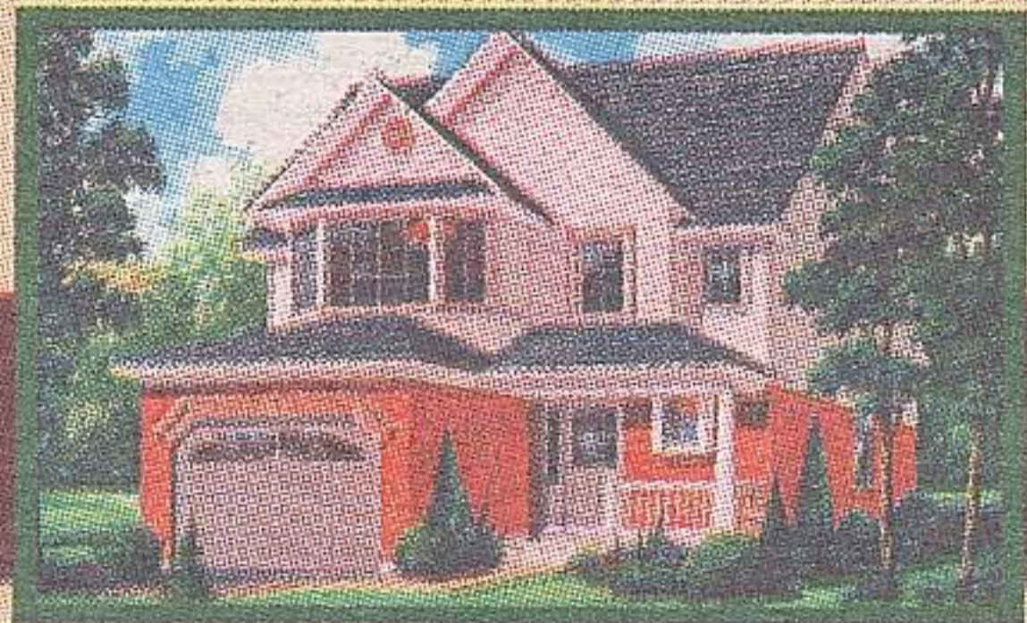
The Stonebrook 1607 sq.ft. $169,400