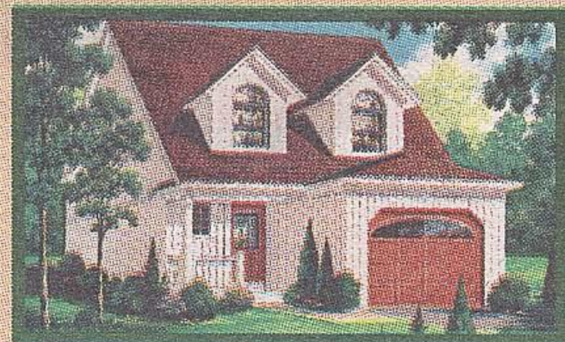
The Morningside 1163 sq.ft. $150,900