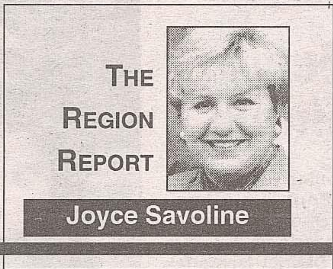
THE REGION REPORT

Why couldn't the region absorb these new provincial costs? Quite simply, because the numbers were so large and the impacts so great, it just was not possible. Even though the province's reforms were revenue neutral on a province-wide basis, in Halton the changes