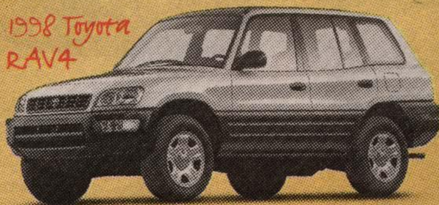
1998 Toyota RAV4

Don't miss these sharpest deals at my Toyota Dealer.