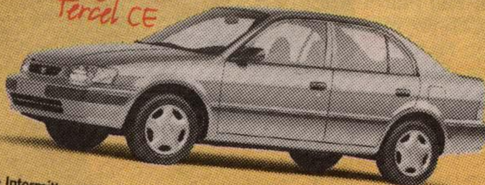
1998 Toyota Tercel CE