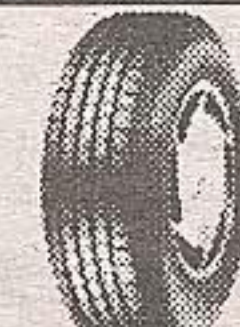
MICHELIN LTX M/S All season for highway applications

STARTING AT $69 99 CALL FOR ADDITIONAL PRICING