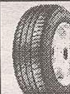
MICHELIN RainForce MX4 All season rain tire

STARTING AT $99 99 CALL FOR ADDITIONAL PRICING