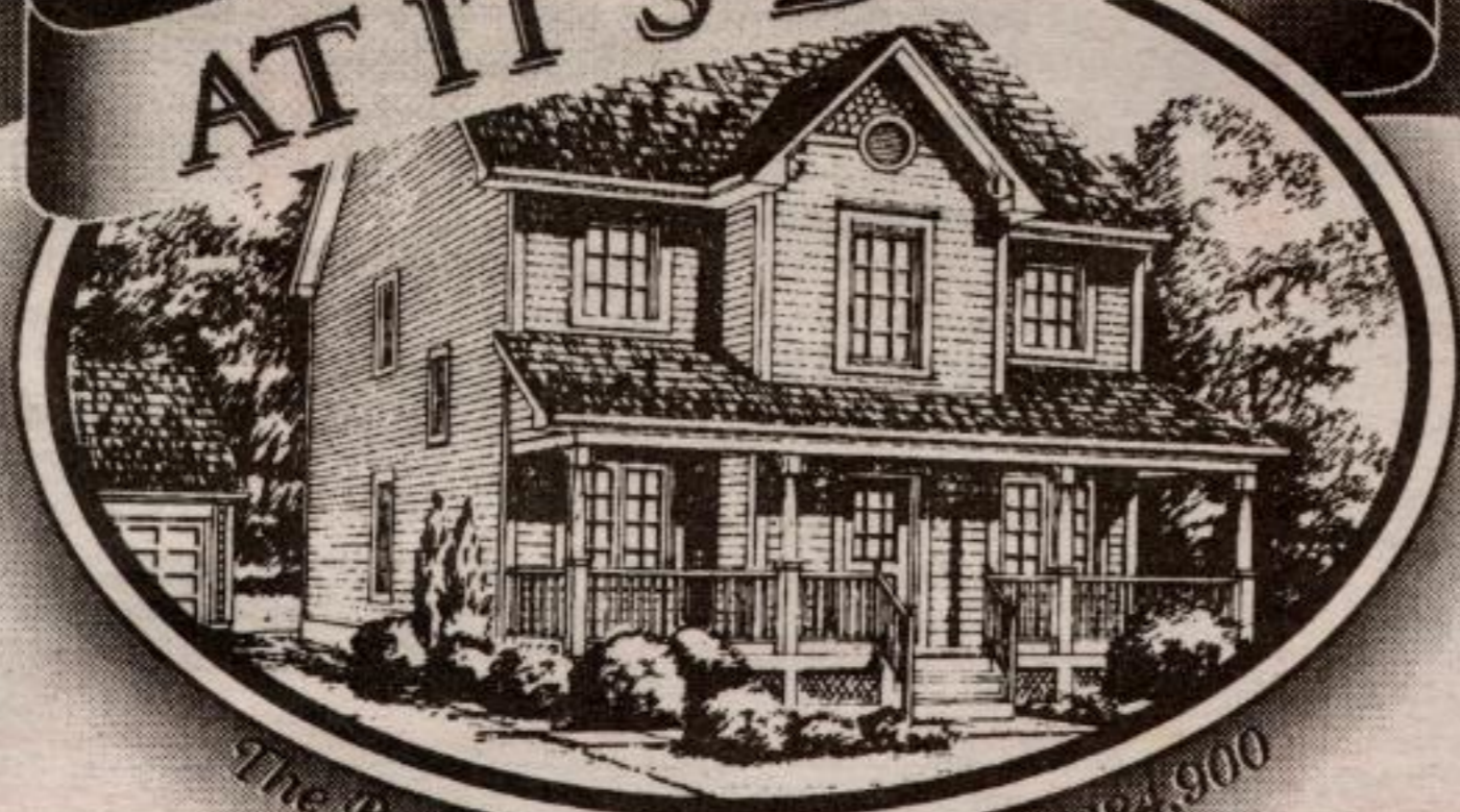
The Gateman 1304 sq. ft. from $184,900

New Release of Detached Homes on a Private Cul-De-Sac Backing onto Parklands & Forests