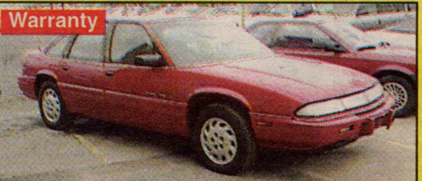
Warranty 1993 GRAND PRIX Fully Loaded $7,500