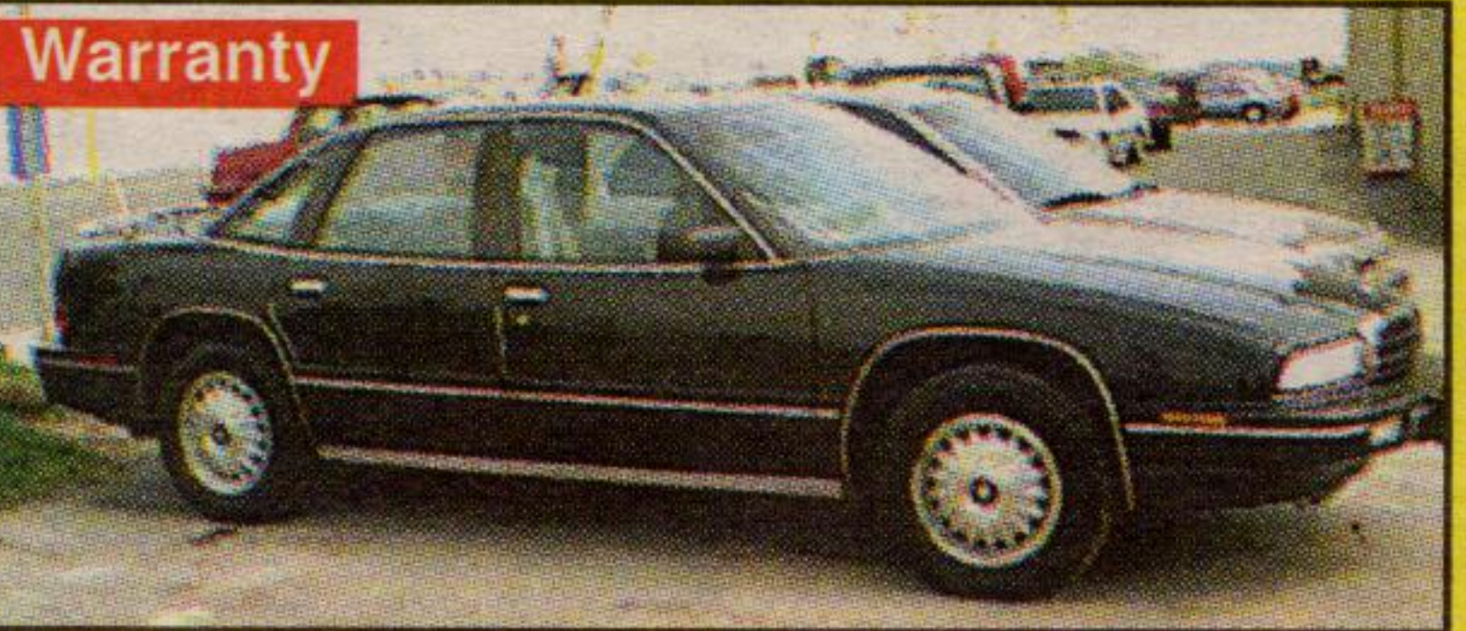
Warranty 1993 BUICK Auto, Loaded, V6 $8,700