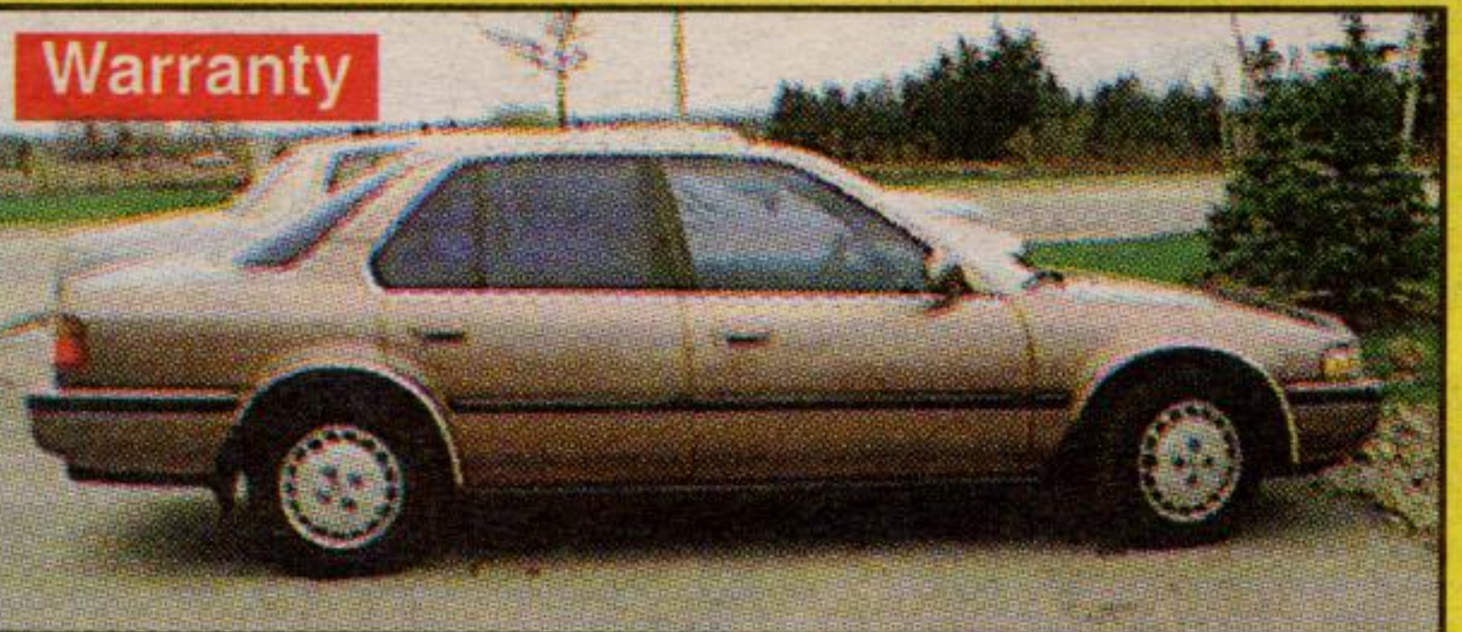
Warranty 1990 HONDA ACCORD 5 speed, Loaded $6,600