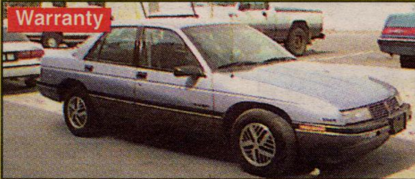
Warranty 1989 TEMPEST V6 Auto, Air, Stereo $5,400