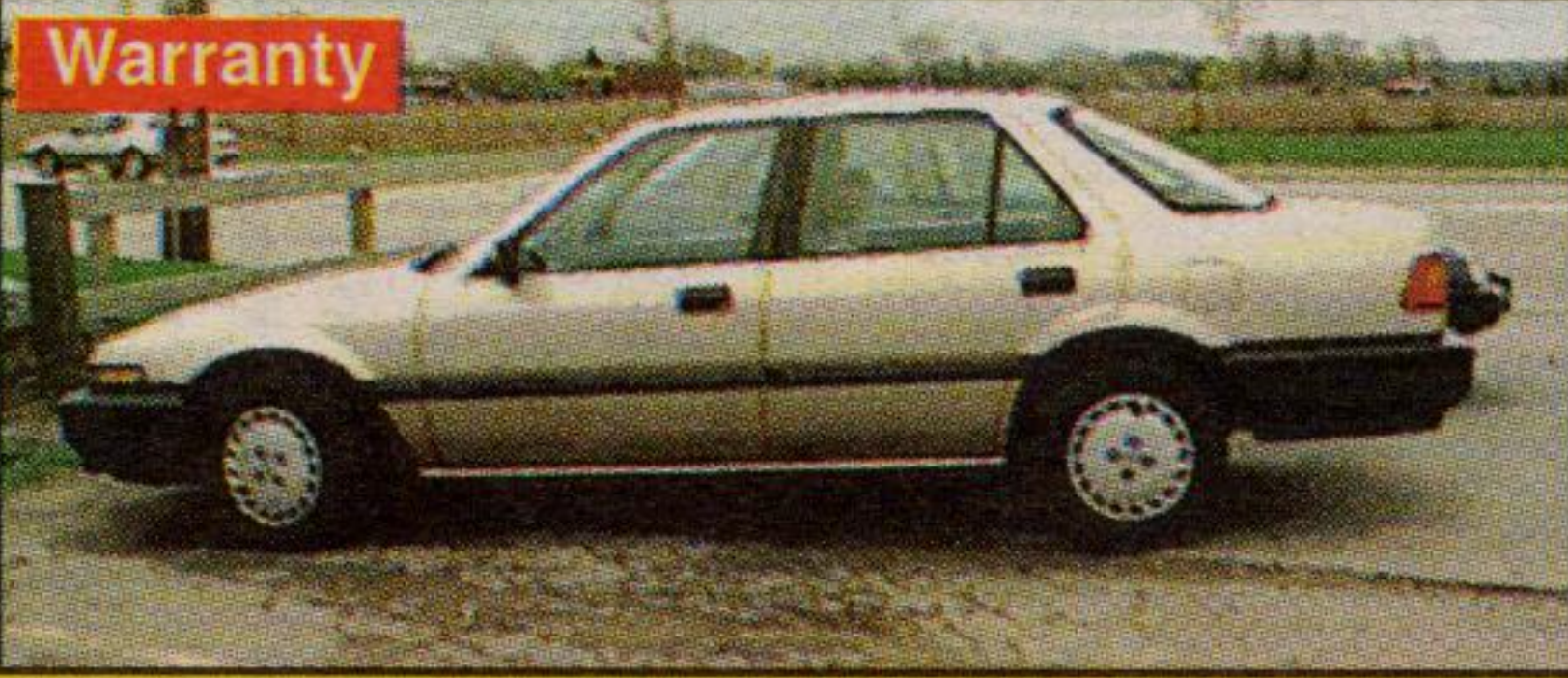
Warranty 1989 HONDA ACCORD 5 Speed, Excellent Condition $4,600