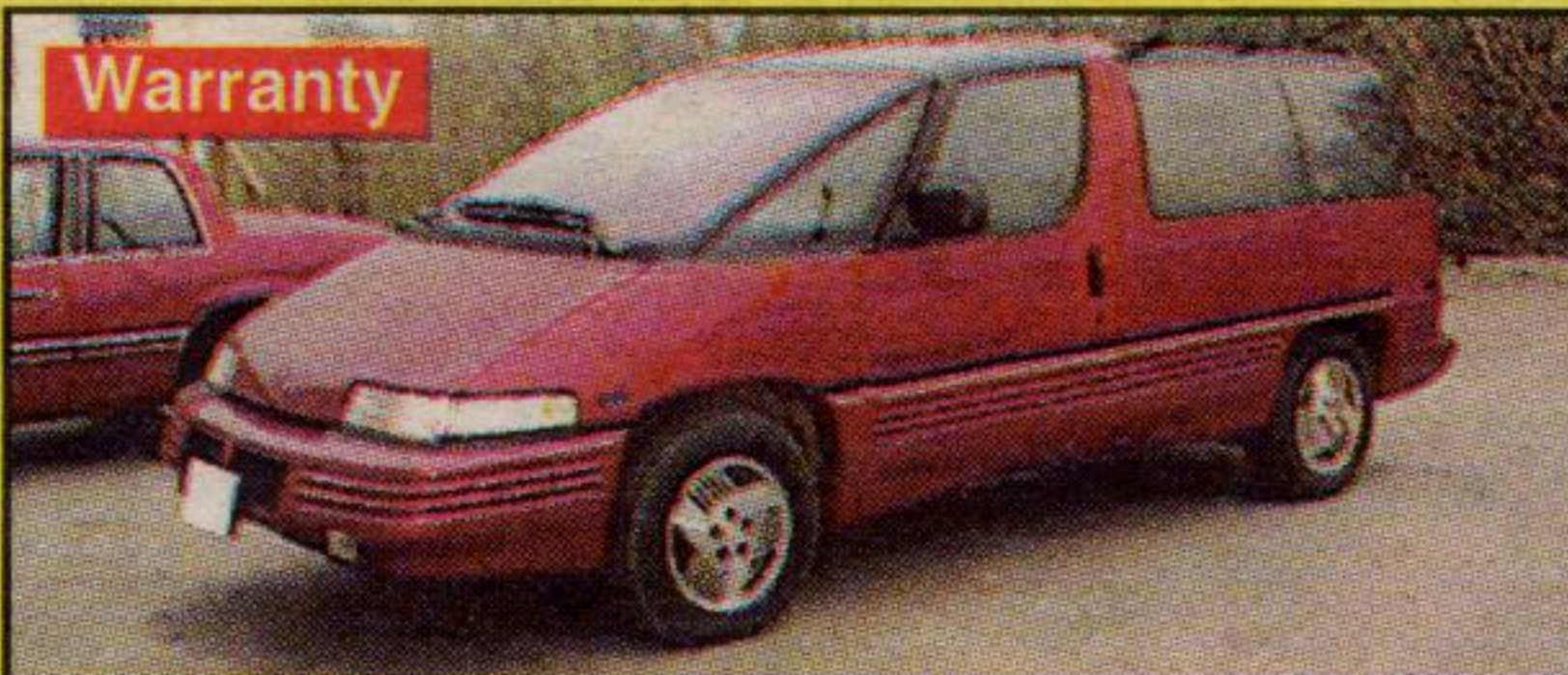
Warranty 1993 TRANSPORT Fully Loaded $9,800