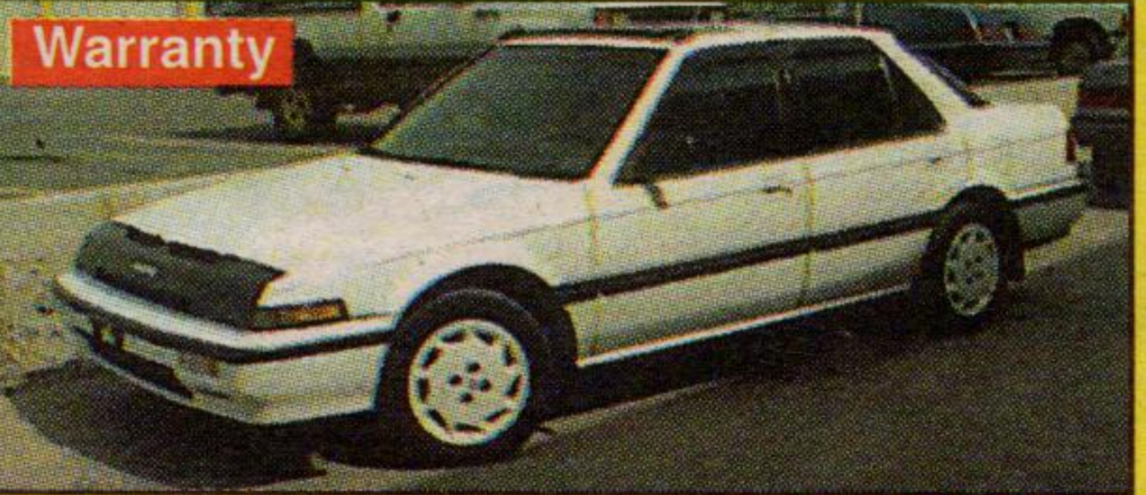
Warranty 1989 HONDA ACCORD EXI Auto, Loaded $5,500