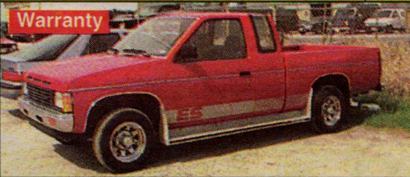
Warranty 1988 NISSAN 5 Speed $4,500