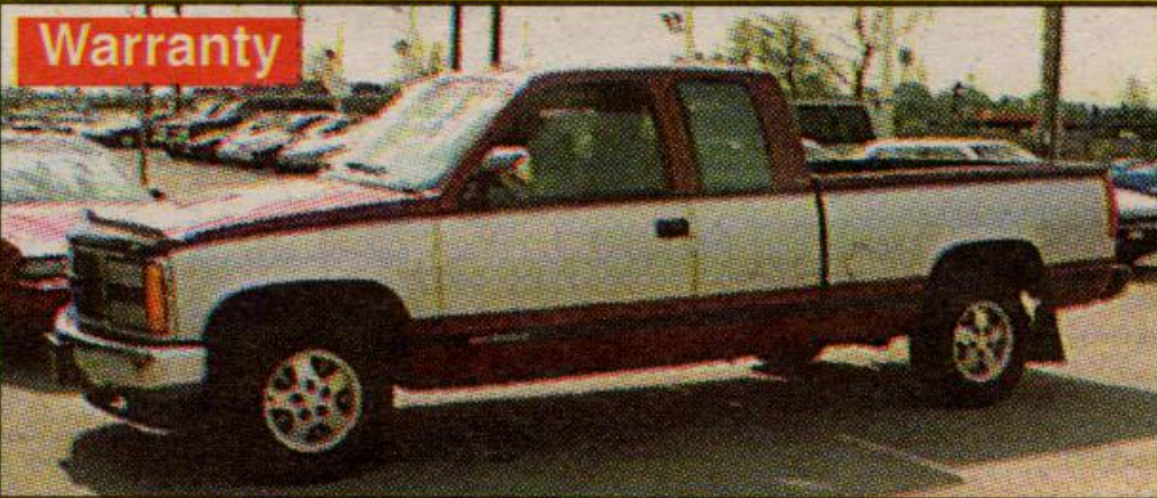
Warranty 1993 GMC SL Loaded, Auto, 350 Engine, Perfect Shape $13,900