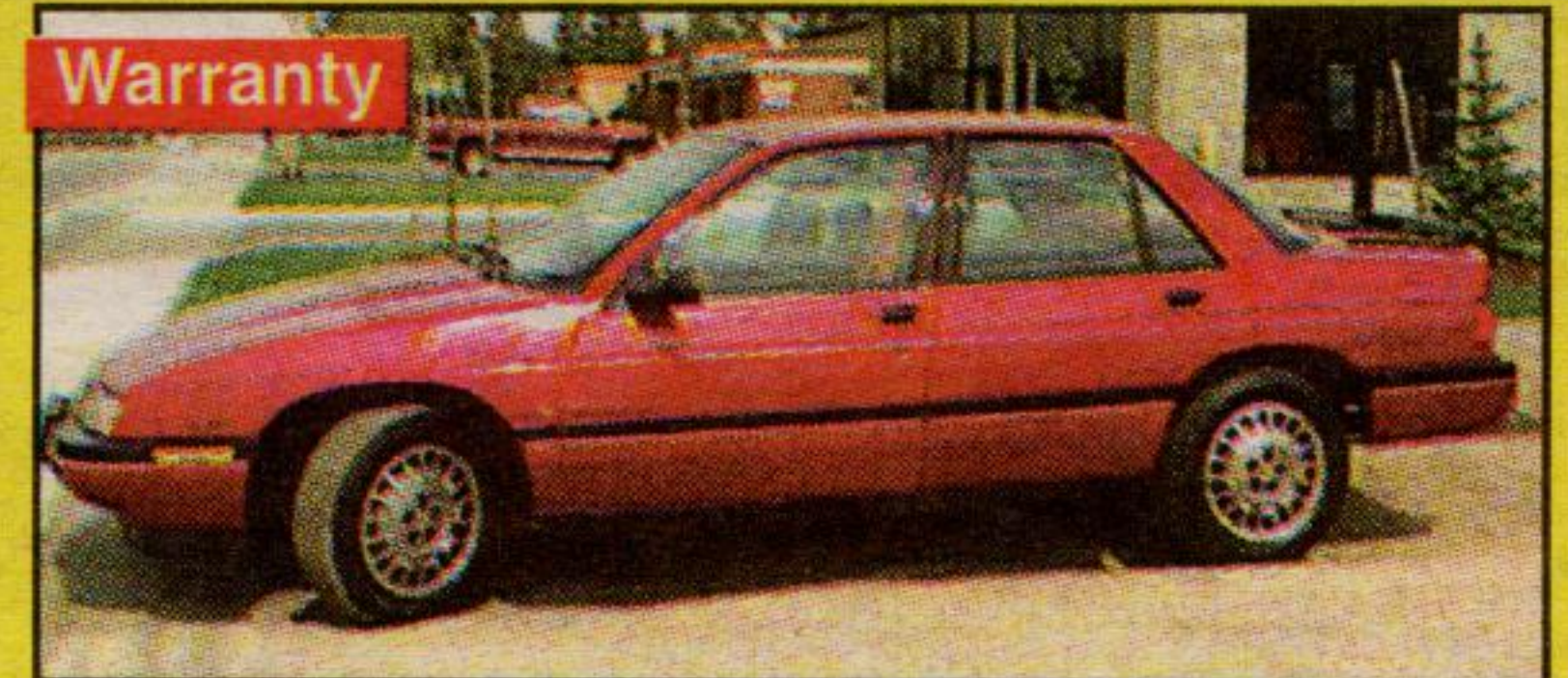
Warranty 1989 CORSICA GTZ Auto, V6, Loaded, 95,000 kms. $5,400