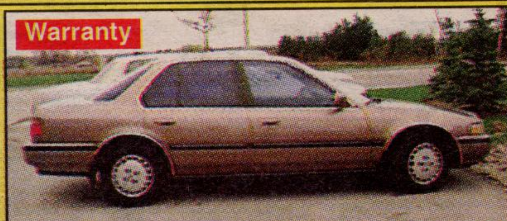
Warranty 1990 HONDA ACCORD 5 speed, Loaded $6,600