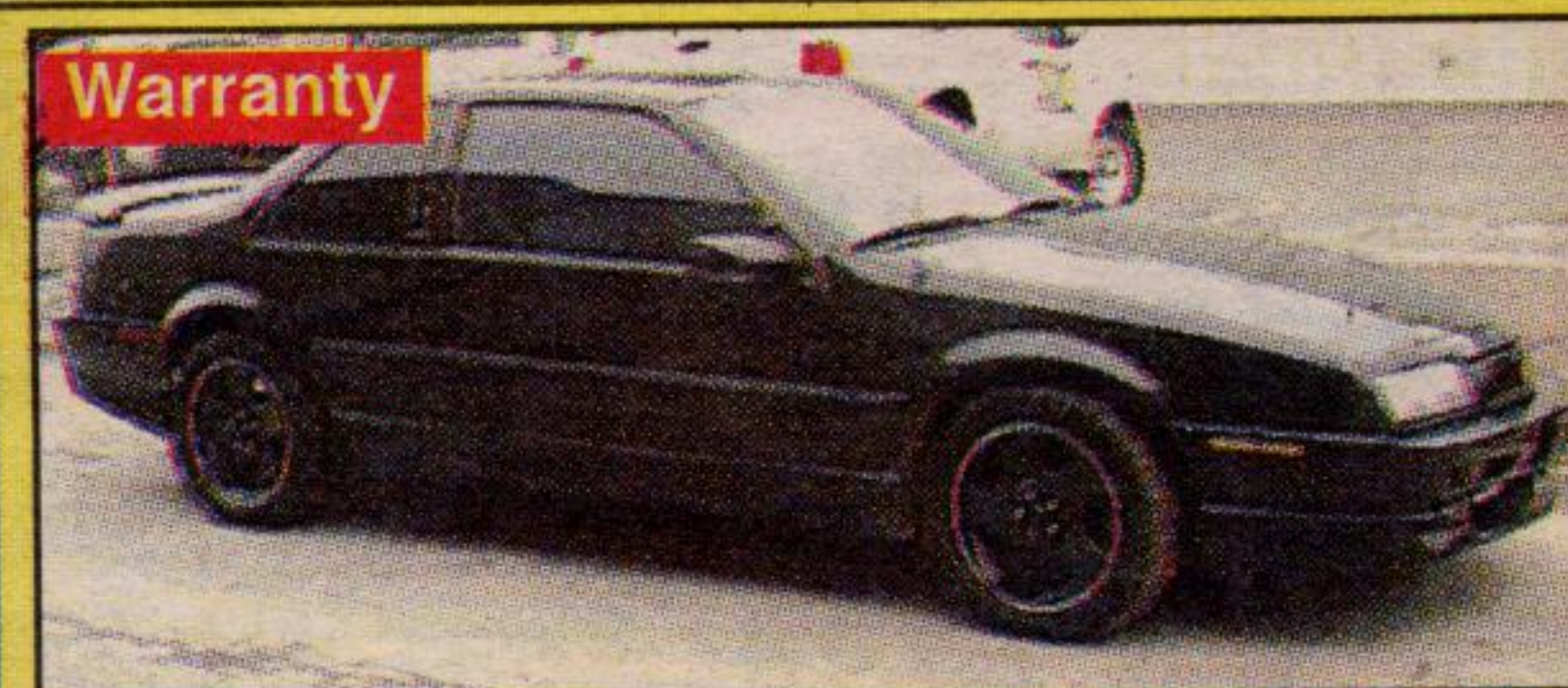
Warranty BARETTA GTZ V6, Auto, Loaded $7,500