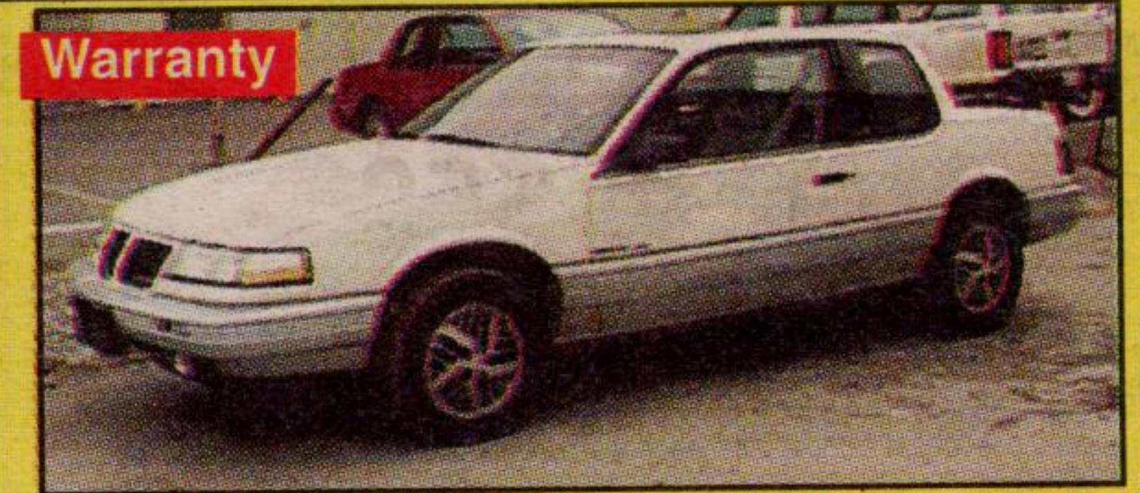
Warranty 1989 GRAND AM Auto, Loaded $4,600