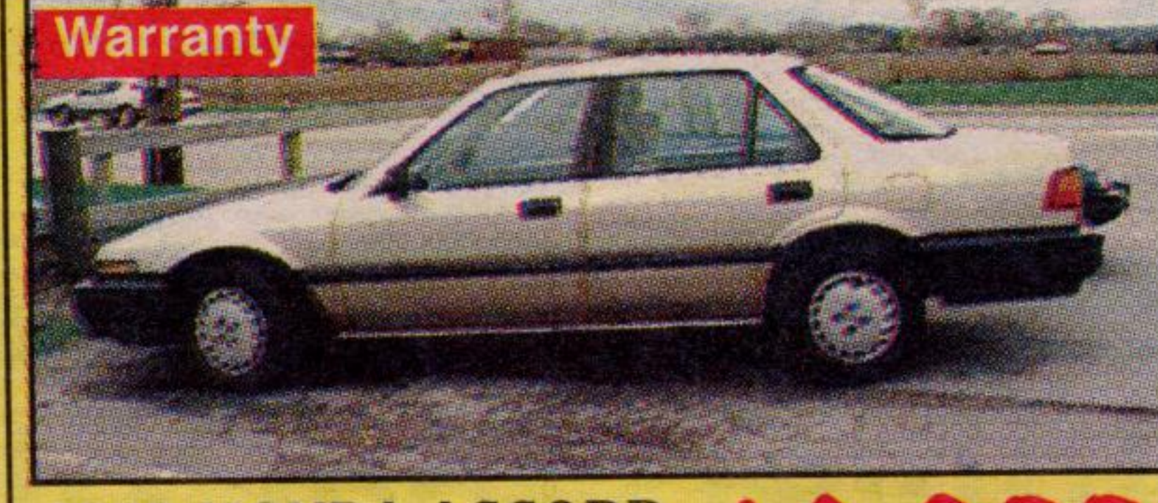
Warranty 1989 HONDA ACCORD 5 Speed, Excellent Condition $4,600