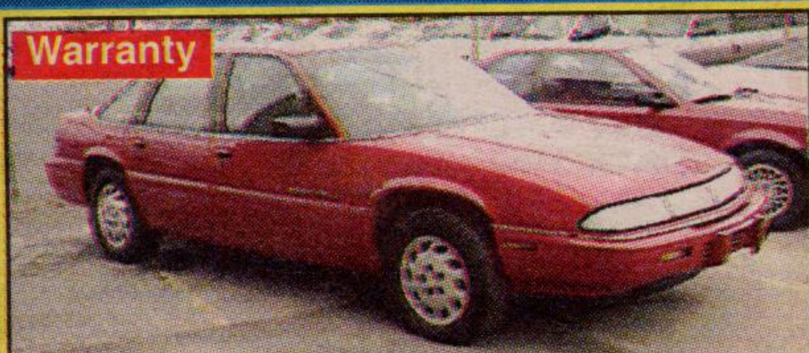
Warranty 1993 GRAND PRIX Fully Loaded $7,500