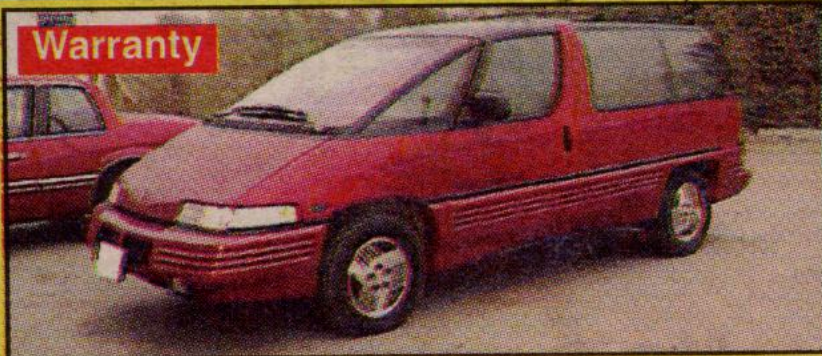
Warranty 1993 TRANSPORT Fully Loaded $9,800