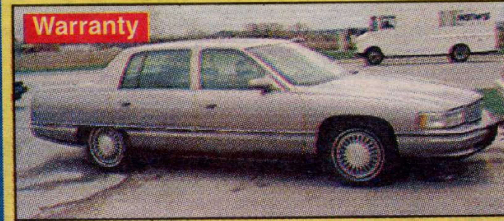
Warranty 1995 CADILLAC DEVILLE Fully Loaded $20,000