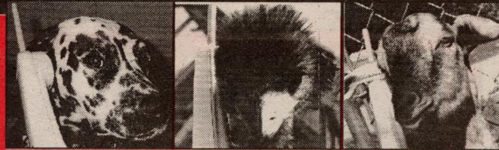
(NO ANIMALS WERE INJURED DURING THIS PHOTO SESSION)