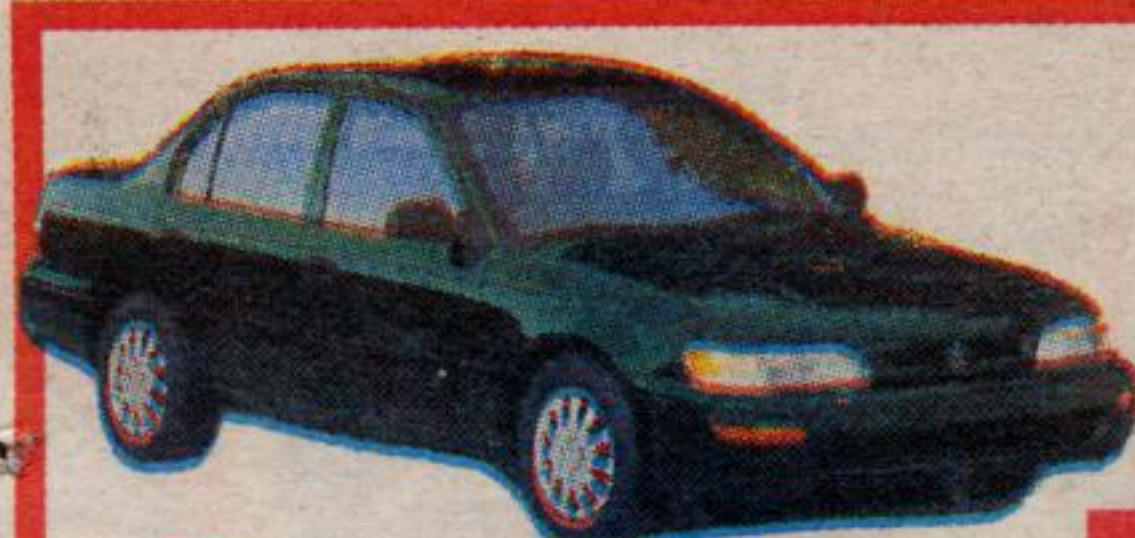
(Model BAOIEH-CAMS RP $16,923)

Teams from Bowmanville, Niagara Falls, Kars and Port Perry will take part.