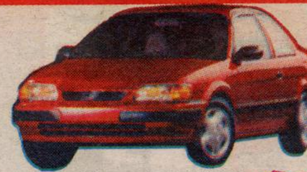
(Model BC5ILP-EA) MRSP $15,365.

1997 TERCEL CE • 1.5 Litre engine • Automatic • Power steering • AM/FM Stereo Cassette • Intermittent wipers • 5 yr. - 100,000 km warranty