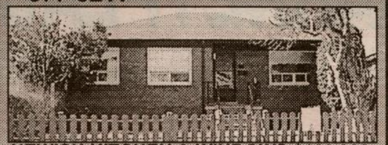
NEWISH KITCHEN & WINDOWS $169,900 Check my ad in this weekend's paper!