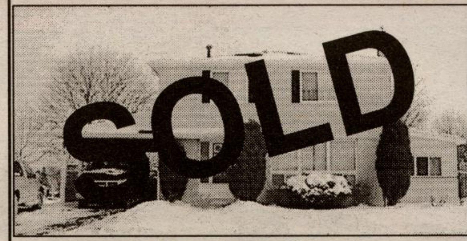
3 Dawson Road RM020-97