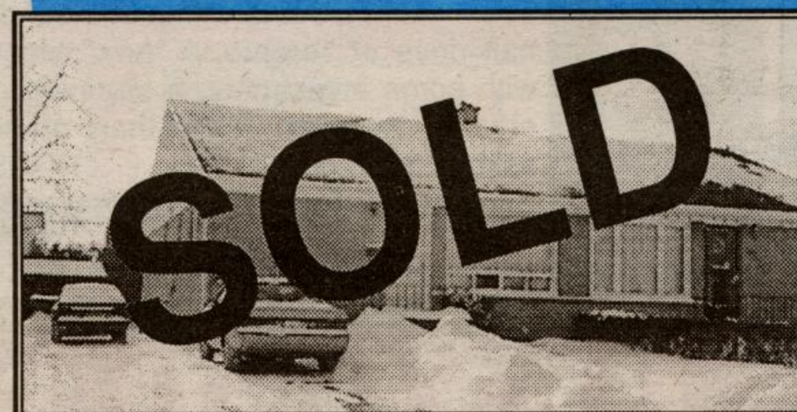
22 Langstone RM022-97