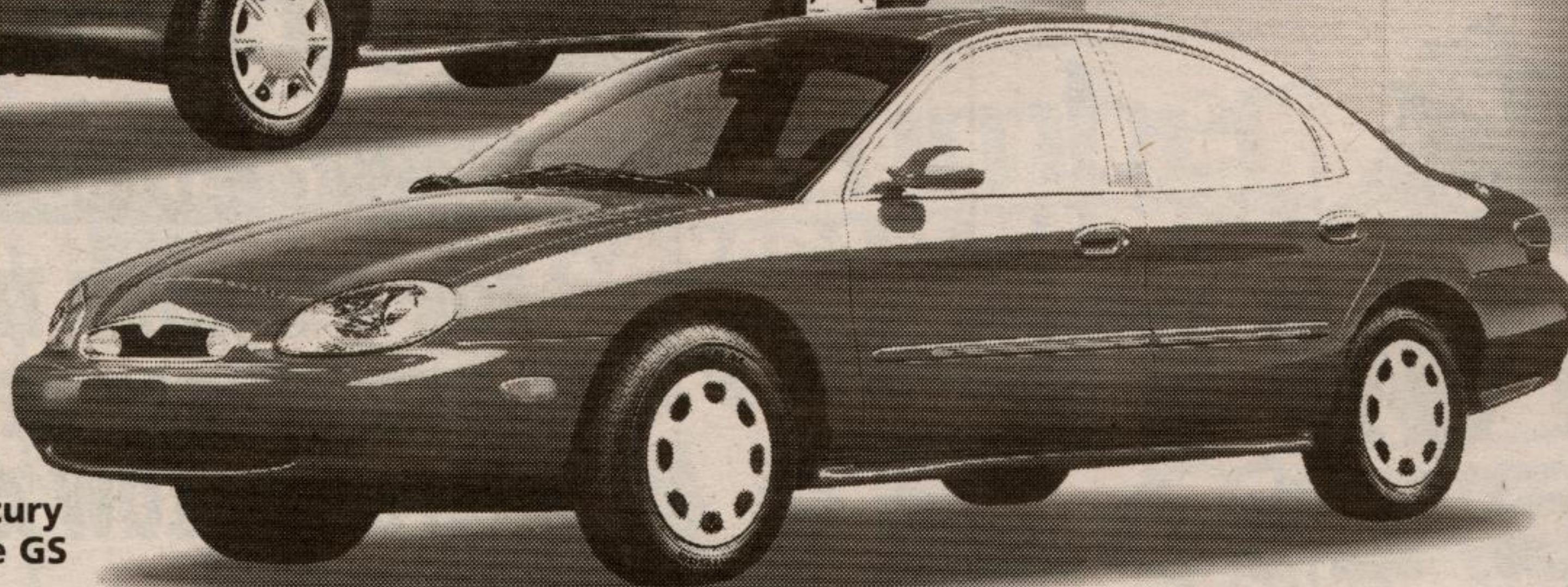
Mercury Sable GS