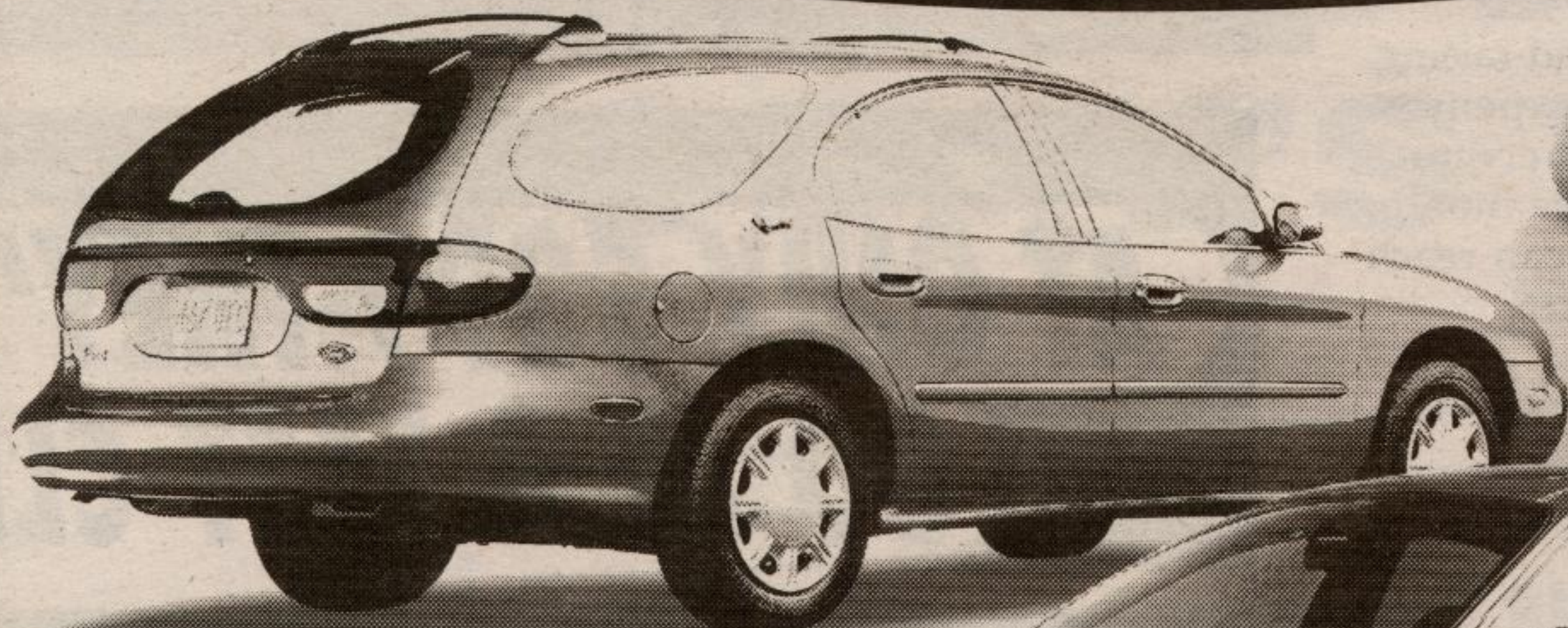
Ford Taurus GL

GIVE THEM SOMETHING SPECIAL TO TALK ABOUT!