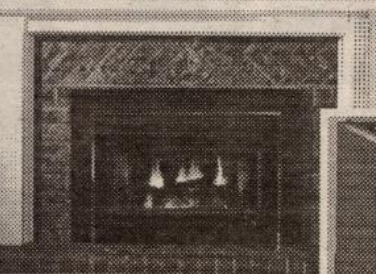
A Valor comfostat is the lowest gas fireplace heat turn down control in the market today