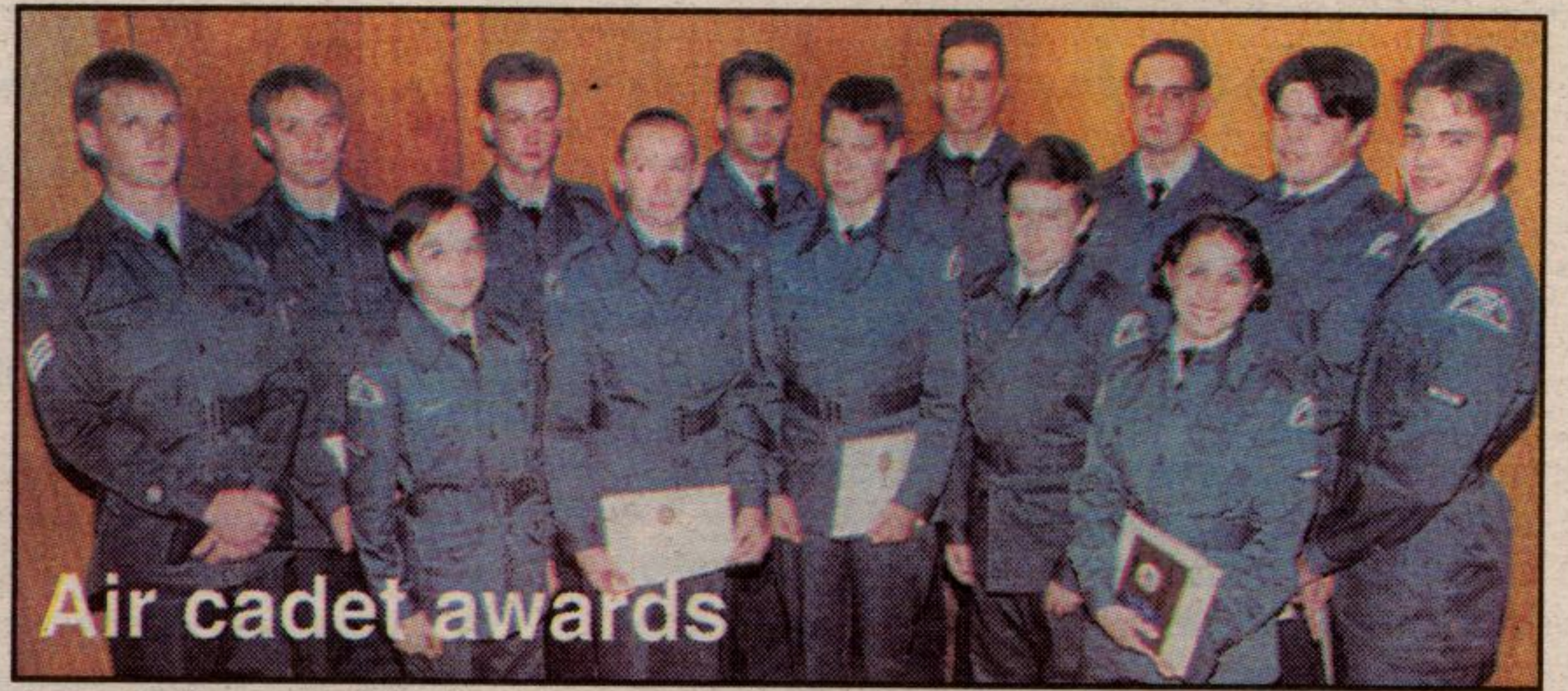
Air cadet awards