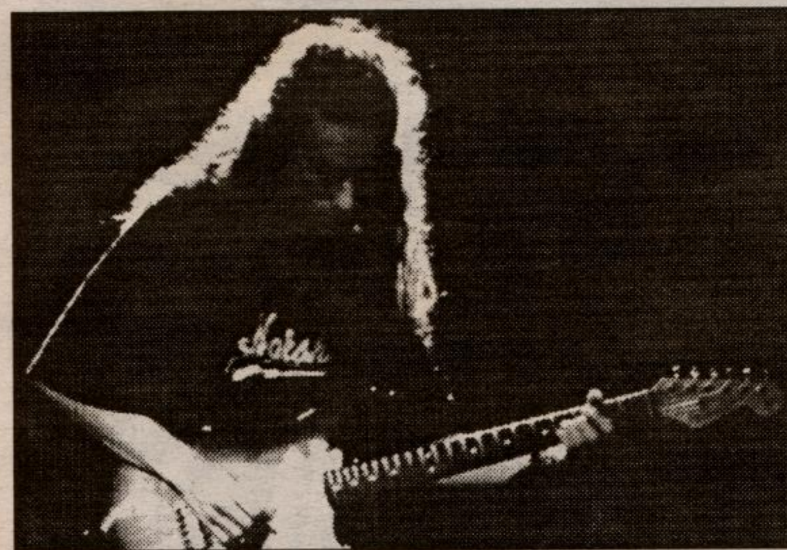
Instructor at Coulter Music