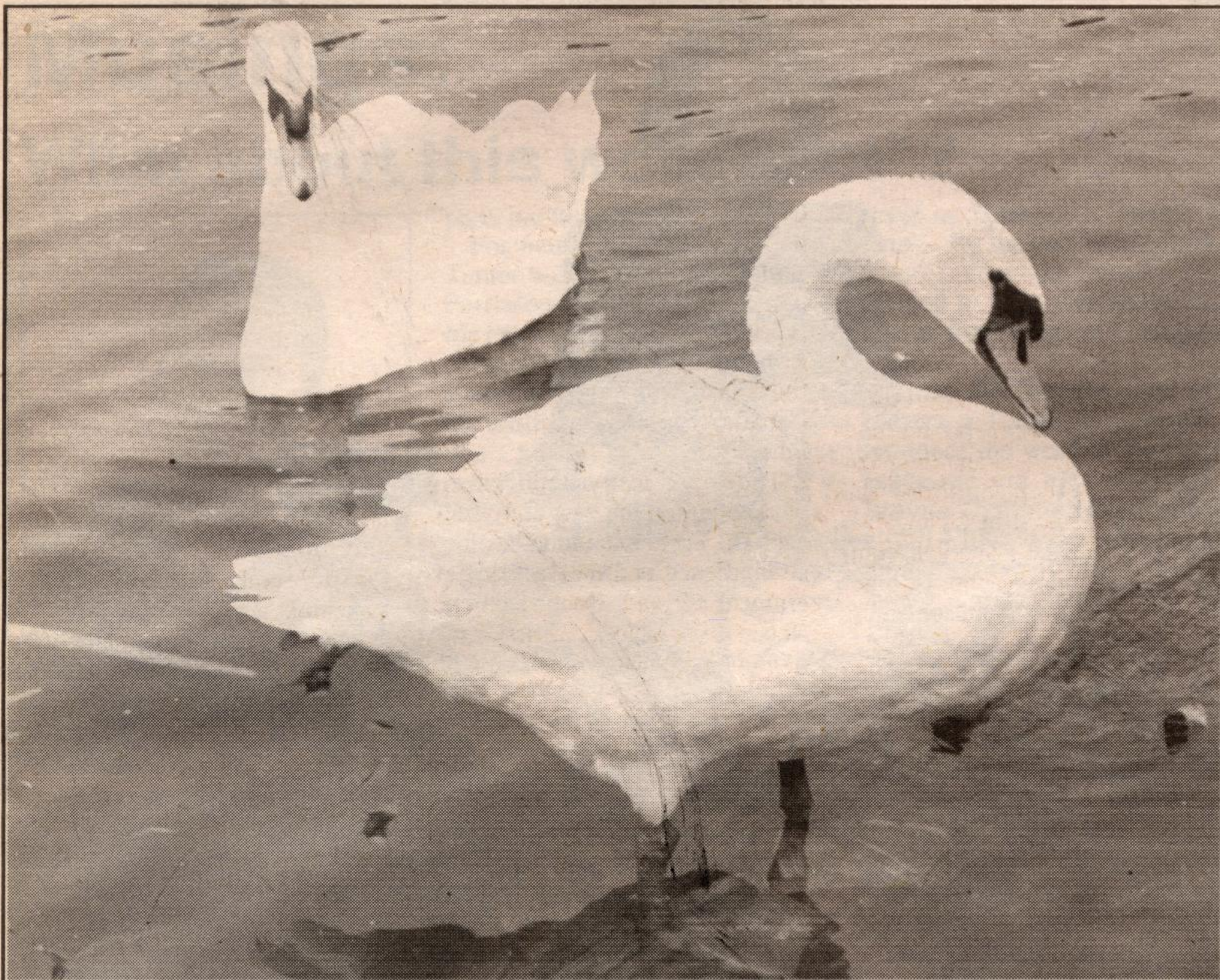
Swan Lake revisited at Fairy Lake? Not likely, although these two swans found an acceptable place to perch amongst their ducky cousins on Acton's Fairy Lake.