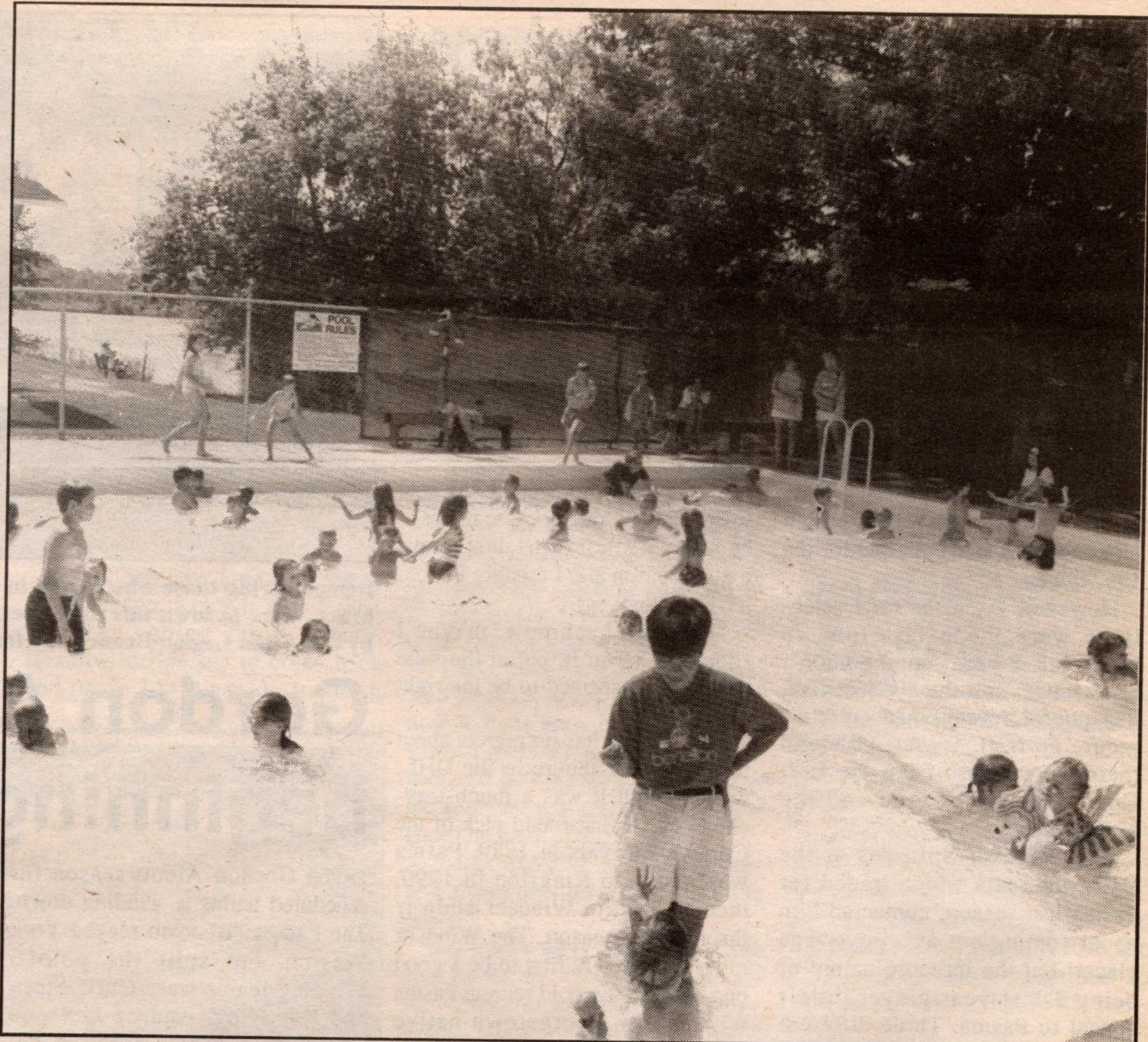
Taking full advantage of warm summertime temperatures, kids from all over Acton spent Friday at the wading pool in Prospect Park. Warm temperatures all weekend gave Halton Hills residents the taste of summer they had long been waiting for.

Taras lined up in the backfield until the 1990 season, when the six-foot-three, 24-pounder was reverted back to the offensive line.