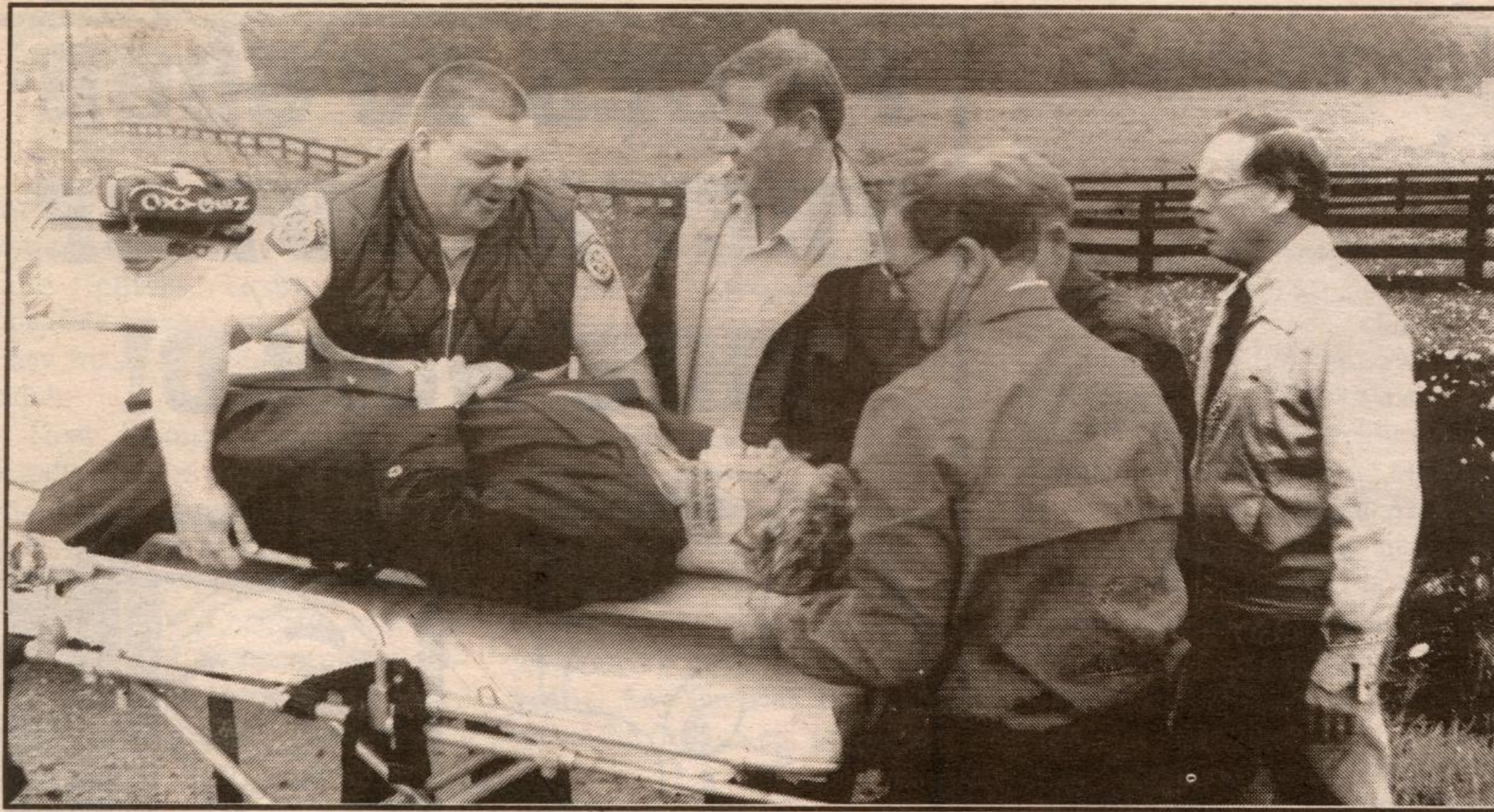
For the third time in a week, someone was injured at the intersection of Highway 7 and Trafalgar Road, south following an automobile collision. In this case, one woman was taken to Georgetown Hospital with minor injuries after a two-car crash, last Thursday.