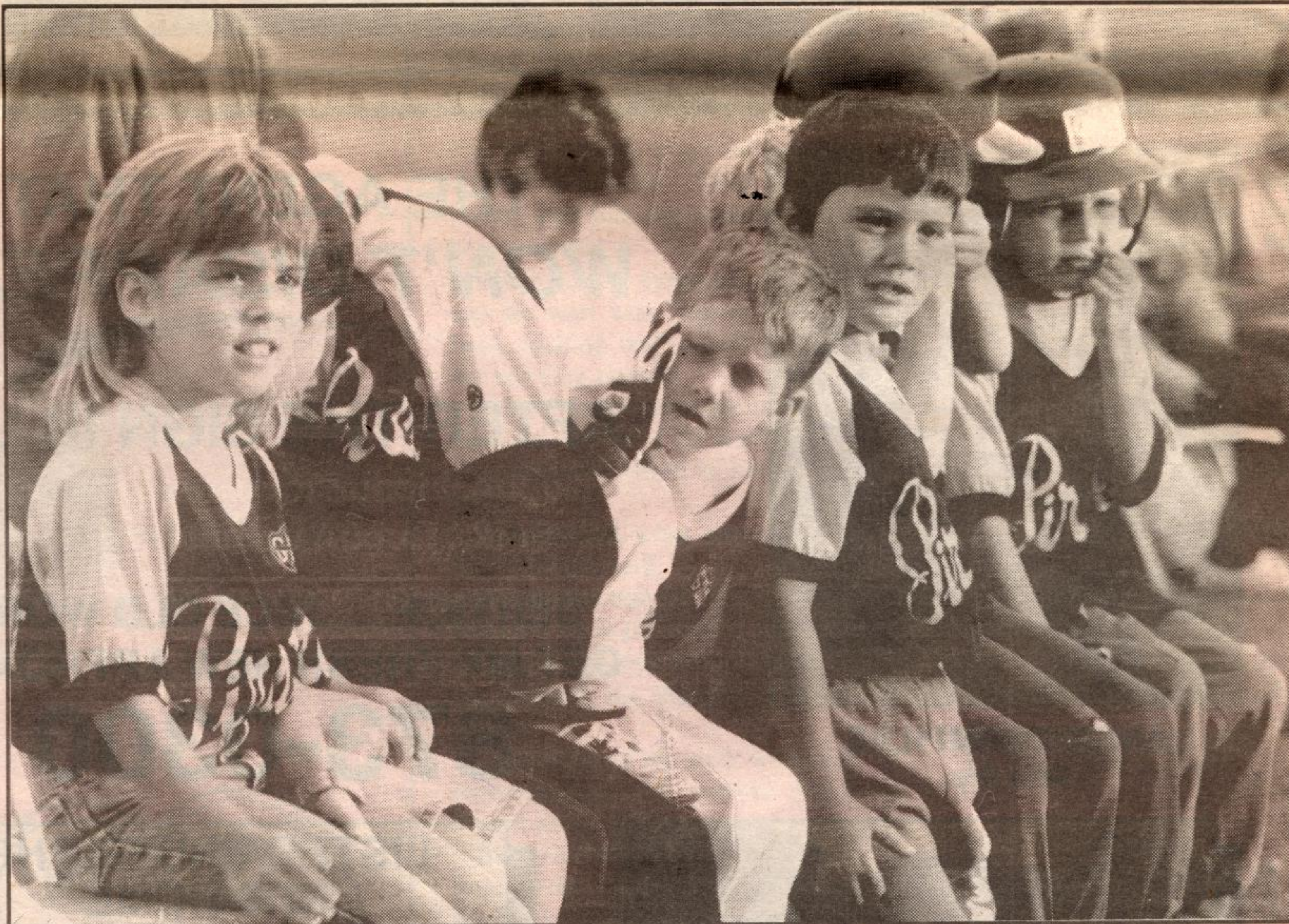
Patently waiting for their turn at bat during a T-ball competition at Joseph Gibbons Park Wednesday night are members of the Halton Rapid Print Pirates. The Pirates and their opponents, the NRS Blue Jays, both of the Georgetown Baseball Association, put on a good show for parents and spectators at the event.