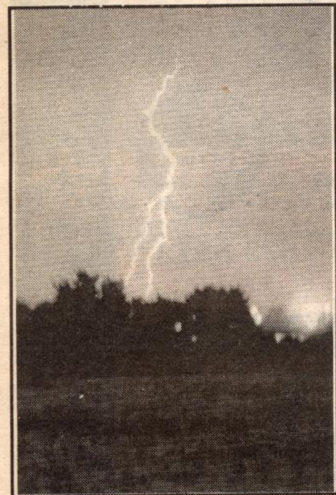
Mother nature put on a great light show following Monday's storm

No damage estimates were available at press time.