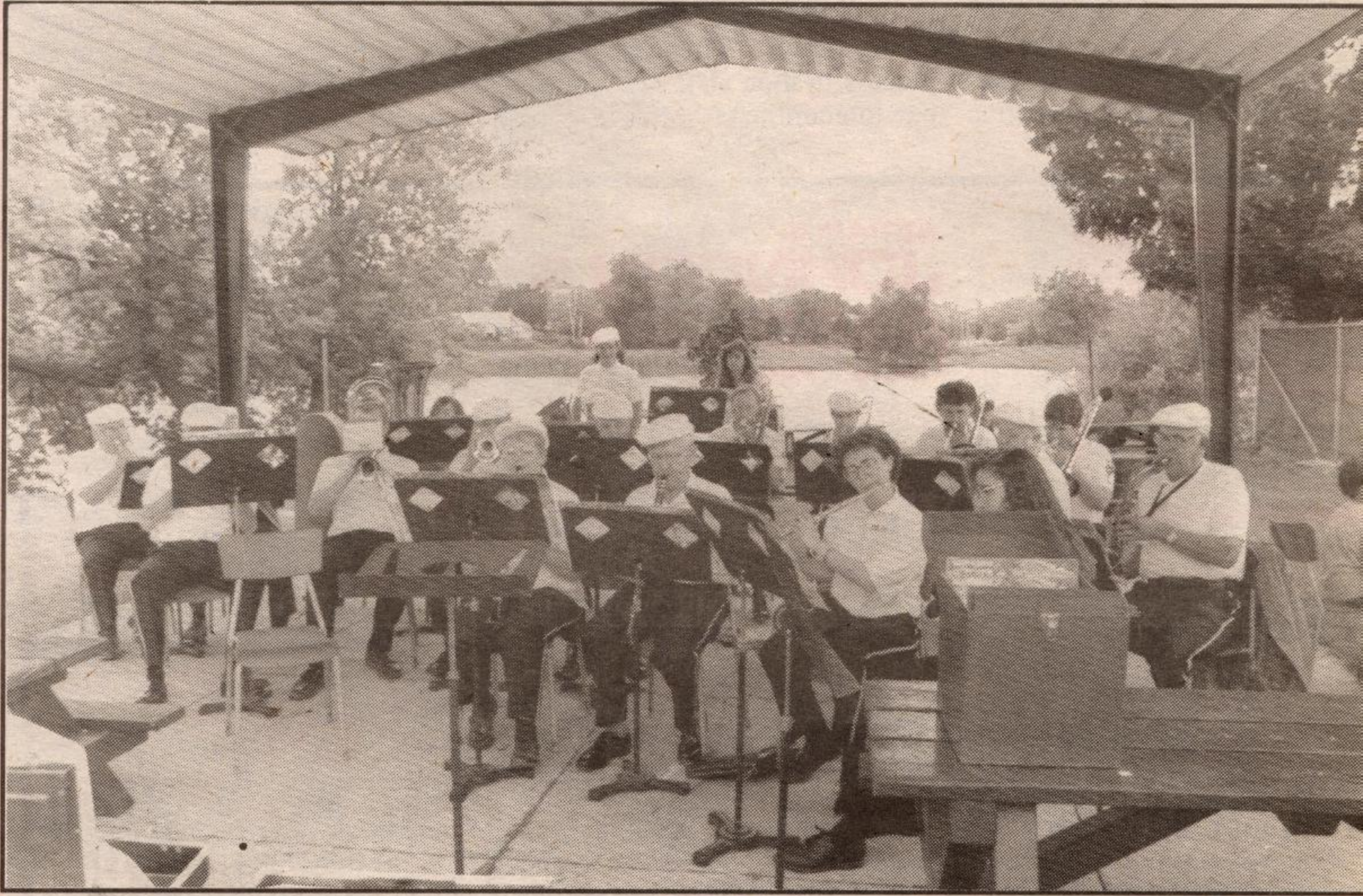
The Acton Citizens' Band helped entertain those at the Leathertown Festival last weekend. Several thousand turned out for the daytime activities.