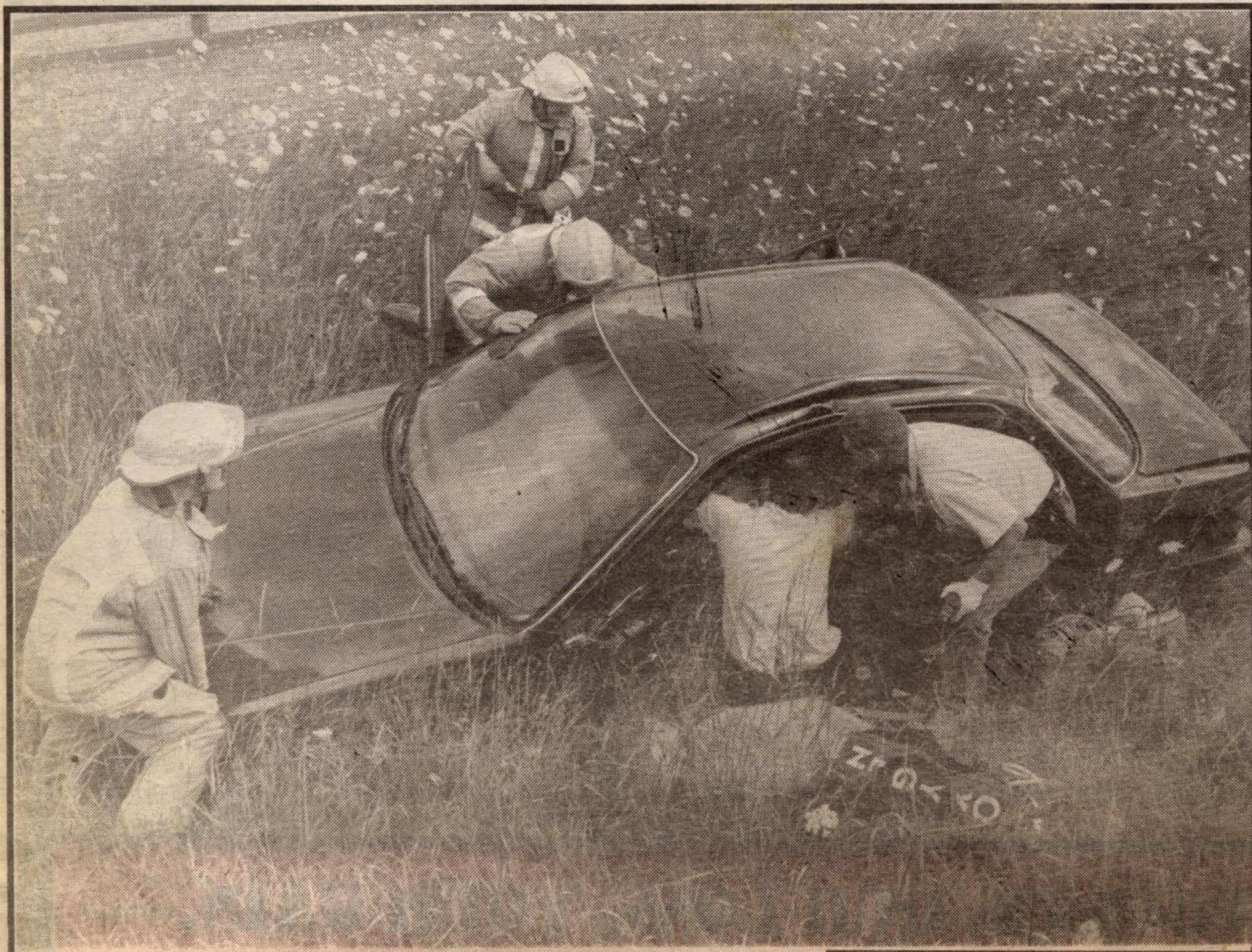
Three people were taken to hospital following a two-vehicle accident at Trafalgar Road and Highway 7 Monday morning.

According to Milton OPP, a 1991 Honda was making a left turn onto westbound Highway 7 at about 11 a.m. when it was struck by an eastbound 1987 Chevrolet. The Honda then slid into the ditch on the north side of Highway 7.