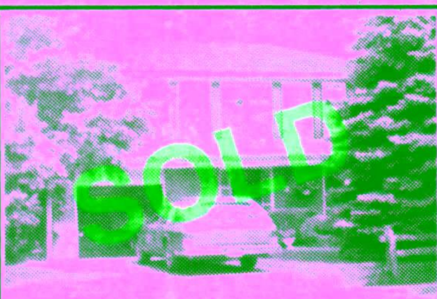
7 BAYLOR CRESCENT GEORGETOWN