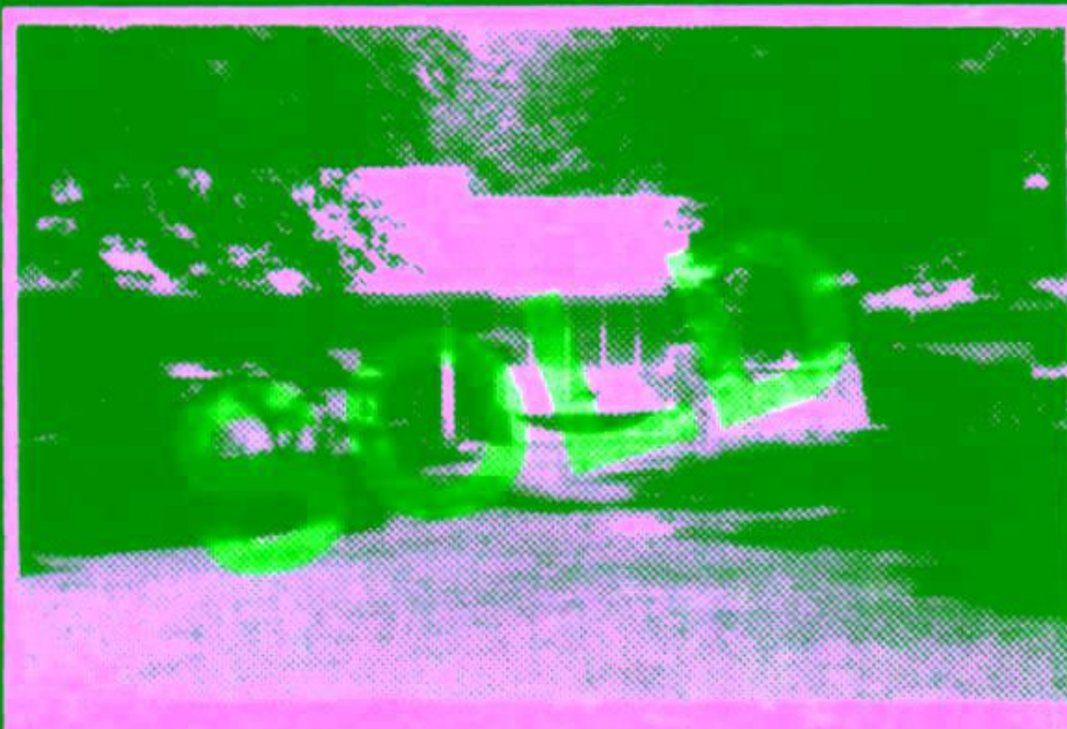
8TH LINE SOUTH HALTON HILLS