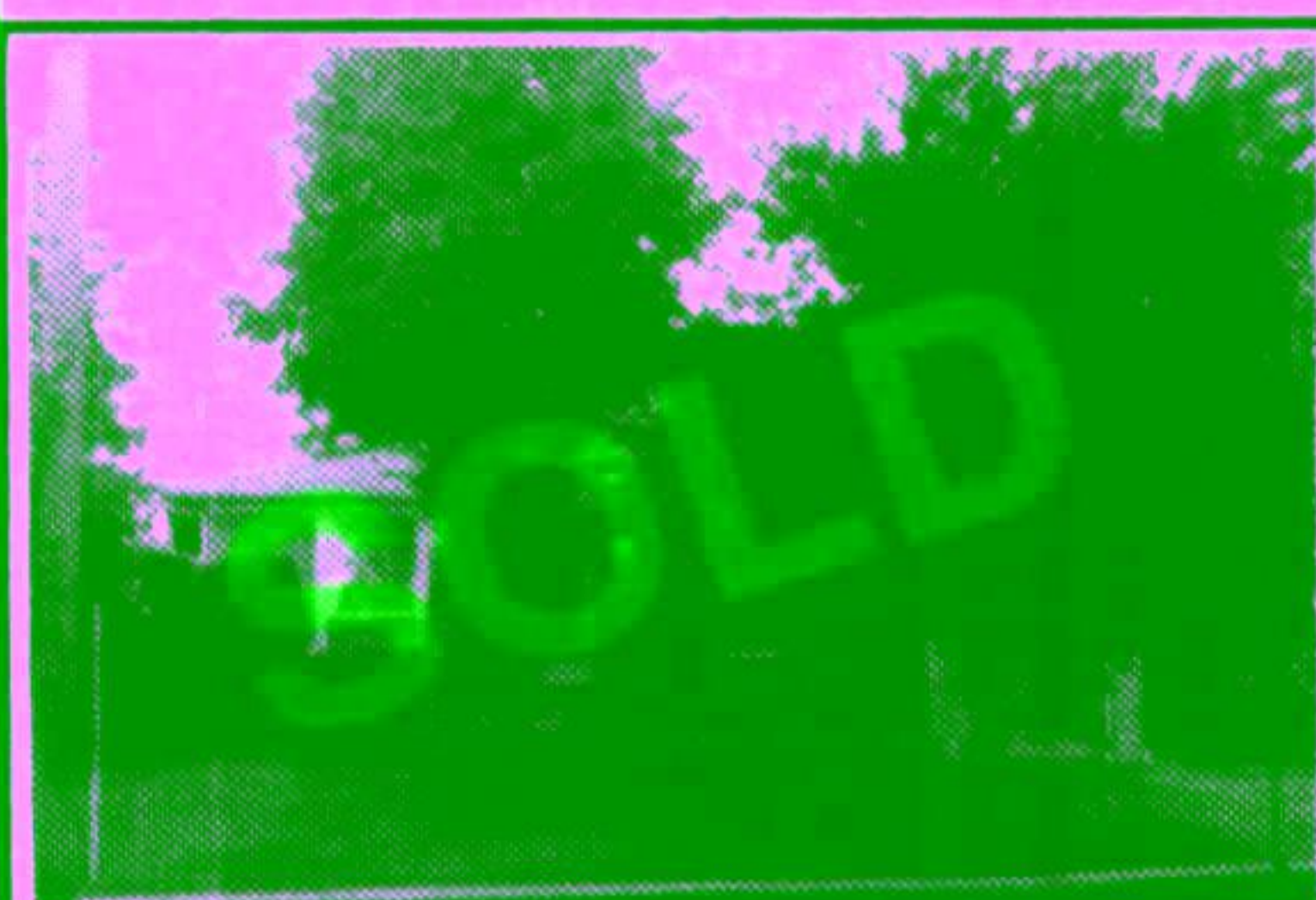
17 METCALFE COURT GEORGETOWN

Not intended to solicit properties already listed for sale