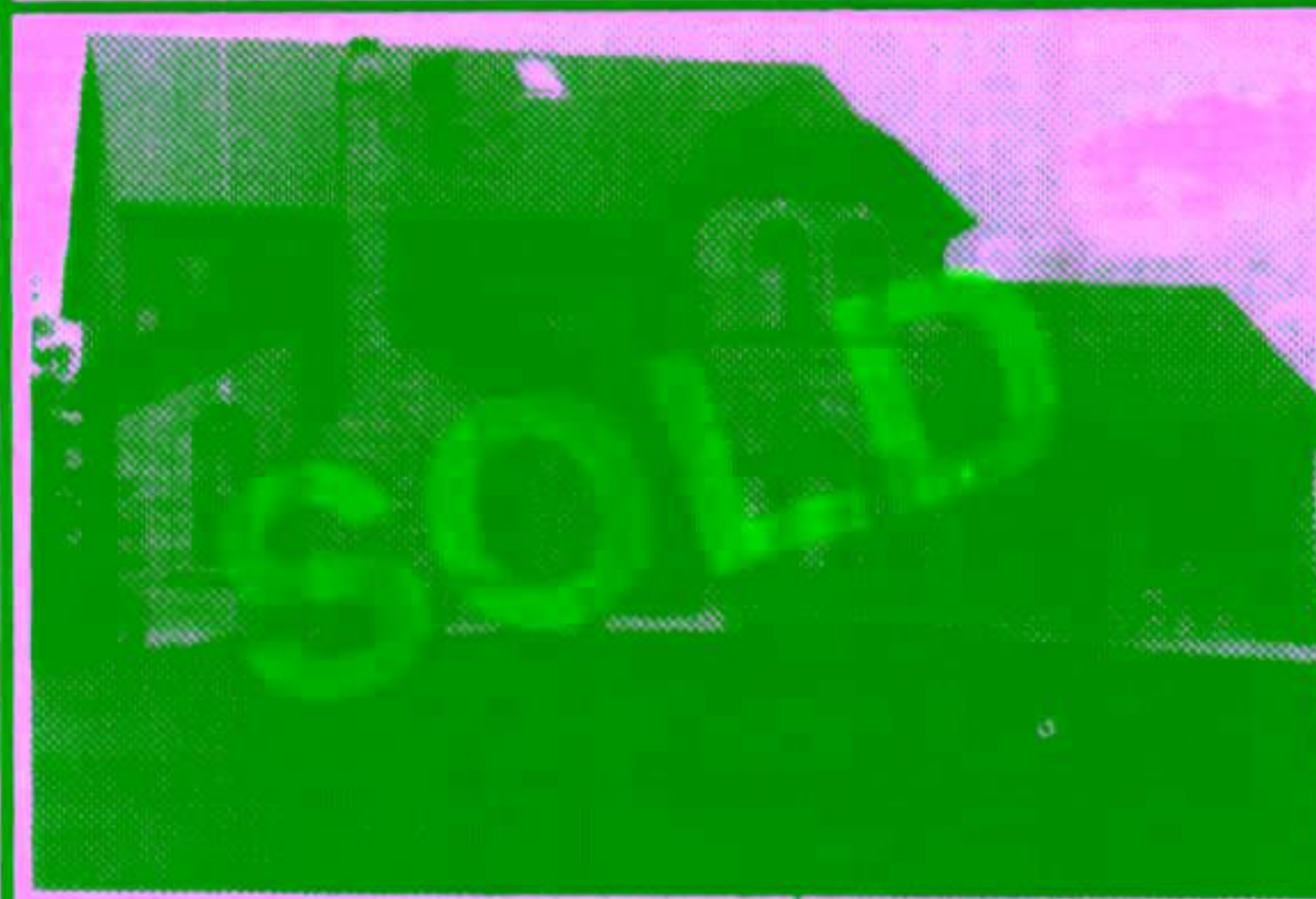
11 MEAGAN DRIVE GLEN WILLIAMS