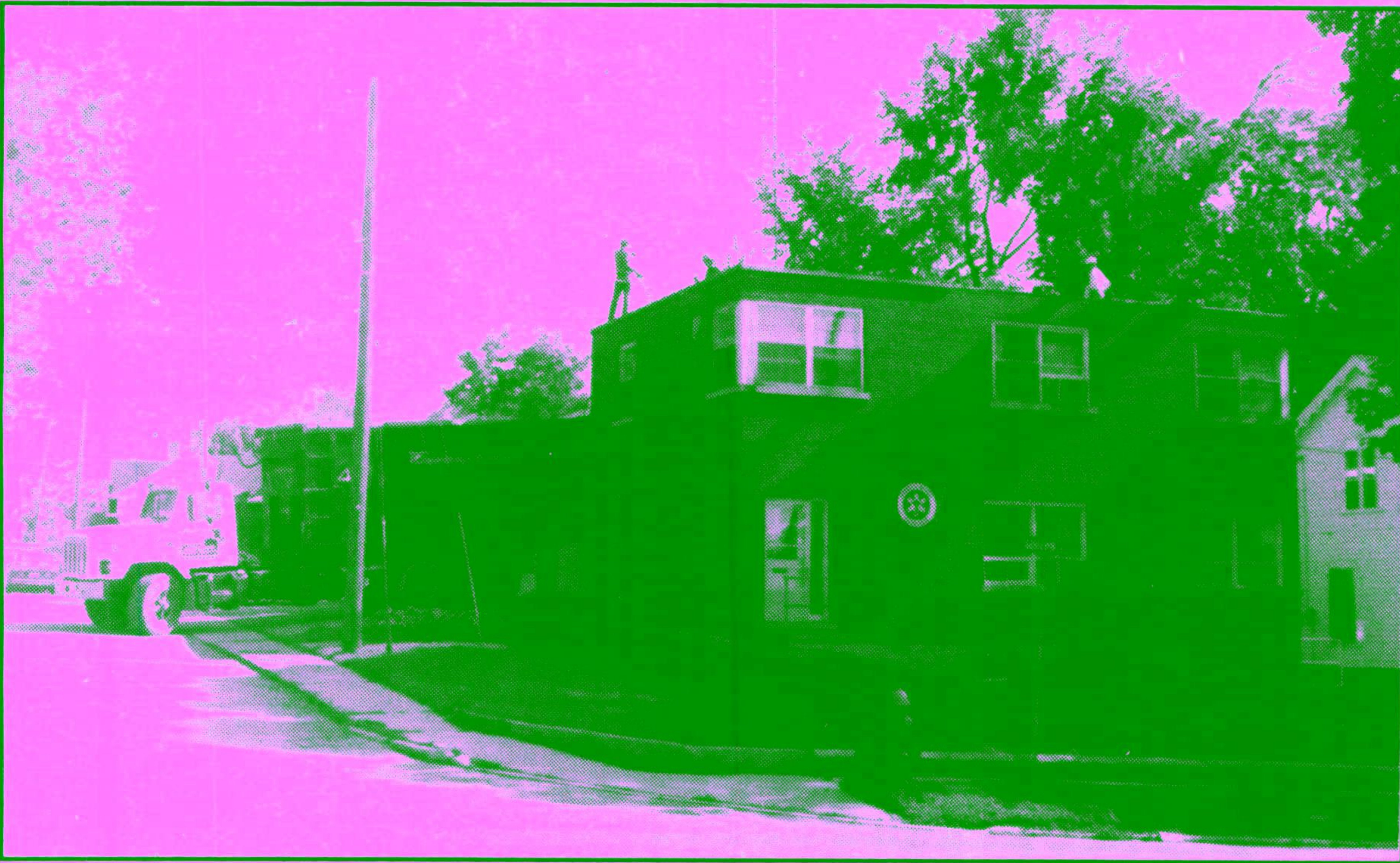
The roof at the Halton Hills Ambulance base was beefed up this week. Workers started work on the former fire hall roof between rain showers this week. The work was expected to take a week.