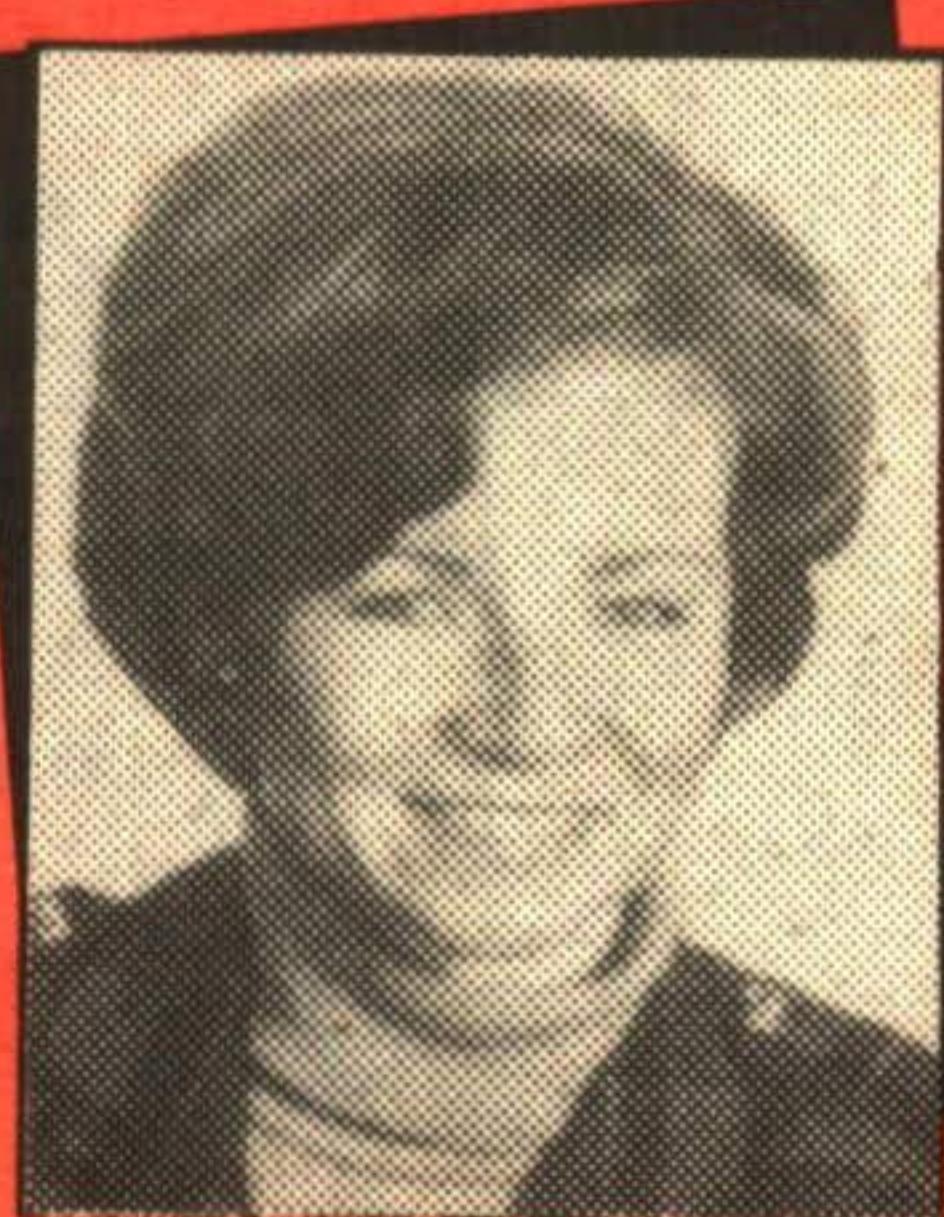
* Sales Rep.