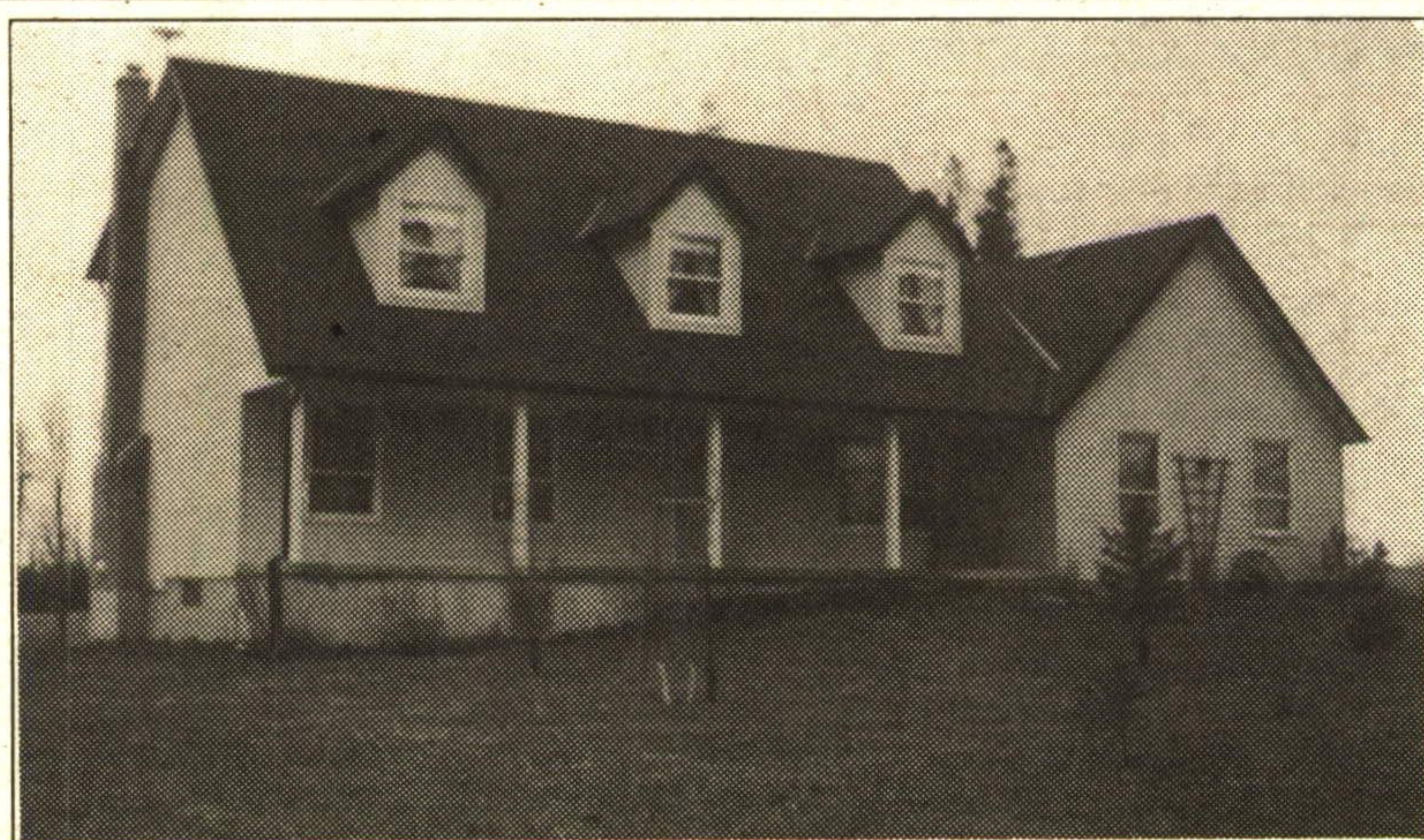
Classic Cape Cod on 2 acres with a Pond