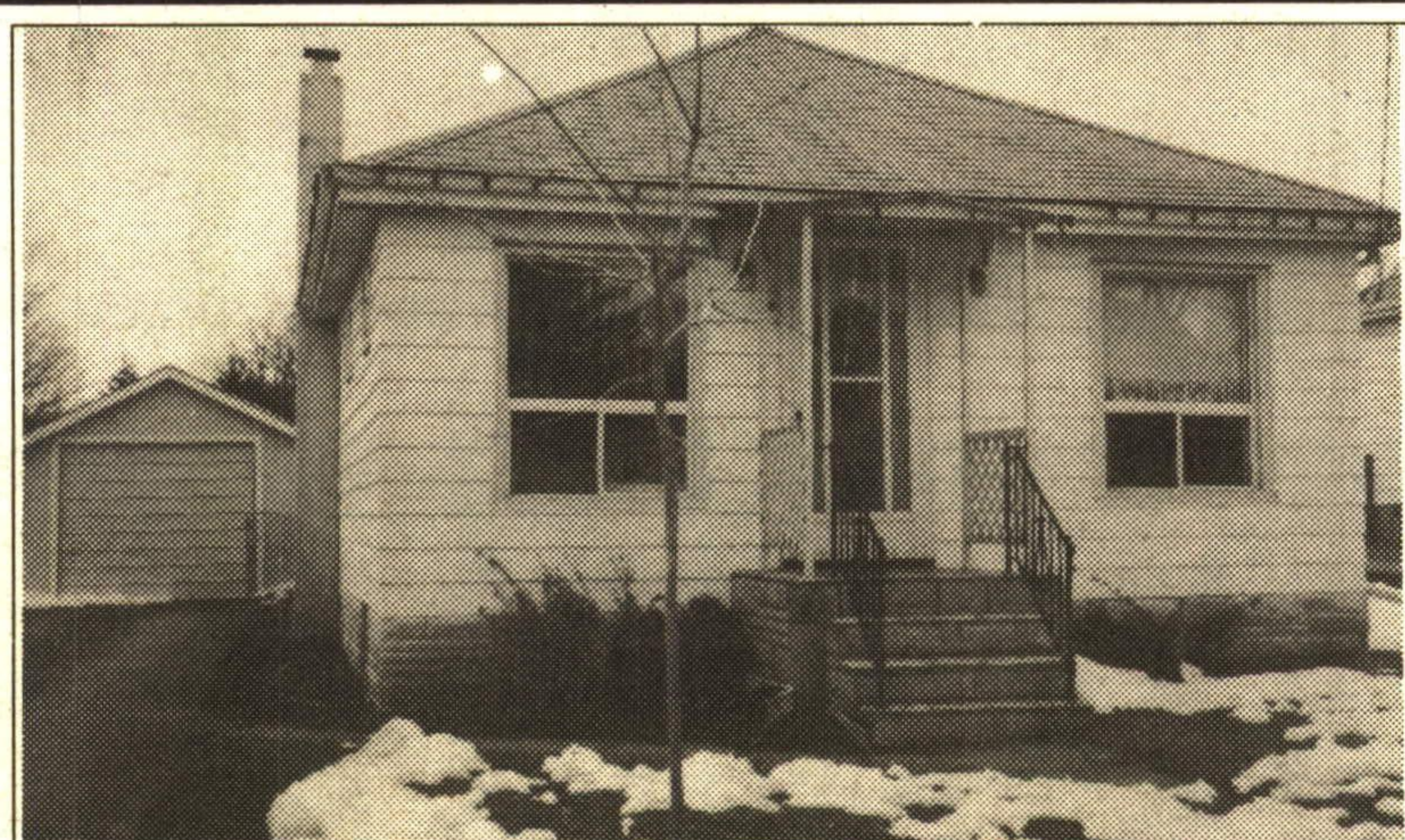
This Could Be Your First Home!

Call 873-6727 For Recorded Descriptions Of These Homes 24 Hours a Day