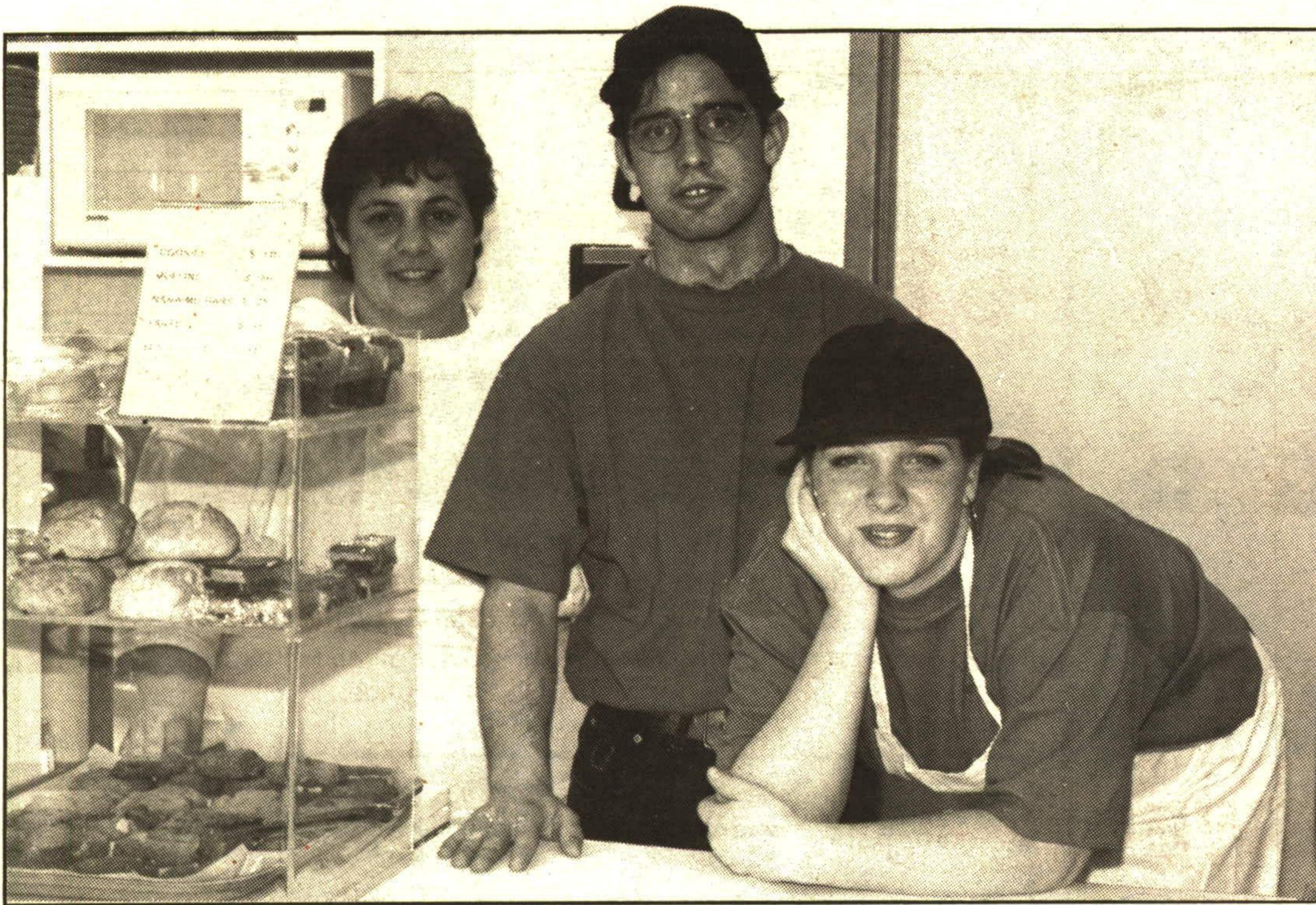
Fresh made sandwiches and salads are the specialties of the recently opened Variations Cafe located in Unit 2A at 348 Guelph St. Patrons can choose to either eat in or take