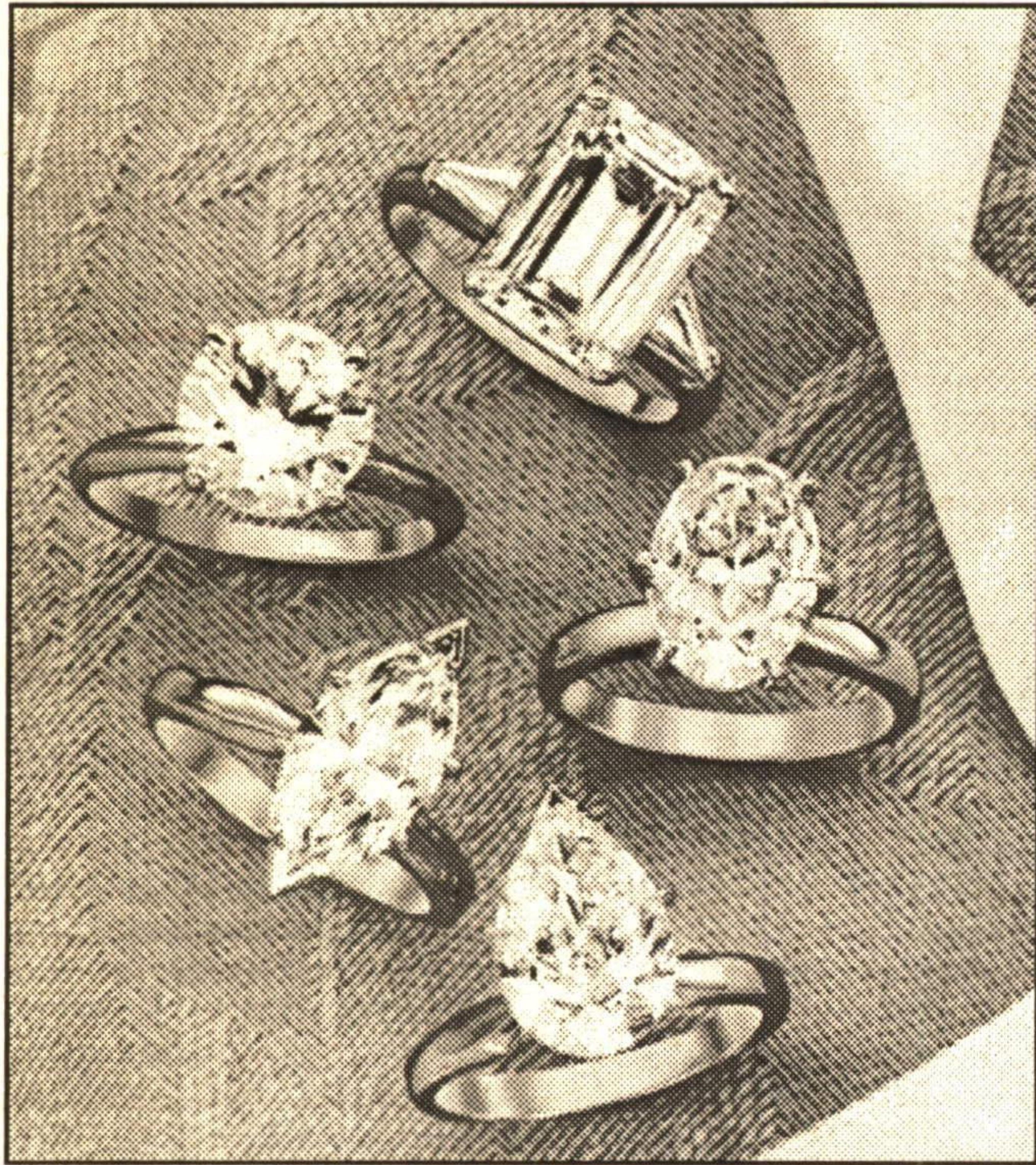
A diamond engagement ring is a symbol of love and romance. No two diamonds are alike, so when selecting a diamond, consumers should visit a reputable jeweler whom they know and trust.