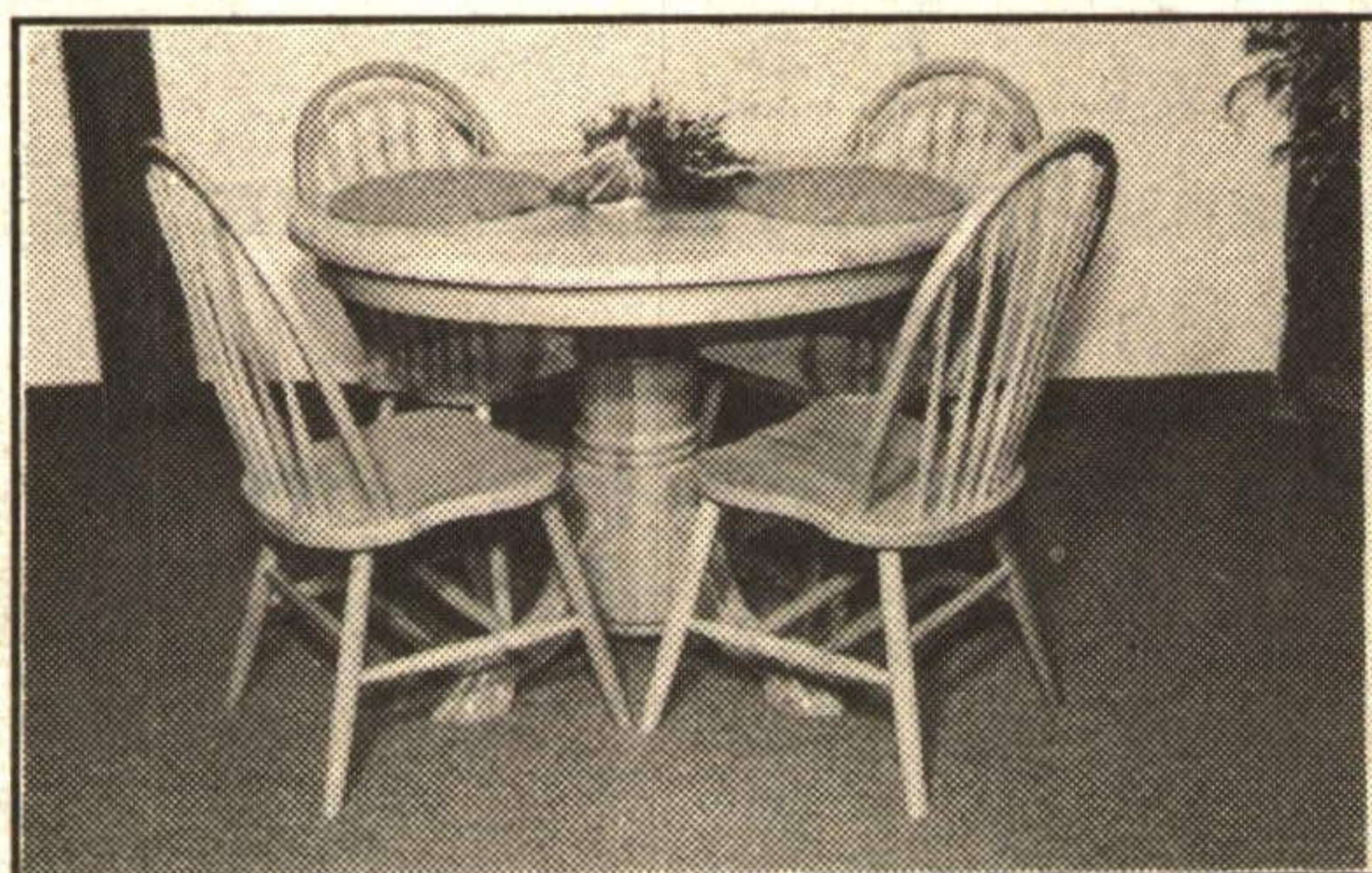
All Dining Room Tables, Chairs, Hutches & Buffets Reduced!

ALL LIVING ROOM SOFA SETS REDUCED DON'T MISS OUR ONLY SALE OF THE YEAR