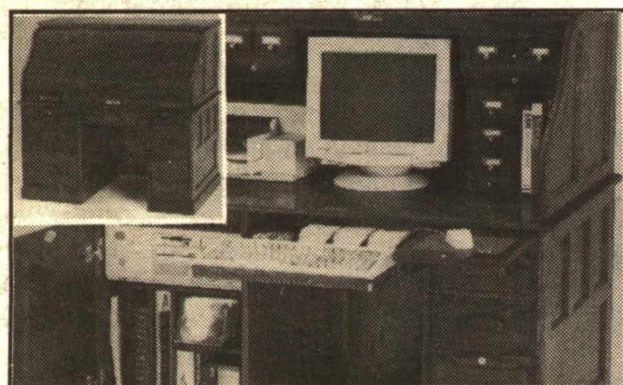
Computer rolltops & flat desks & a large selection of oak bookcases of all sizes reduced.

OUR EVERY DAY LOW PRICES REDUCED EVEN MORE!