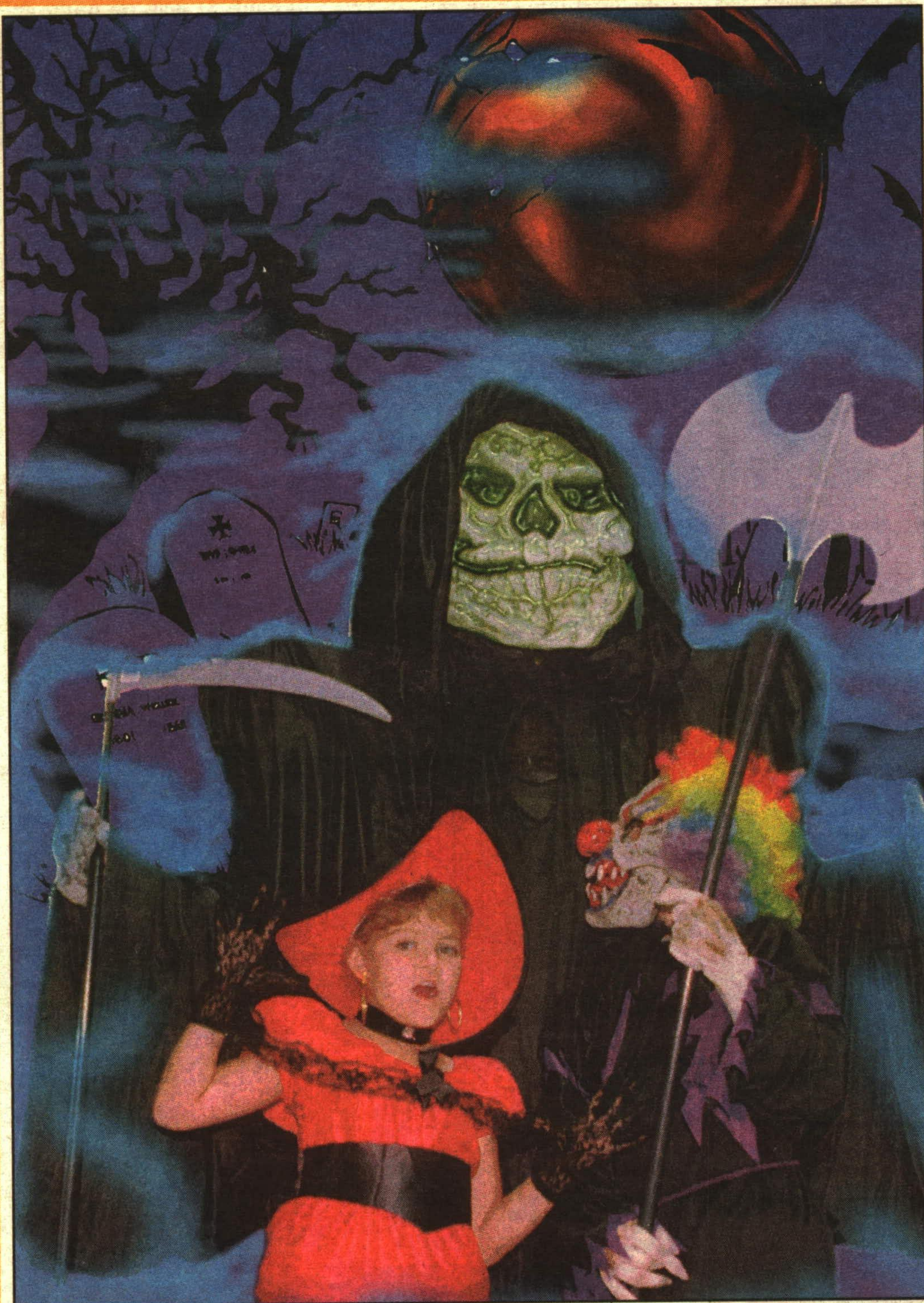
Youngsters will be dressed as a variety of characters on Tuesday evening as they head out on the town trick-or-treating as part of the annual Halloween ritual. Everything from the conventional ghost to Batman, Pocahontas and the Power Rangers will be knocking on doors hoping to land some of the goodies the neighbors are shelling out.