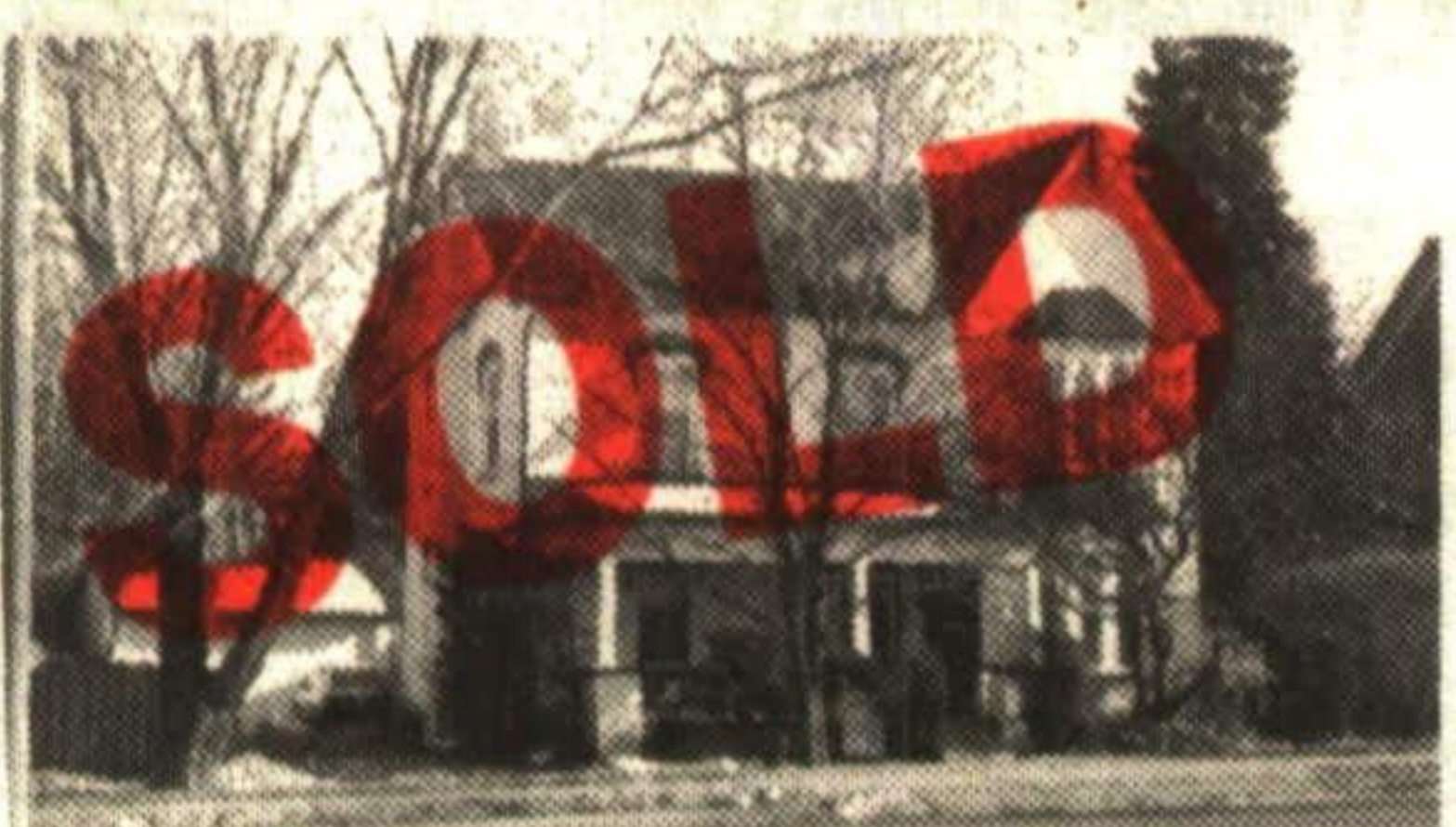
41 Main St.

Beatrice Keck* & Barb Glenn* will be in attendance to show you thru. Please call (905) 877-9500.