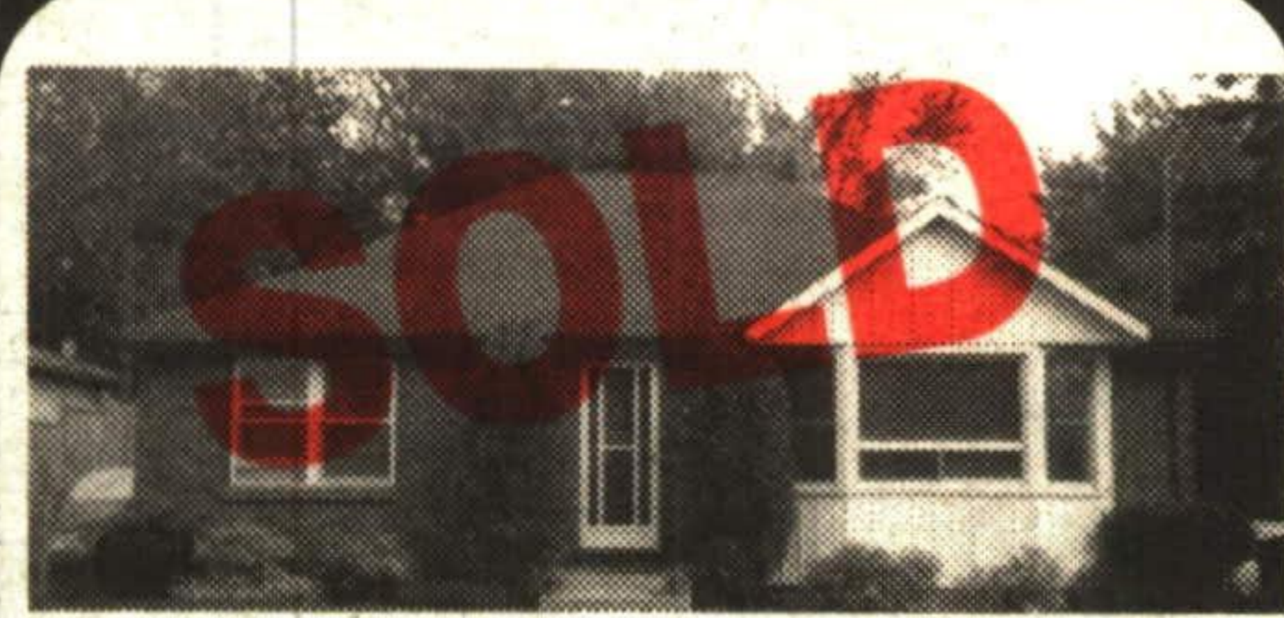
2 College St.