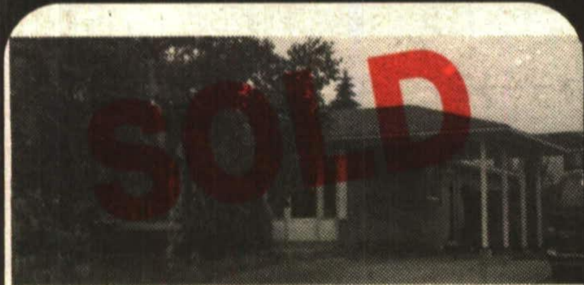
20 Marilyn St.