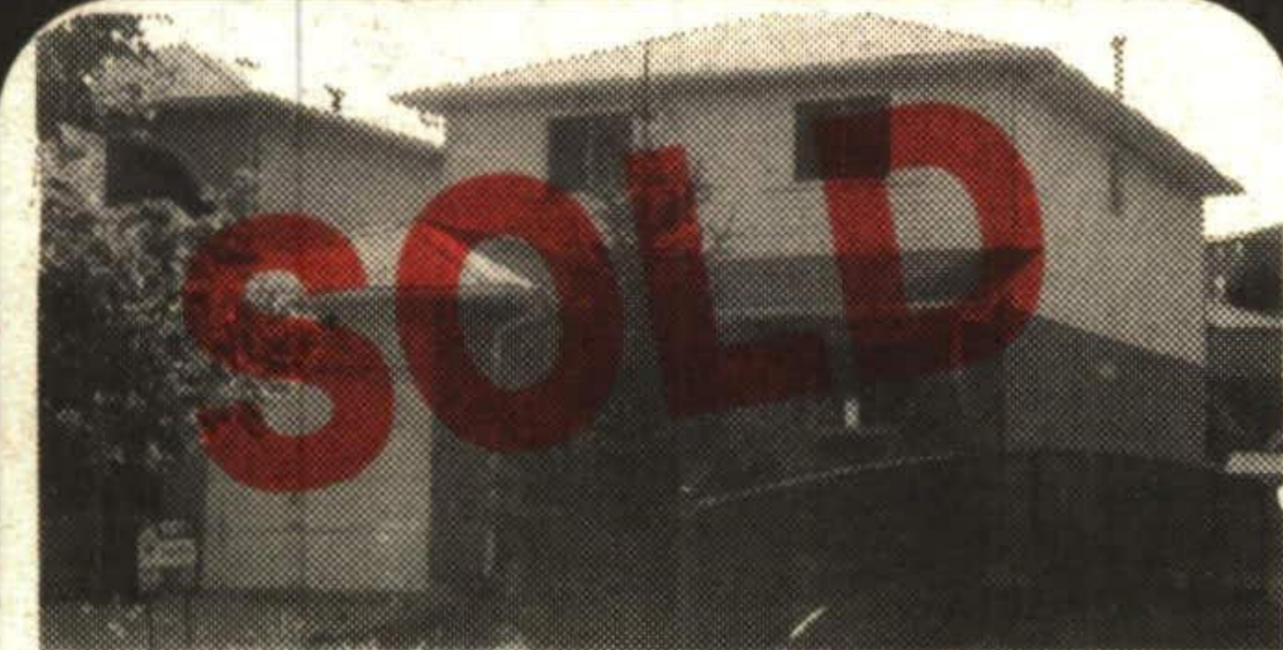
70 John St.