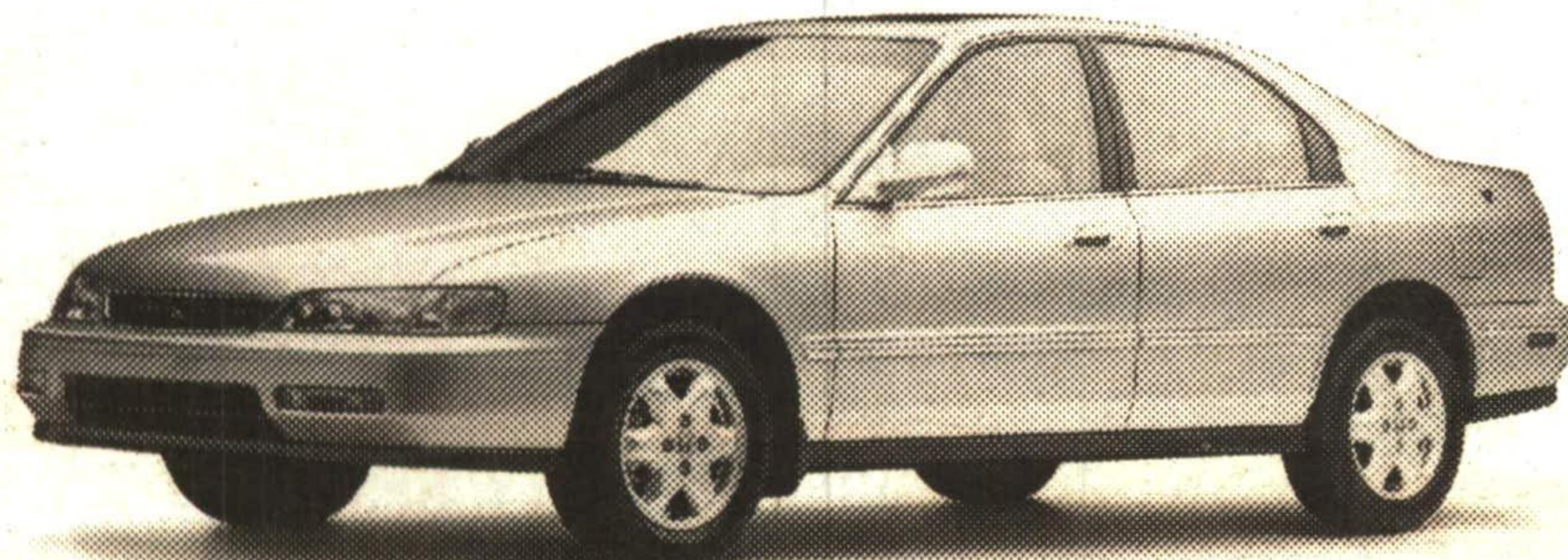
1995 ACCORD V6 EXR

5.8% factory financing 24 to 60 month fixed rate.