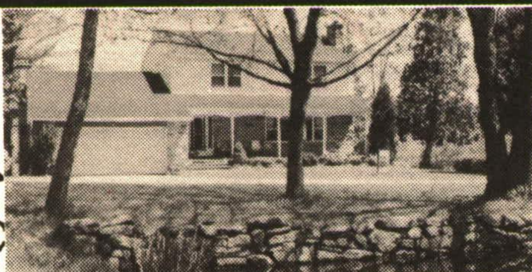
COUNTRY CLOSE TO GEORGETOWN