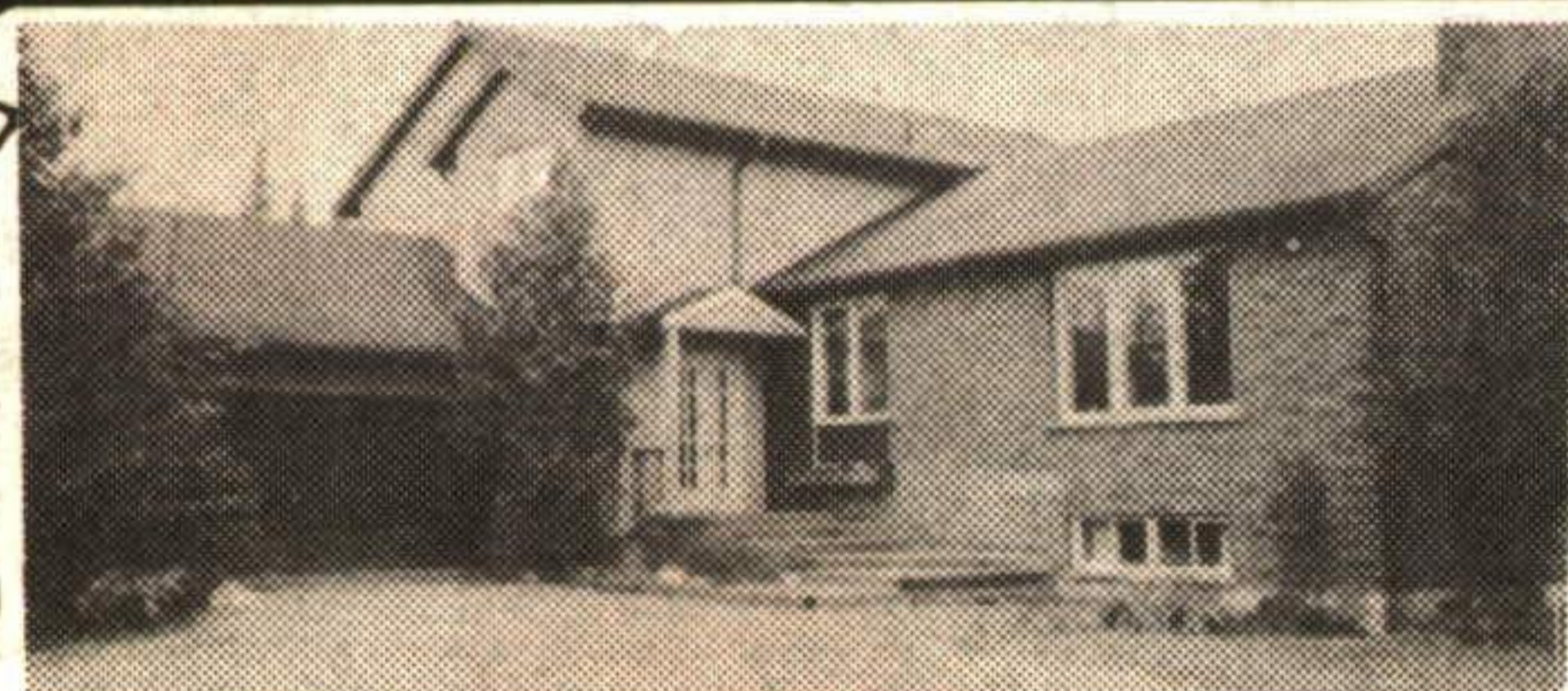
CALEDON - 68 ACRES - WATER GARDEN - $399,000