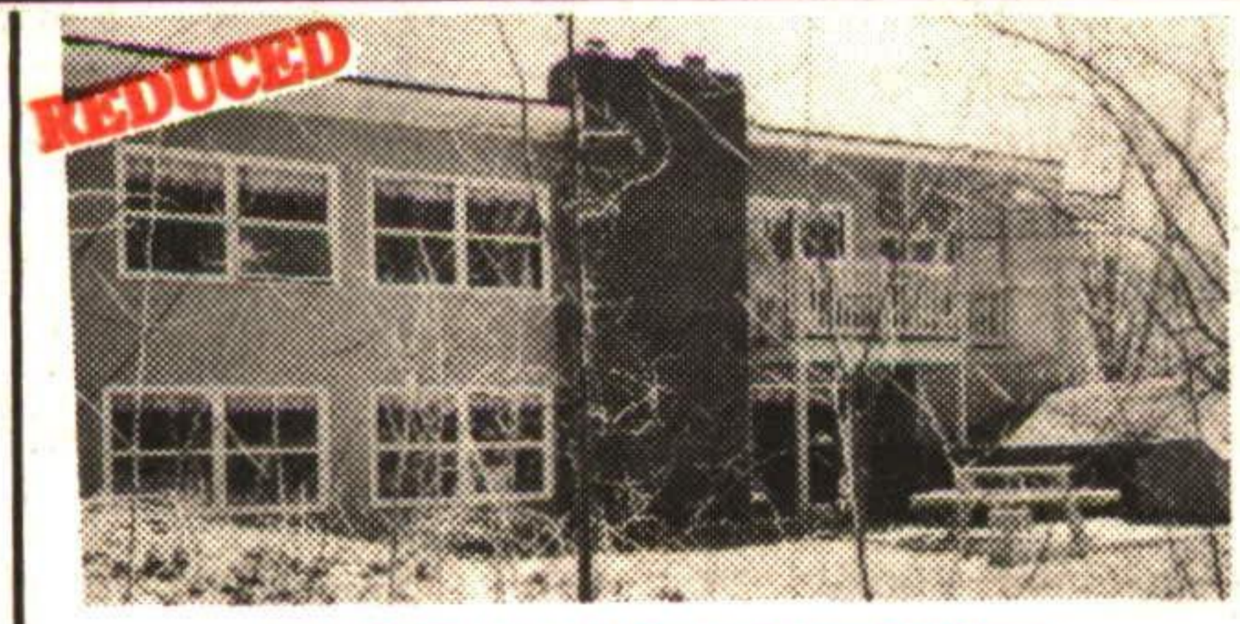
FORKS OF THE CREDIT 2.5 ACRES - $264,000