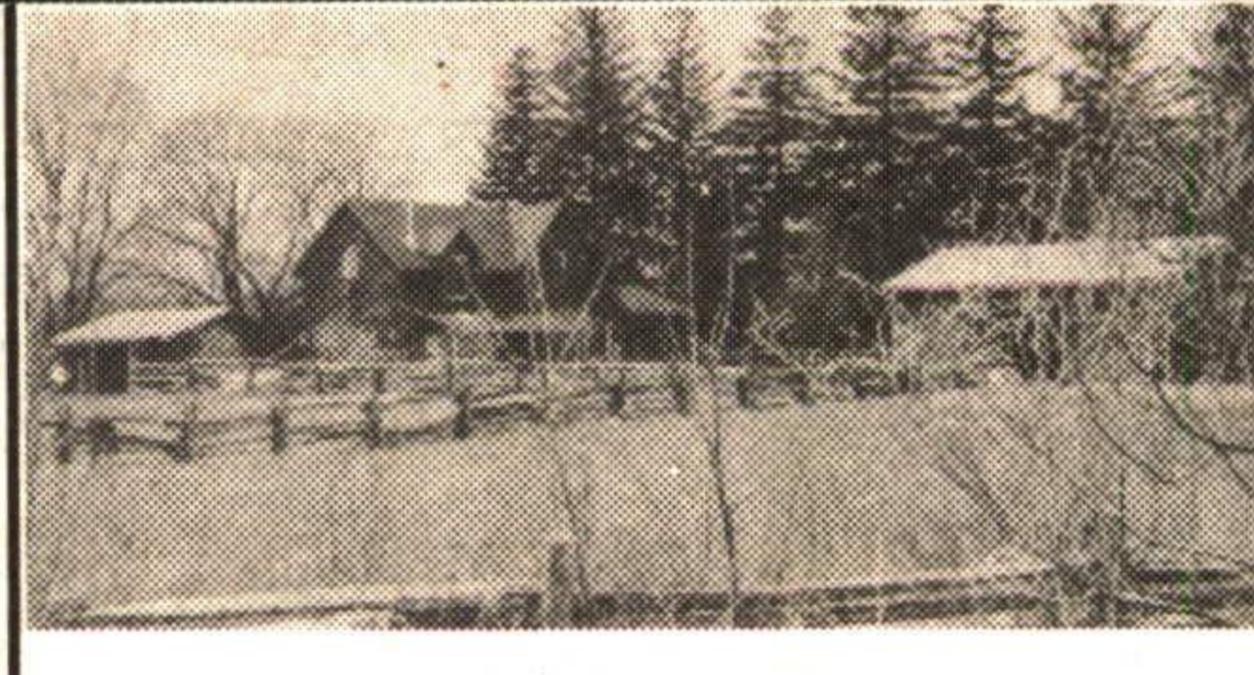
CALEDON HOBBY FARM