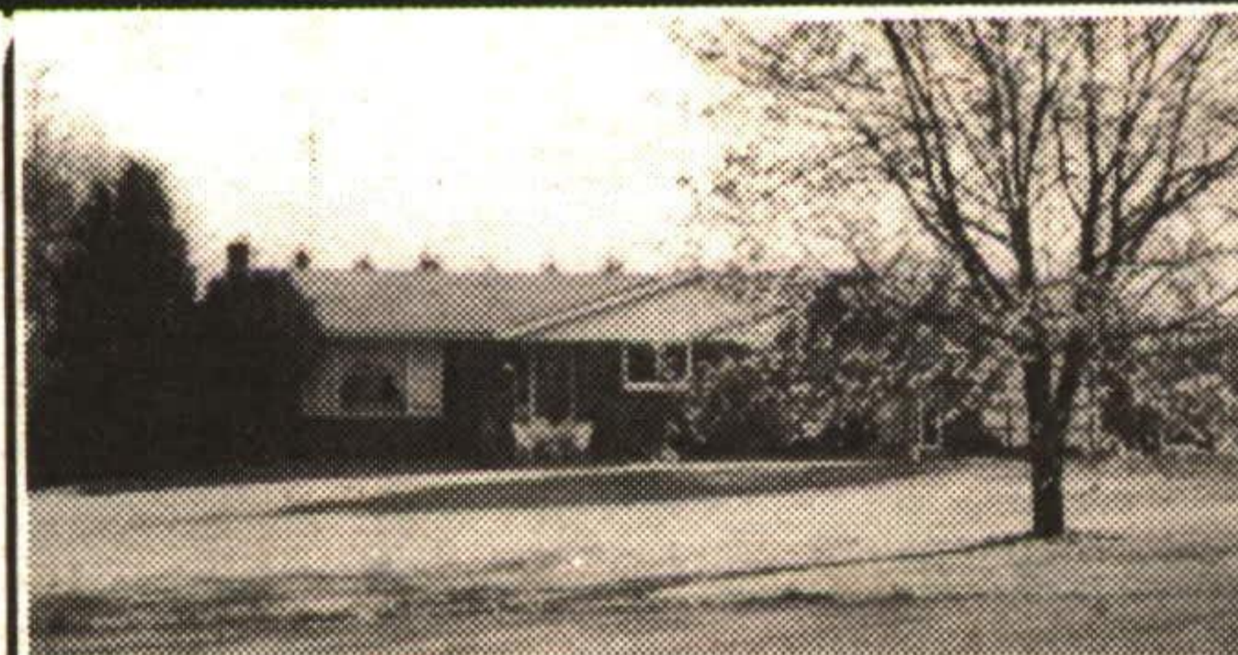
MINUTES TO 401 $199,000