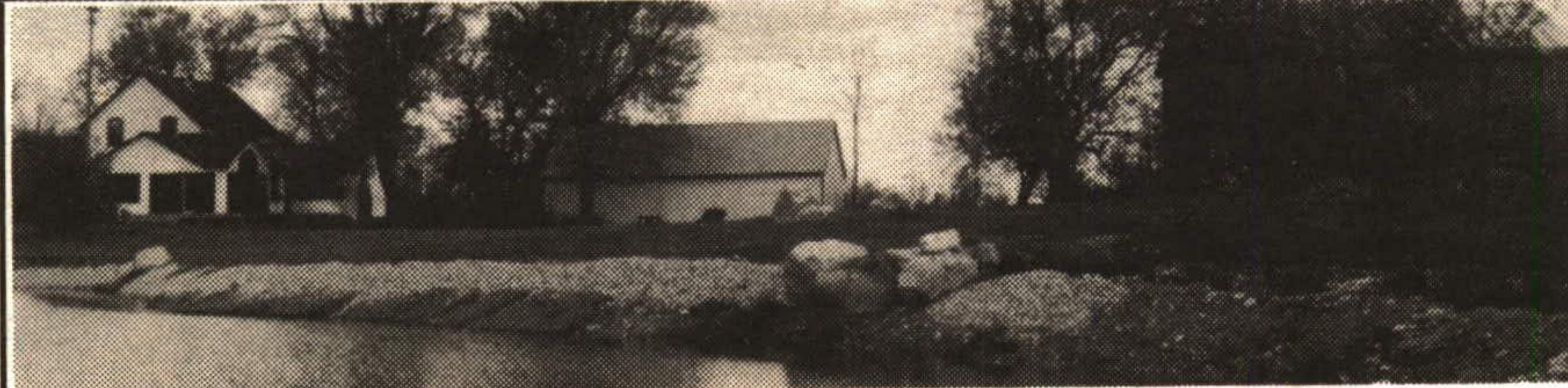
ERIN SOUTH - 96 ACRES - CENTURY - $450,000