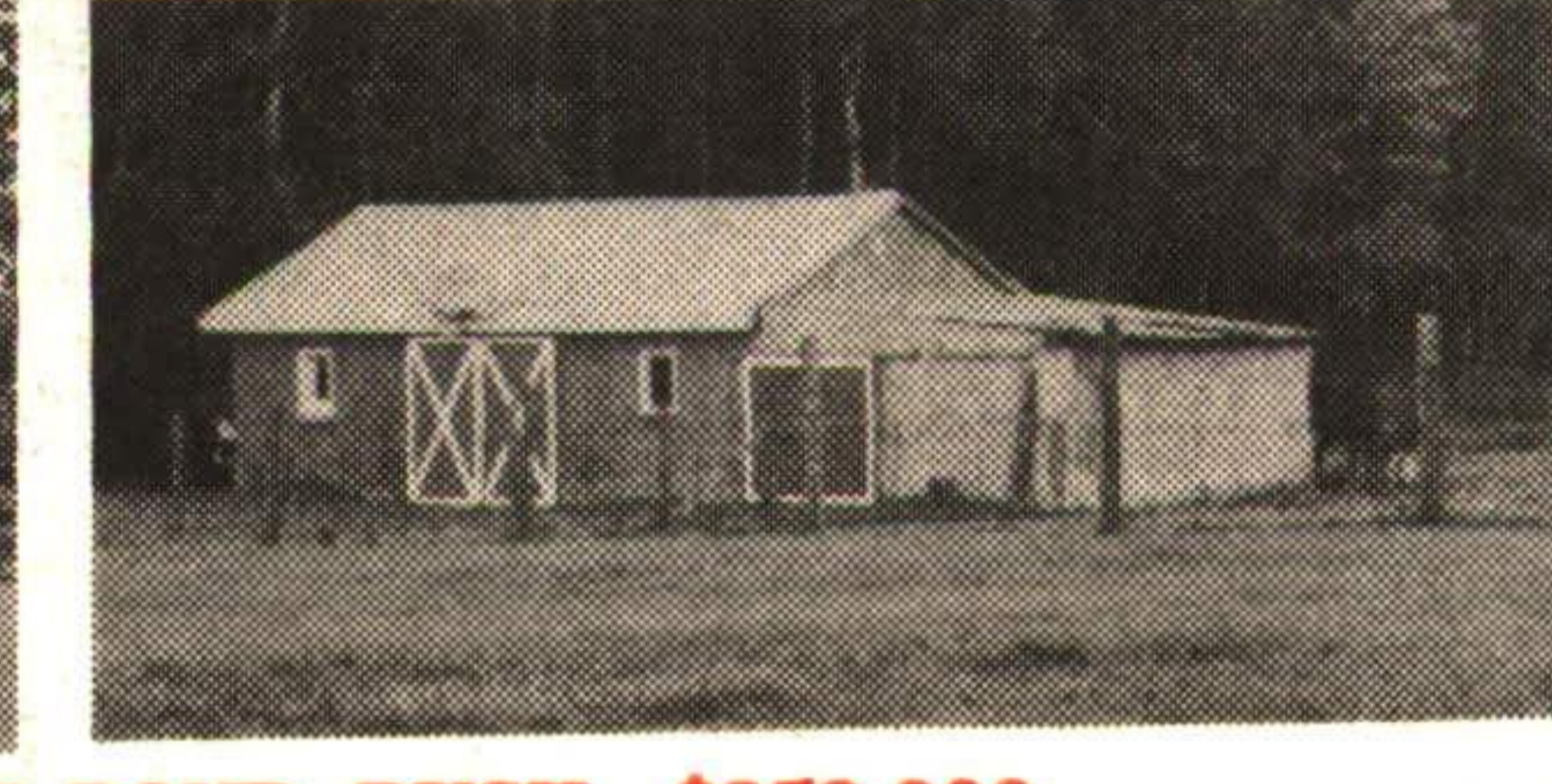
ERIN ORIGINAL CHARM 90 ACRES $339,000