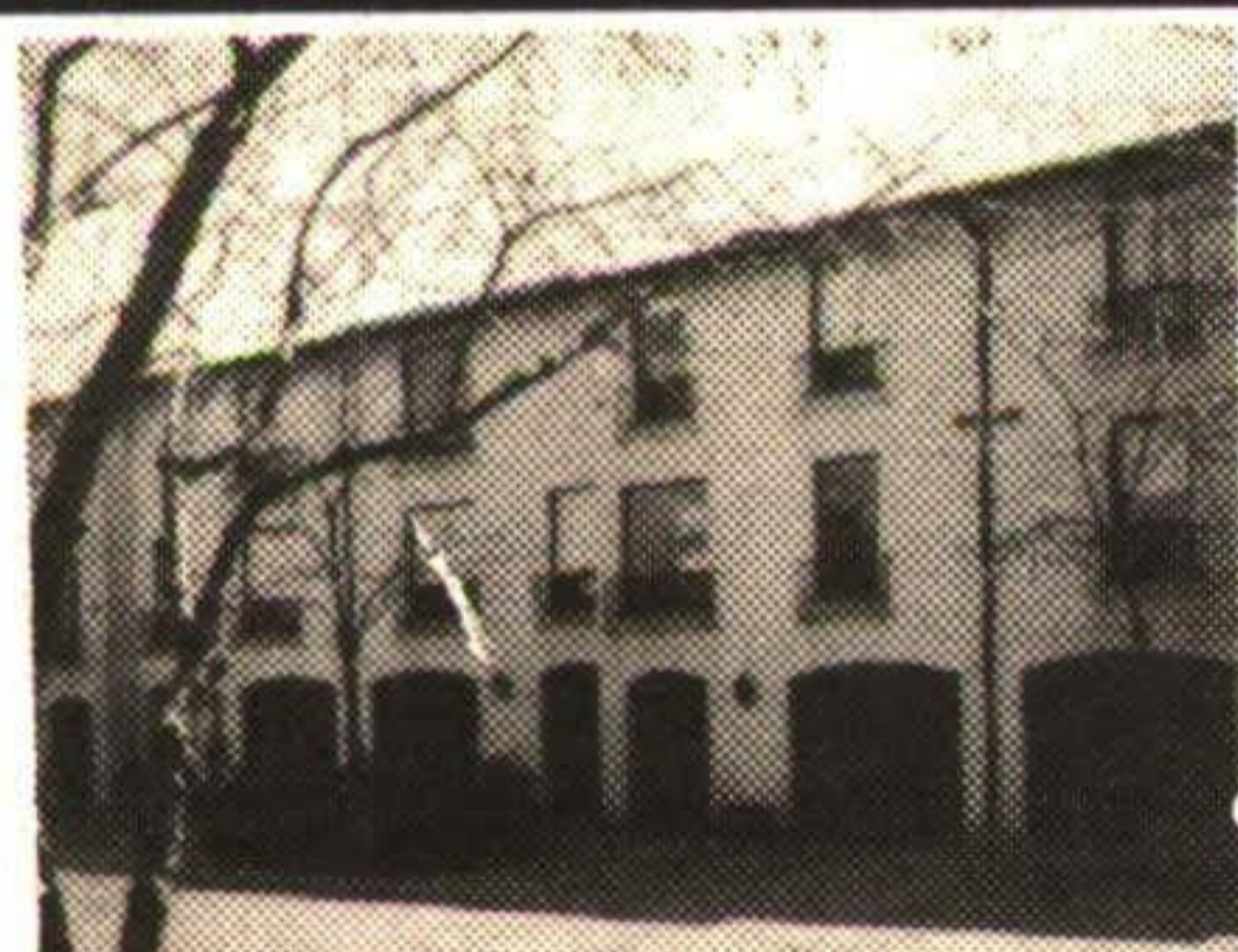
MISSISSAUGA - GREAT BEGINNINGS