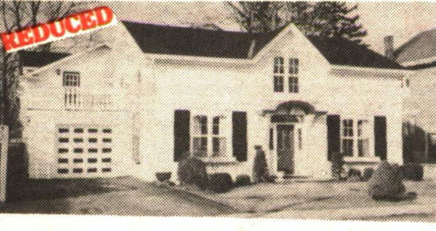
GEORGETOWN'S BEST - $274,900