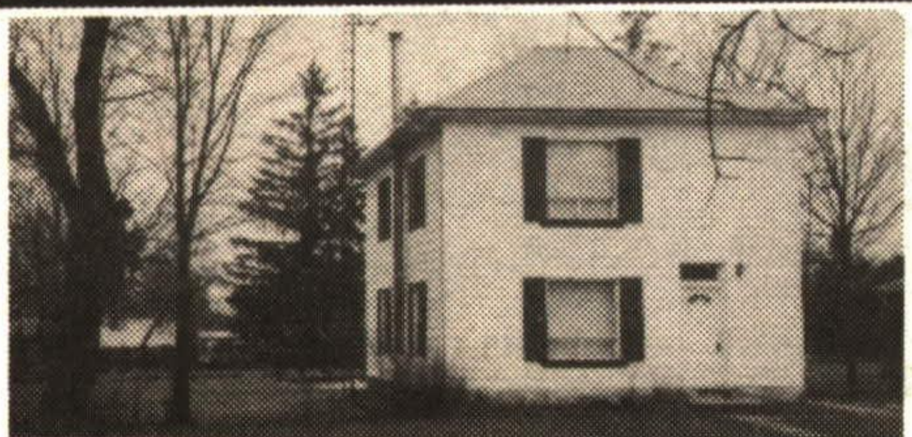
ERIN - PRICED RIGHT