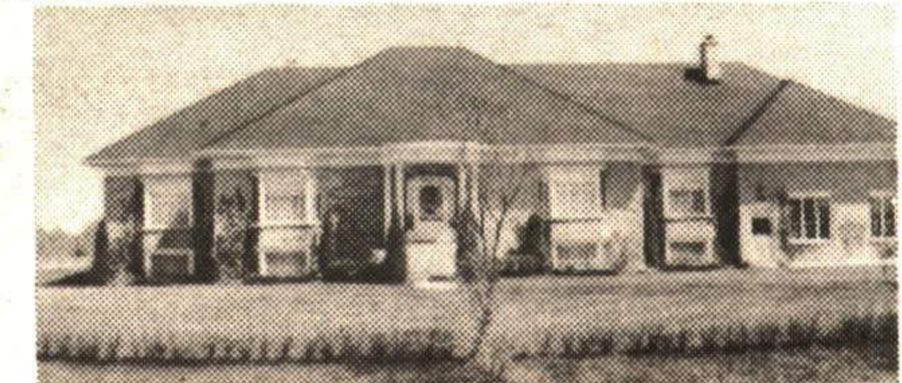
EXECUTIVE REQUIRED ROCKWOOD $399,000