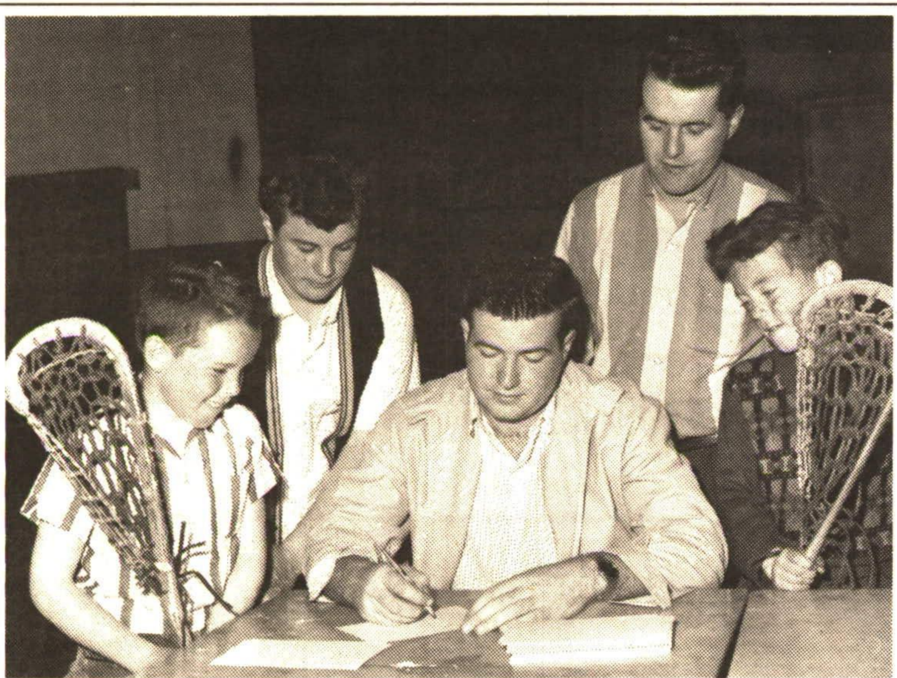
Remember when: The date was May 21, 1966 and lacrosse sign-up was held in Acton as boys of all ages dropped by to play the sport which has been prevalent in Acton for so many years.