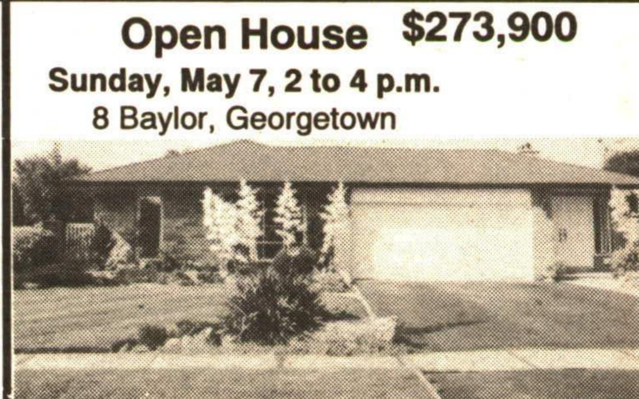
Open House $273,900 Sunday, May 7, 2 to 4 p.m. 8 Baylor, Georgetown

Large family room with brick fireplace, master bedroom has semi ensuite, 2 more good sized bedrooms, living room/dining room, big kitchen. Single car garage. Call Mary Maan*. 31-118