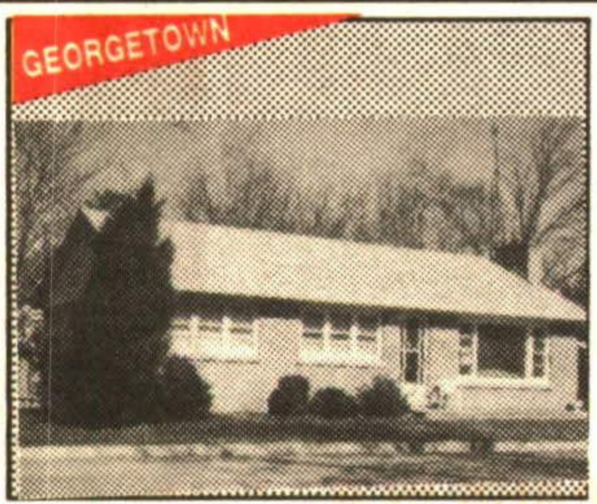
IN THE "PARK"