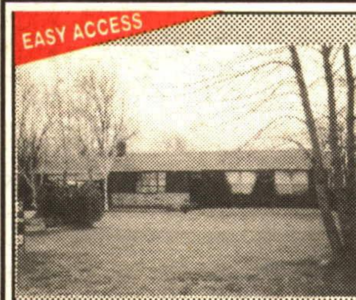
COUNTRY WITH CONVENIENCE

Elegant 4 bedroom home in spotless condition. Beautiful antique brick fireplace in the family room, extensive decking off the greenhouse kitchen to the fenced, well landscaped yard. Loaded with expensive extras, and shows like a dream. Priced to sell at $234,900. 95-2-312