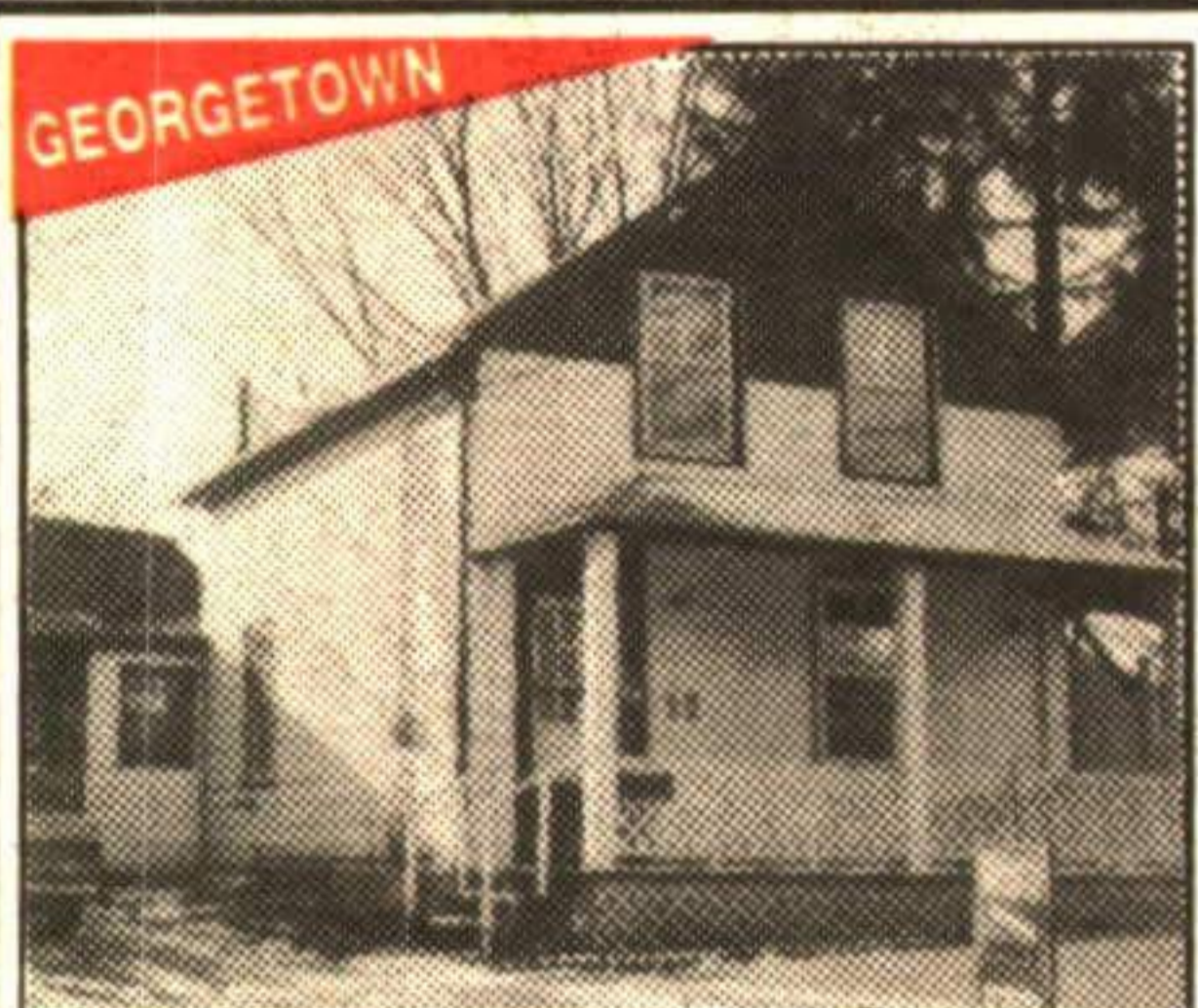
NEW PRICE $144,900!

Spacious & bright, this 4 bedroom multi-level home is filled with luxurious features - Gourmet kitchen, main floor family room, spa room, spacious master suite with balcony. $249,900. 95-2-346