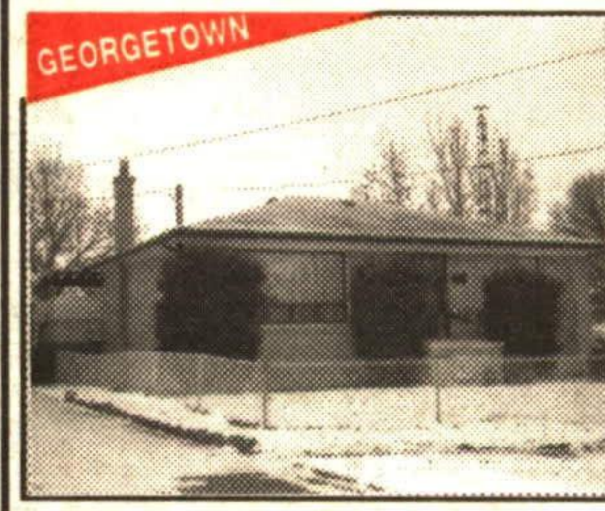
GREAT LOCATION, GREAT VALUE!!

Beautifully decorated & upgraded throughout. Four bedrooms, family room, lovely eat-in kitchen, semi-ensuite and on a mature treed lot in Georgetown. 94-2-137