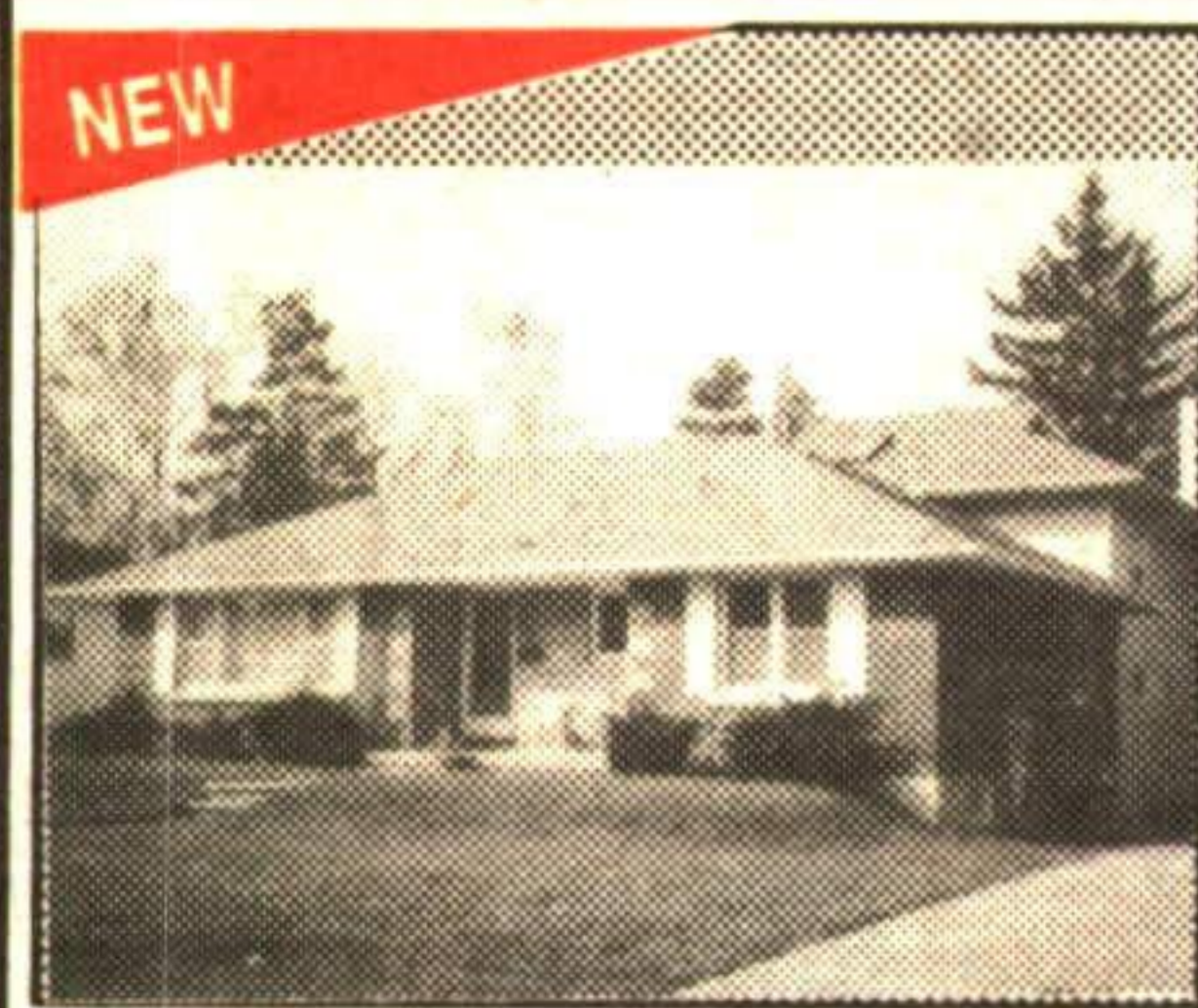
LARGE 'PARK' DISTRICT HOME

ARTHUR F. JOHNSON & ASSOCIATES LTD., REALTOR